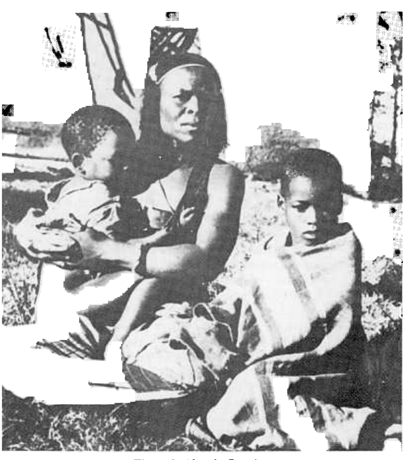
Figure 3: After the Burnings

from Kokstad to Umtata was effectively closed to most traffic. The maximum fine a chief could levy was increased from £25 to £50,36 whilst they were also given the power to banish tribesmen. These additional powers were never revoked. De Wet Nel placed the sole blame for the rebellion on "communist agitators" from outside the Transkei who "were doing all they can to wreck ... the positive development of Bantu Authorities in the area".37 In addition, he asserted that the newspapers assisted the campaign, by alleging that there was widespread dissatisfaction with the Bantu Authorities system.38 Subsequently, the police conducted sweeping raids in the district against tax evaders. As a result of this action, many boycotters resumed paying their taxes. 39 A "Bantu Home Guard" was established under the control of the chiefs. Through the Emergency measures and police action, the resistance was effectively suppressed. By January 1961, the consumer boycott had ended, whilst in Lusikisiki hundreds of tribesmen were forced to apologise publicly to Chief Botha Sigcau. 40 However, by 20 April 1961, 524 alleged participants of the rebellion remained in police detention.41