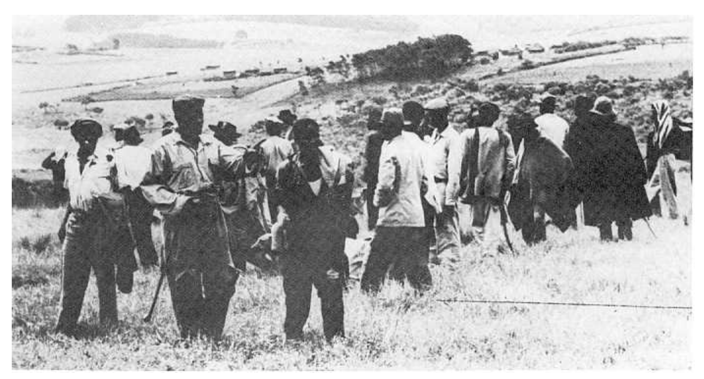
Figure 2: The "Mountain Gathers"

Finally, on 30 November 1960, a partial State of Emergency was declared in five districts of Pondoland namely Bizana, Flagstaff, Mount Ayliff, Takankulu and Lusikisiki. Entry without a permit was prohibited to all except residents of the area, medical doctors, clergy and government officials. This meant that the national road