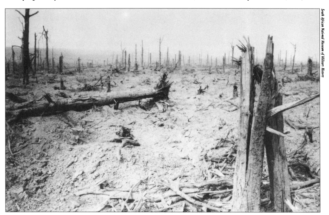
ORAL HISTORY AUTUMN 1997 WAR AND PEACE