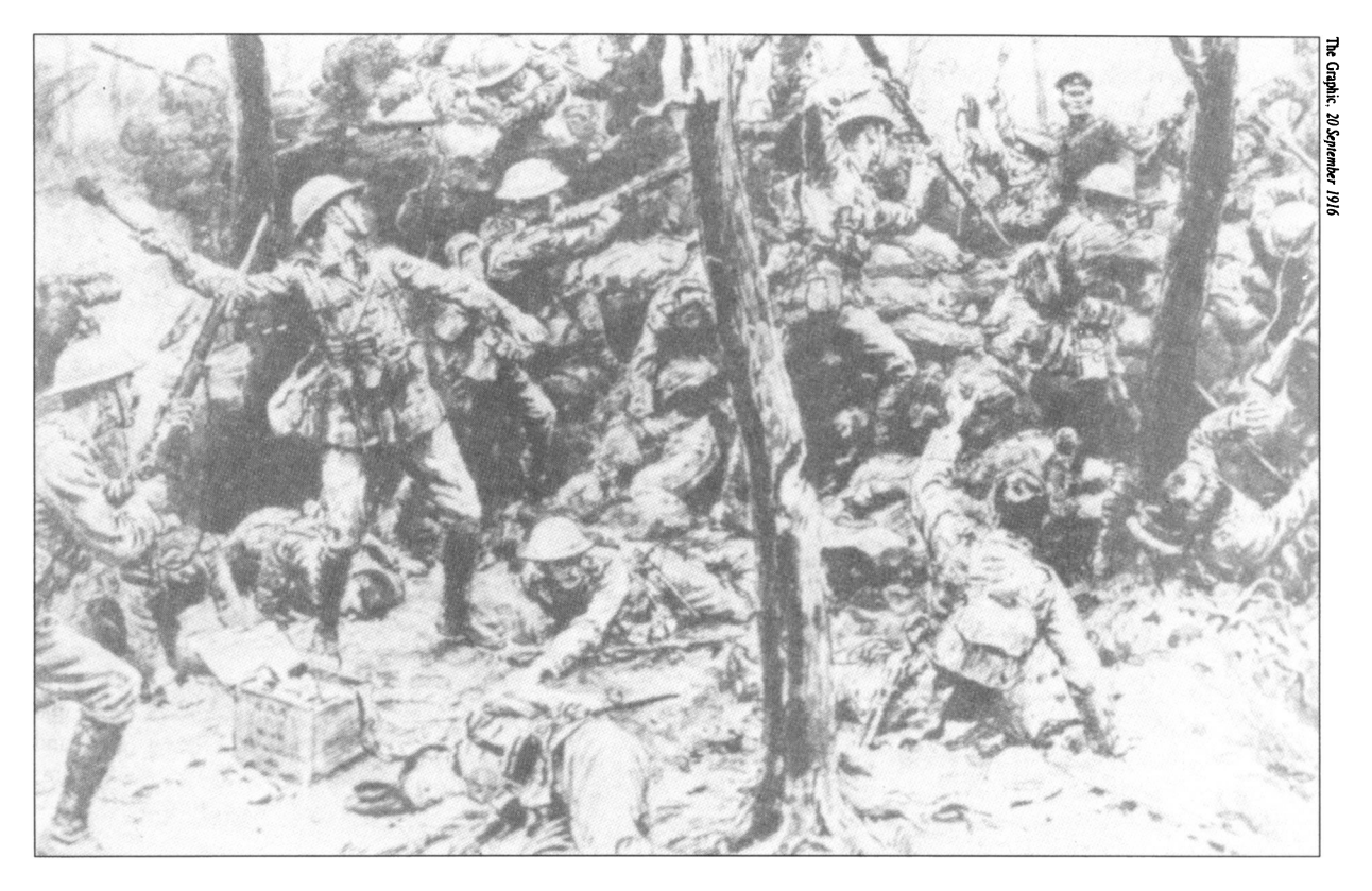
'The Springboks repel a German counter-attack in Delville Wood' (above); Delville Wood, September 1916 (below).