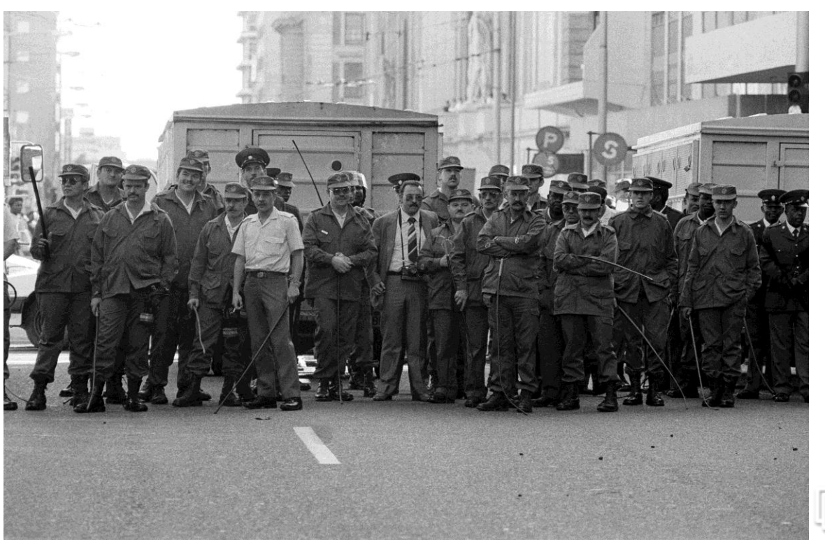
Police with sjamboks, Plein Street (c.1986)