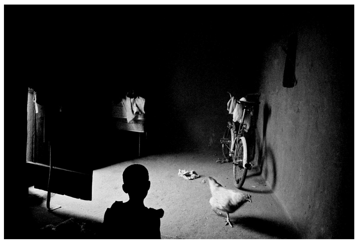
A family bedroom, Vaalrand (1988)