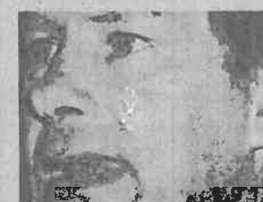
Dr VAN ZYL SLABBERT