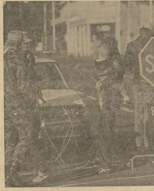
Police in camouflage were on standby as members of the public were excluded from the blast area yesterday.

"Excellent work" had been done over the weekend, he added. "Interesting and important clues had already been discovered." Mr le Grange repeated his belief that this was the work of the African National Congress and he warned that similar attacks could be expected in the course of this year. He was convinced the police would track down the guilty and said teams of investigators were working around the clock on what was essentially a slow business. Mr le Grange offered no comment on reports that two "whites" who had come from Botswana were possibly responsible for the explosion or that the bomb — apparently weighing 60 kg — had been detonated by a radio signal.