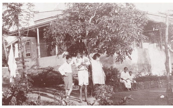
Sarvodaya (Welfare of All), Gandhi's cottage at Phoenix Settlement. Ela Gandhi seated with her mother

on a weekly basis. An oil engine was installed for working the press as well as a hand-driven wheel. The engine proved troublesome and for some time the paper had to be worked with hand power only. In early stages all the settlers had to work late into the night before the day of publication. Every member of the settlement also had to learn the tedious work of type-setting and all had to help in folding and wrapping the page sheets.