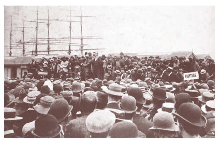
Anti-Indian demonstration being addressed by Harry Escombe at Alexandra Square on 13 January 1897