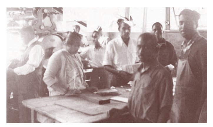
Phoenix Settlement printing works where members hand printed the Indian Opinion

The plots at Phoenix Settlement were not fenced in and, instead, narrow paths and roads divided one building from another. Settlers constructed houses of corrugated iron. Within two or three months the settlers had built eight houses of corrugated iron with rough wooden supports. Gandhi's house, <code>Sarvodaya</code>, consisted of one big room which served as s living and dining room, two small bedrooms, a small kitchen and a rough bathroom. A hole was cut in the iron roof of the bathroom and a shower set up by balancing a garden watering can on a piece of wood; attached to the can was a piece of cord which was used to tip the water out of the can. Each house had its own little toilet where a bucket system was installed and each householder was responsible for the emptying of the bucker at a site set aside for that purpose. Apart from printing and agriculture, education became a vital service at Phoenix Settlement and a boarding school was later established with the help of Dr Pranjivan Mehta, Gandhi's friend from his student days in London.