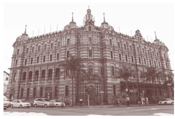
The old Durban Railway Station on the corner of Monty Naicker Road and Soldiers Way as it stands today. Two floors were added to the building in 1904. When the station moved to a new location in Umgeni Road, the building was retained and converted to offices

It was from Durban Station that Gandhi embarked on the fateful train journey that, in later years, he regarded as having changed the course of his life. He boarded a train at the Durban Station on 7 June 1893 in order to travel to Pretoria, where he was due to meet with Dada Abdullah's legal advisers. A first class seat was booked for him. The train reached Pietermaritzburg Station at about 9pm. A white passenger entering the compartment was disturbed to see it occupied by a 'person of colour' and returned with two officials who ordered Gandhi to move to the van compartment. Gandhi protested that he had a first class ticket and was therefore entitled to be in that compartment. A white constable was called, who took Gandhi by the hand and pushed him out of the train. His luggage was also taken out and the train continued without him. Gandhi spent the night in the waiting room. While he had his hand-bag with him the railway authorities had taken charge of the