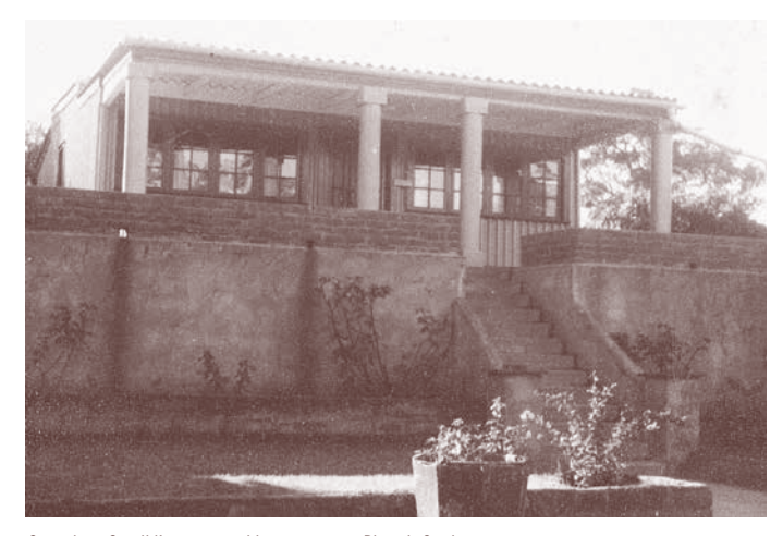
Sarvodaya, Gandhi's corrugated iron cottage at Phoenix Settlement

"Phoenix is a very good word which has come to us without any effort on our part. Being an English word, it serves to pay homage to the land in which we live. Moreoner, it is neutral. Its