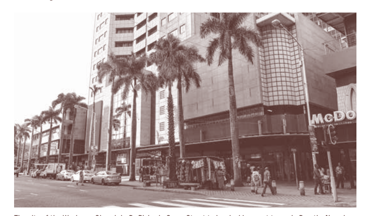
The site of the Wesleyan Church in Dr Pixley kaSeme Street today, looking east towards Dorothy Nyembe Street with Mercury Lane to the right