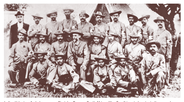
Indian Volunteer Ambulance corps Stretcher Bearers, South African War, Gandhi seated centre in the second row

carpenters and masons who had worked with Gandhi in the Indian Stretcher Bearer Corps during the South African War, a shed was erected for the press. The shed was ready in less than a month. At first the settlers lived under canvas while erecting dwellings on the property. Gandhi described the place as being uninhabited, thickly overgrown with grass, infested with snakes and dangerous to live in. However the settlers were undaunted.