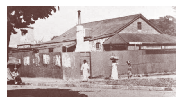
Saint Aidan's Mission Hospital at the corner of Cross Street and David Webster Street (Leopold St) was the first hospital in Durban for the health and needs of Indian people. The hospital was founded by Dr Booth whom Gandhi visited regularly to assist in caring for the sick

[Saint Aidan's hospital moved to its present location in M.L. Sultan Road, formerly Centenary Road in 1935. The old mission hospital building has been demolished, only the foundation remaining and the site is used as a parking area.]