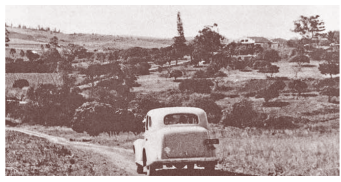
The roadway into Phoenix Settlement in the 1930s