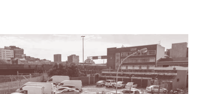
The site of Saint Aidan's Mission Hospital. All that remains are the foundations of the building which today serves as a car park. Saint Aidan's Hospital was moved the present location in M.L. Sultan Road in 1935