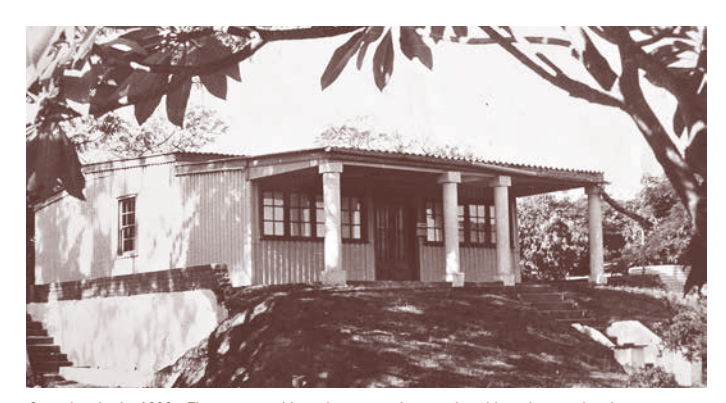
Sarvodaya in the 1930s. The corrugated iron sheets were later replaced by asbestos sheeting

significance, as the legend goes, is that the bird phoenix comes back to life again and again from its own ashes, i.e. it never dies. The name Phoenix, for the present serves the purpose quite well, for we believe the aims of Phoenix will not vanish even when we are turned to dust."