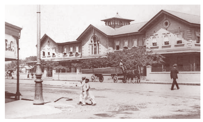
The Durban Magistrate's Court circa 1900. The Court was officially opened on 24 May 1866. On 8 April 1891 the north wing (towards Dr Pixley kaSeme Street (West St) was added to the building providing new offices. Another court room was added to the south wing and opened on 16 November 1897. The building served as a Court House until 1912. Thereafter the Durban Municipality acquired the building. The Court House became home to the Local History Museum in 1965, and the building was declared a National Monument in 1975