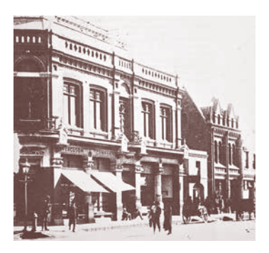
Ferguson's Corner circa 1899/ Gandhi's law office was located in this building between 1895 and 1896

[Ferguson's Corner has long been replaced by a more modern building which houses retail and commercial companies].