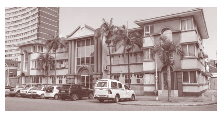
Cato Square, the vicinity where Cato's Creek ran down to the Bay