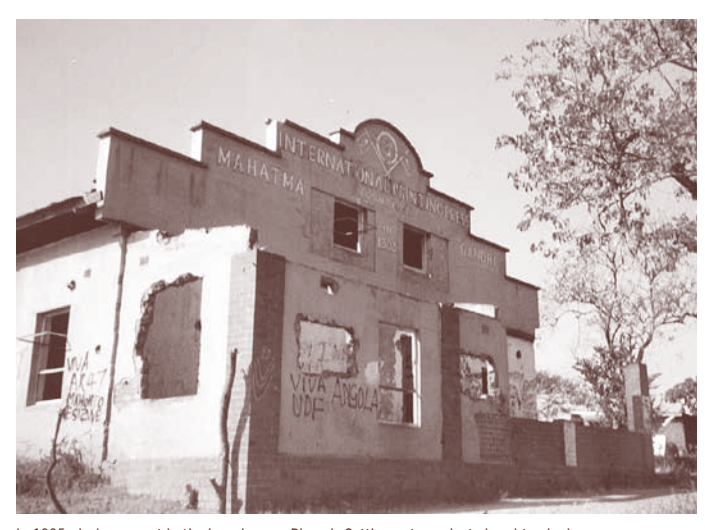
in 1895, during unrest in the Inanda area Phoenix Settlement was looted and torched