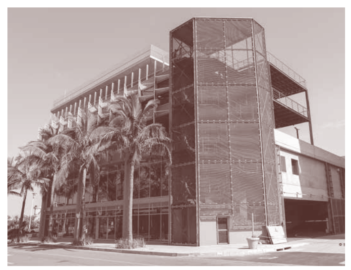
The site today of the anti-Indian demonstration of 13 January 1897 located at the Point on the corner of Signal Road off Mahatma Gandhi Road (Point Rd)