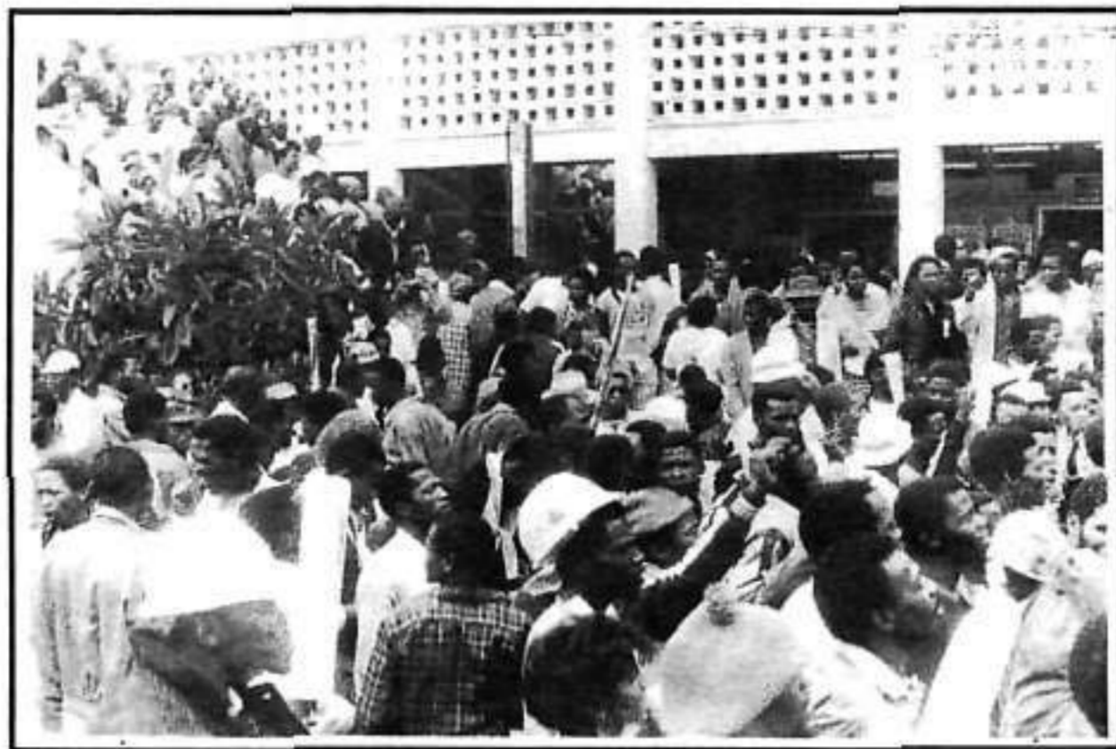
Diketsahalo tsa matshweletshwele a batho: Ba bang ba balpelaetsi kante ho ntlokolo ya Eskom.

• Hore Eskom e se ke ya tswellapele ka diketsahalo