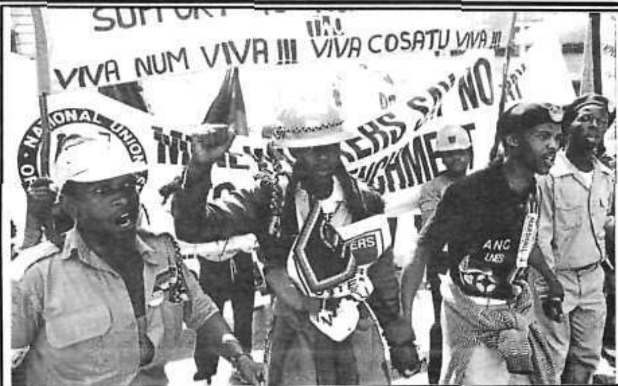
Demand for better wages: part of mineworkers demonstrating against poverty wages.

The NUM has sent a number of workers to Cuba for training in fields such as engineering for periods of up to seven years.