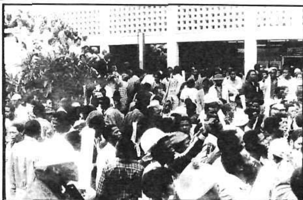
Mass action: some of the protestors outside Eskom's head office.

• Eskom will not carry on any privatisation activities, in-