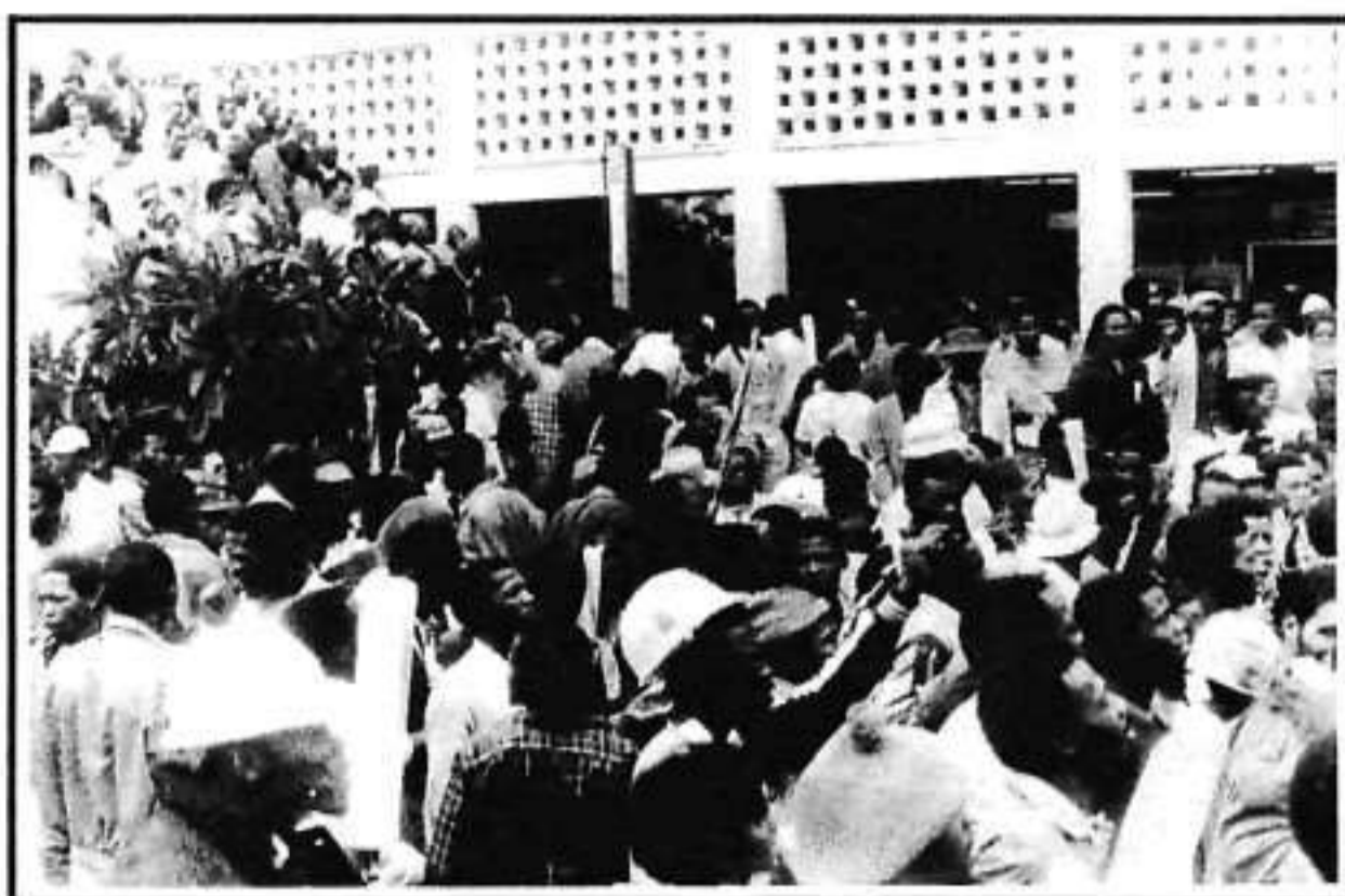
Intshukumo yeninzi kwi-ofisi ze Eskom

* I Eskom mayingaqhubeki nemicimbi yabucala kunye nemida yabucala.