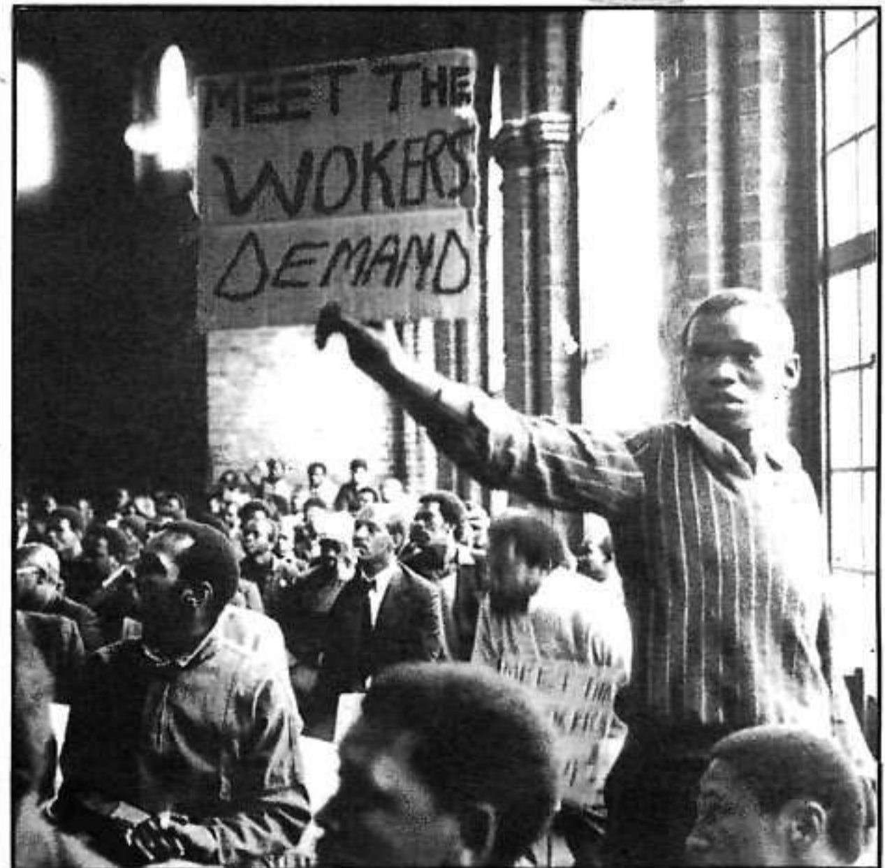
Message from the heart: a worker at a report-back meeting expressing his feelings

The settlement affects nearly 88.000 workers.