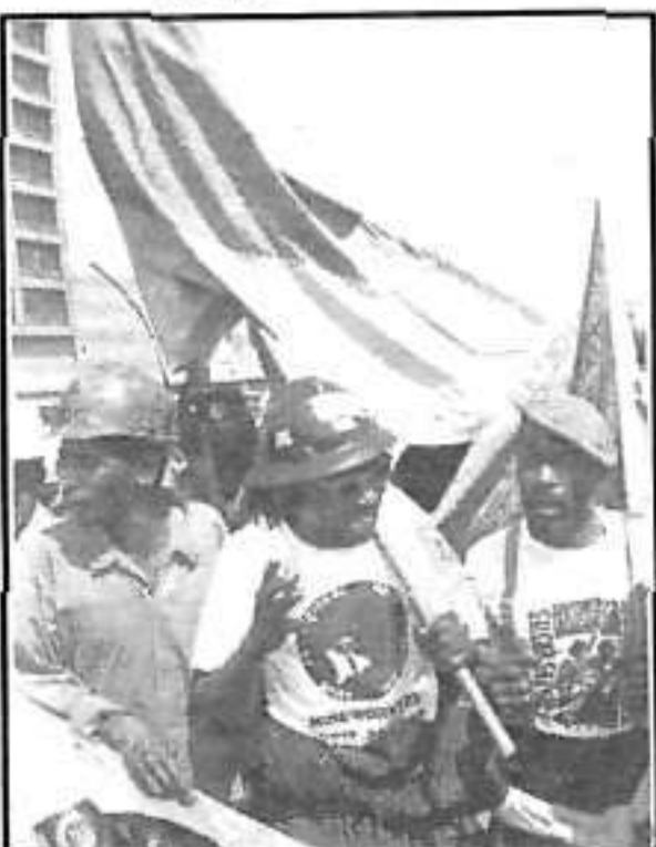
Show of force: mineworkers out in the streets of Johannesburg.

Demands included the abolition of the mines' private army, recognition of NUM by mines, declaration of a moratorium on retrenchments, turning hostels into family homes, removal of racial discrimination, an end to union bashing and the installation of an Interim Government.