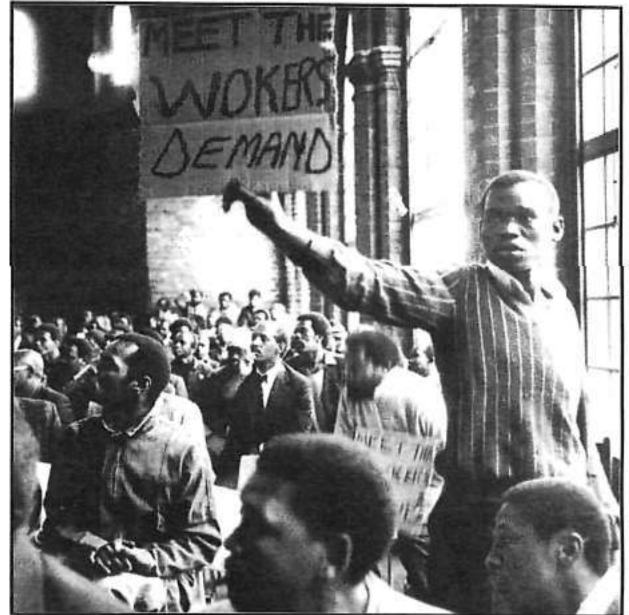
Molaetsa o tswang pelong: mosebetsi kopanong eo ho neng ho fanwa ka pehelo ho yona, o hlahisa maikutlo a hae.

Basebetsi ba ka bang 88 000 ba anngoe ke tumellano ena.