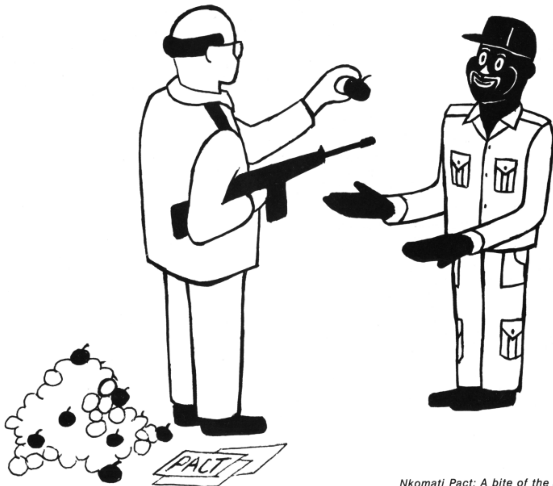
Nkomati Pact: A bite of the apple

He had just returned from Pretoria and Cape Town where he had been feted at some of the most fantastic places he had ever been to in all his life, and was eagerly awaiting a return trip. Only he did not know when that would happen.