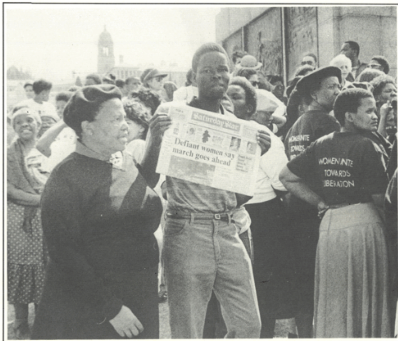
Women Against Repression march to Union Buildings, Pretoria.