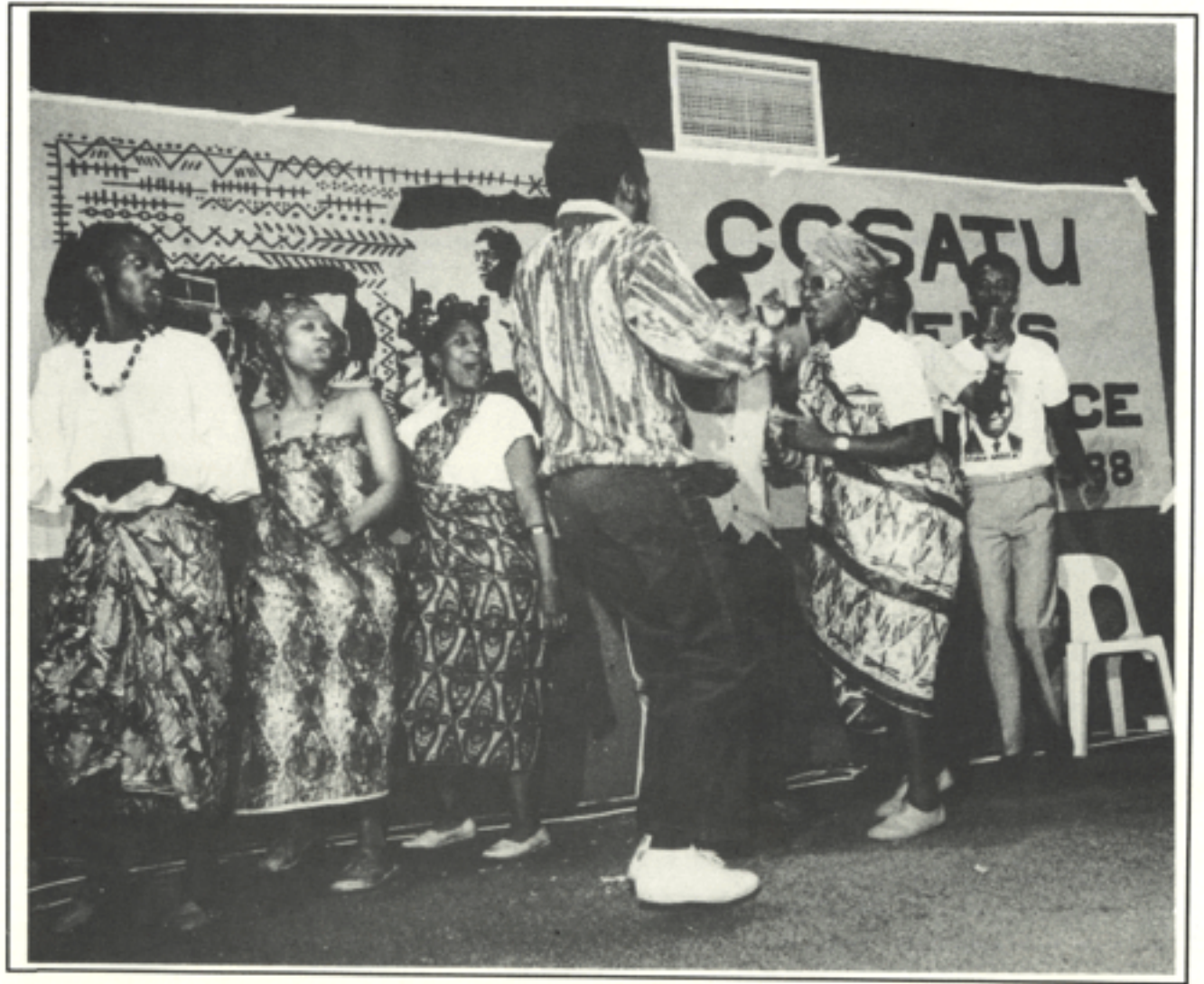
CosatU Women's Conference.

The Death Penalty Is A Violation Of Fundamental Human Rights And Is A Clear Demonstration Of State Vengeance And Terror Against The Oppressed