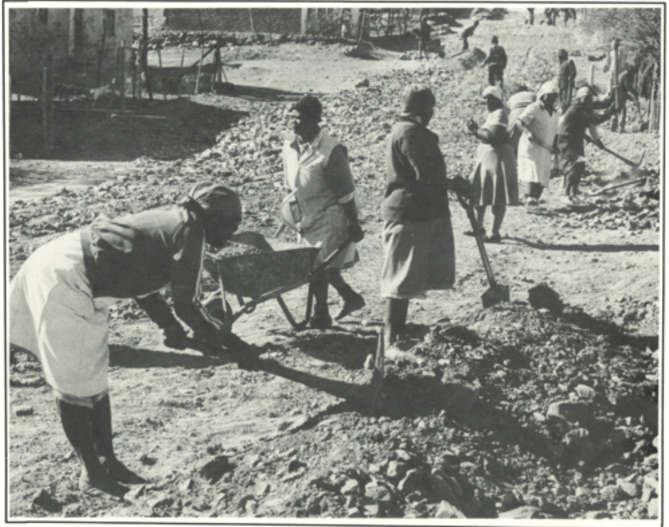
Women working for 50c a day in Bricksfield location.