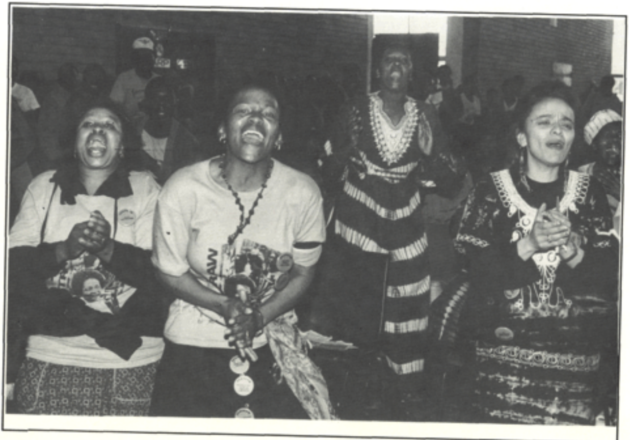
Women's Day Rally, 1989.

As Members Of The National Liberatory Movement And Trade Unions, In And Through Our Various Organisations, We March Forward In The Struggle For Liberation And Defence Of The Working People. We Pledge Ourselves To Keep High The Banner Of Equality, Fraternity And Liberty. As Women There Rests Upon Us Also The Burden Of Removing From Our Society All The Social Differences Developed In Past Times Between Men And Women.