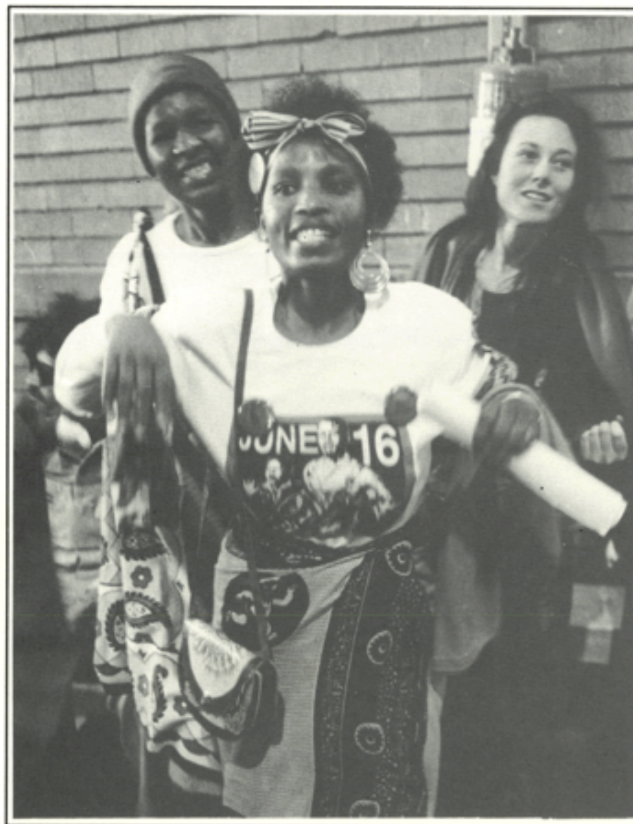
Women's Day Rally, August 1989.