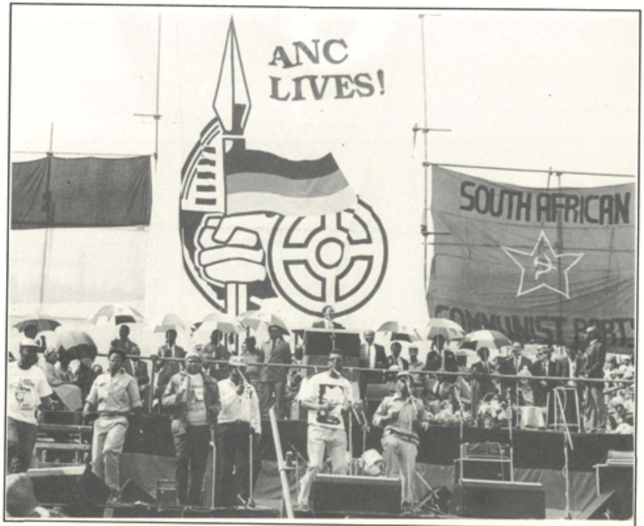
ANC Welcome Home Rally.