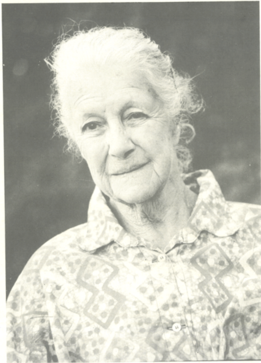
Helen Joseph 1989