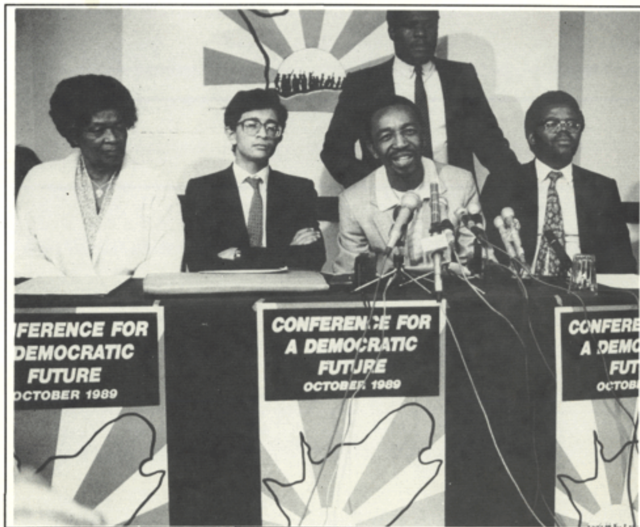
Conference for a Democratic Future, 1989.