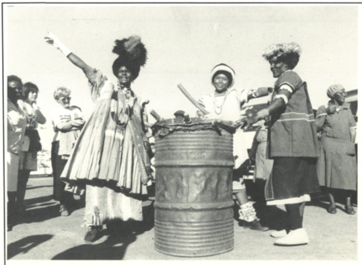
Women's Day Rally, Wits University, 1989.