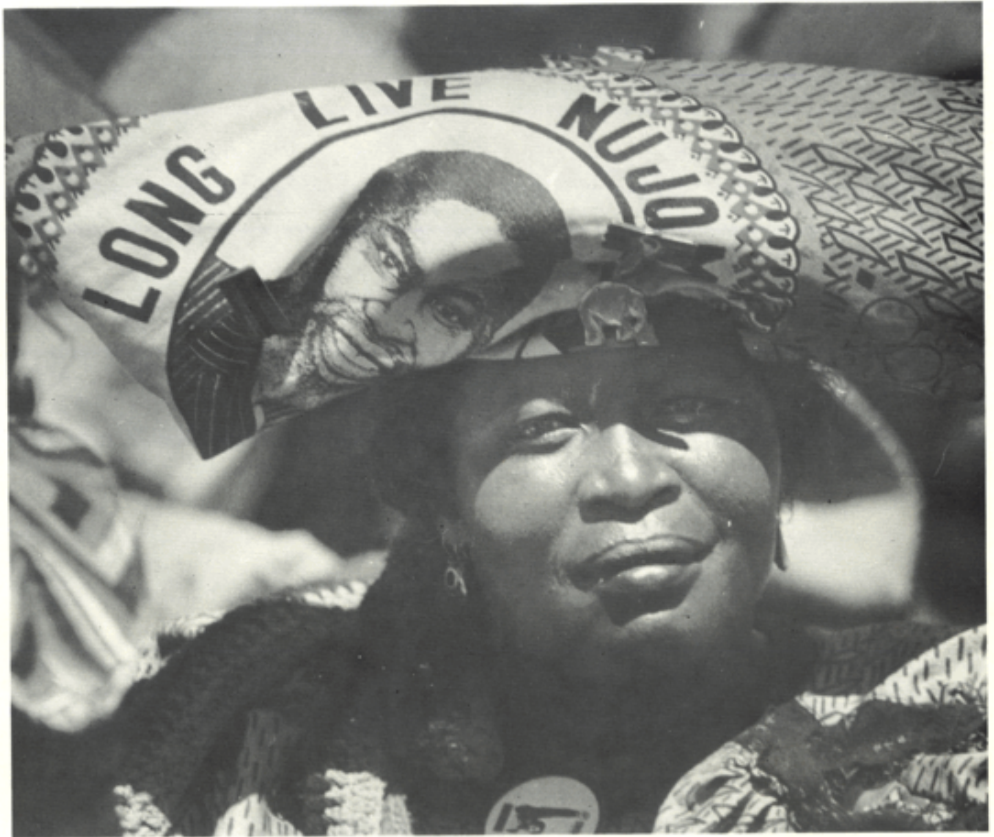
Swapo Victory, Namibia.