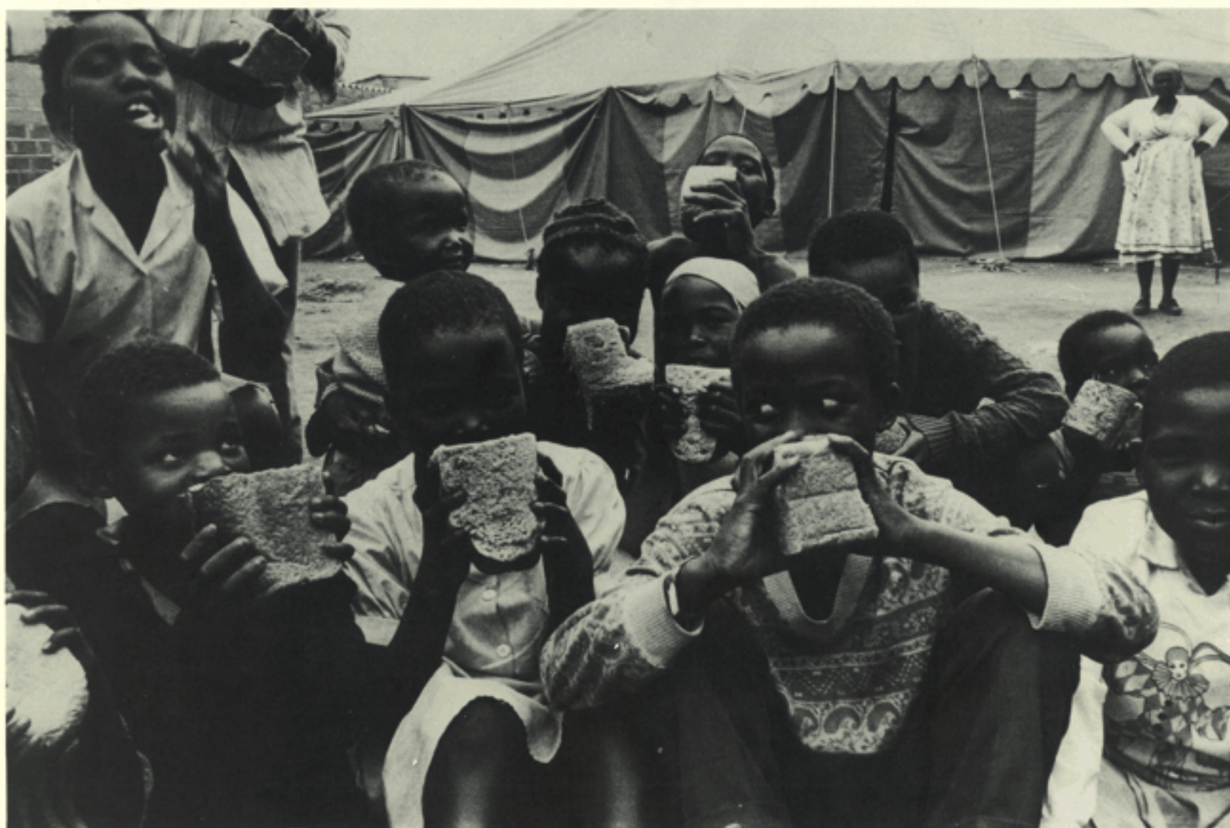
Bread for the hungry