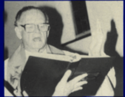
Archbishop Denis Hurley

Chairperson 154 Gordon Road Durban 4001 Tel: (031) 303-1417