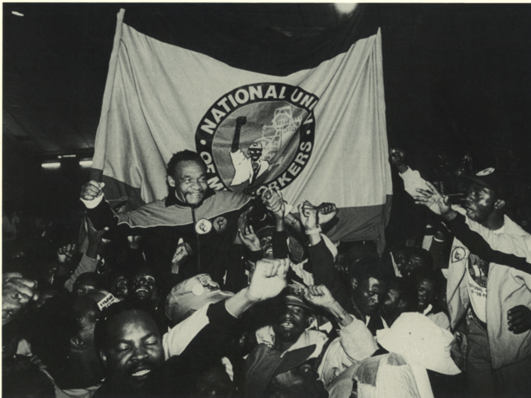
Elijah Barayi re-elected as COSATU president in Johannesburg, July 1987