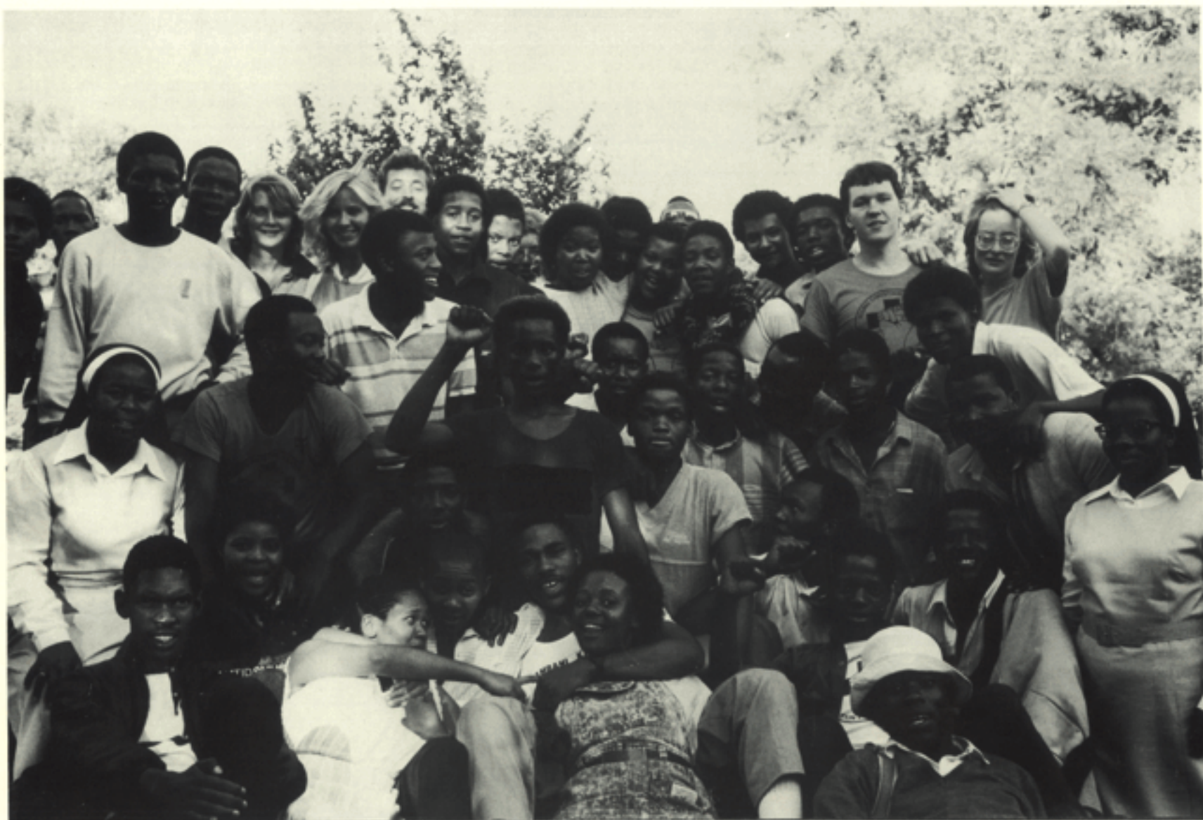
The Young Christian Students is a movement that uses the 'see, judge and act' method