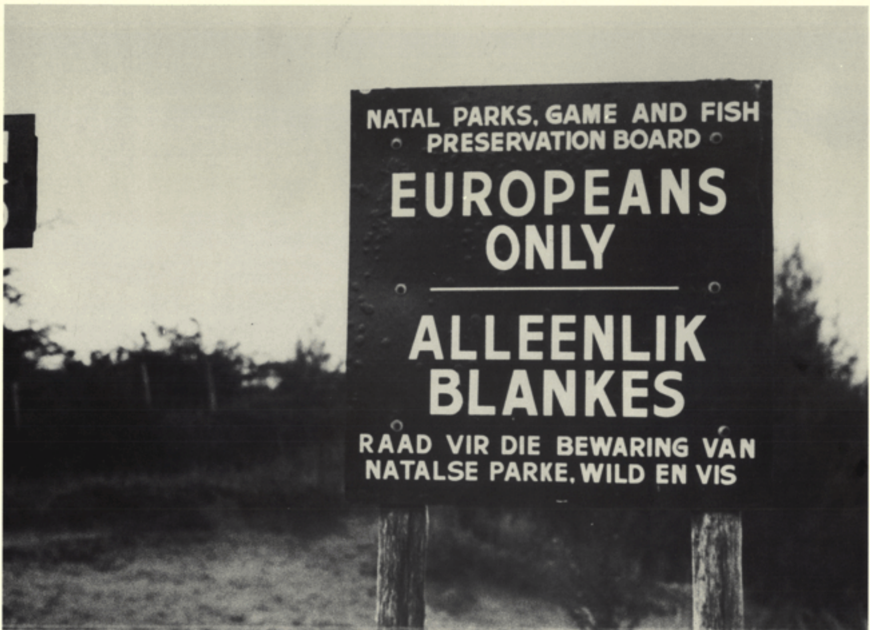
Natal Parks Board sign