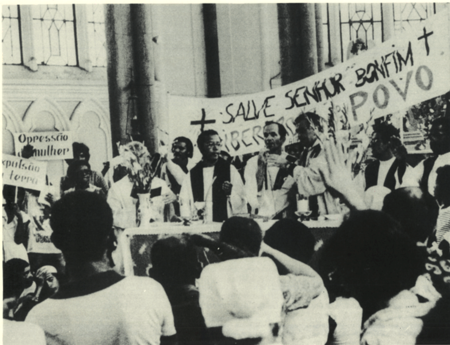
The Church in Brazil