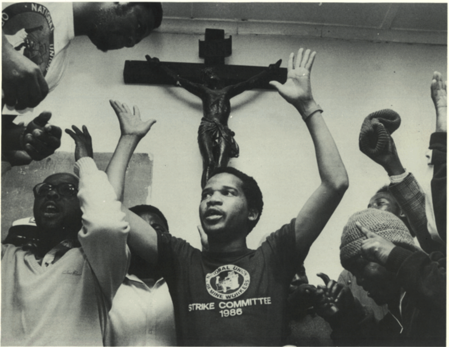
The National Union of Mineworkers on strike, August 1987