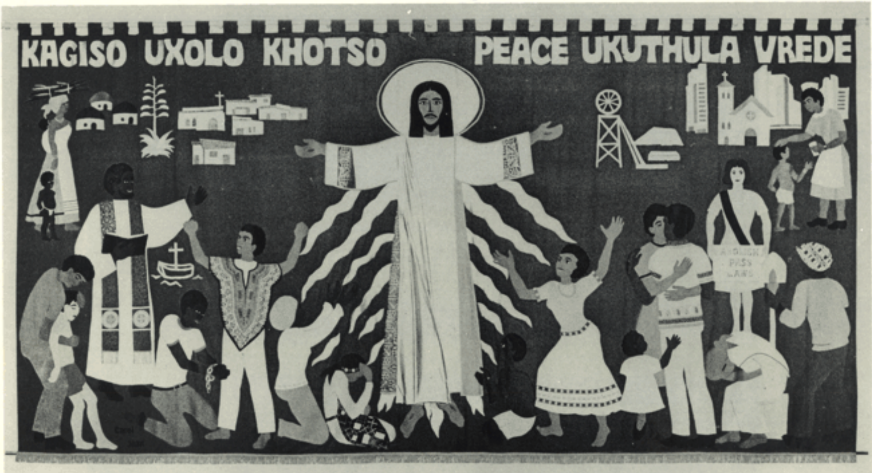
'Peace' in different languages on a wall mural that used to hang in Khotso House, Johannesburg