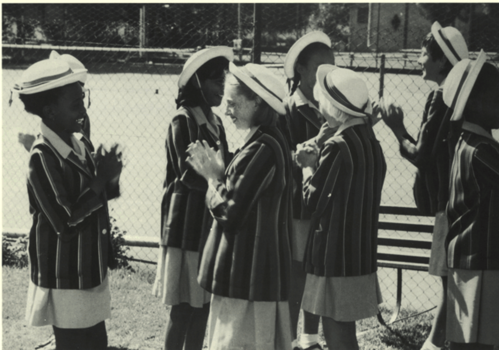
Pupils at McAuley House Convent, Johannesburg