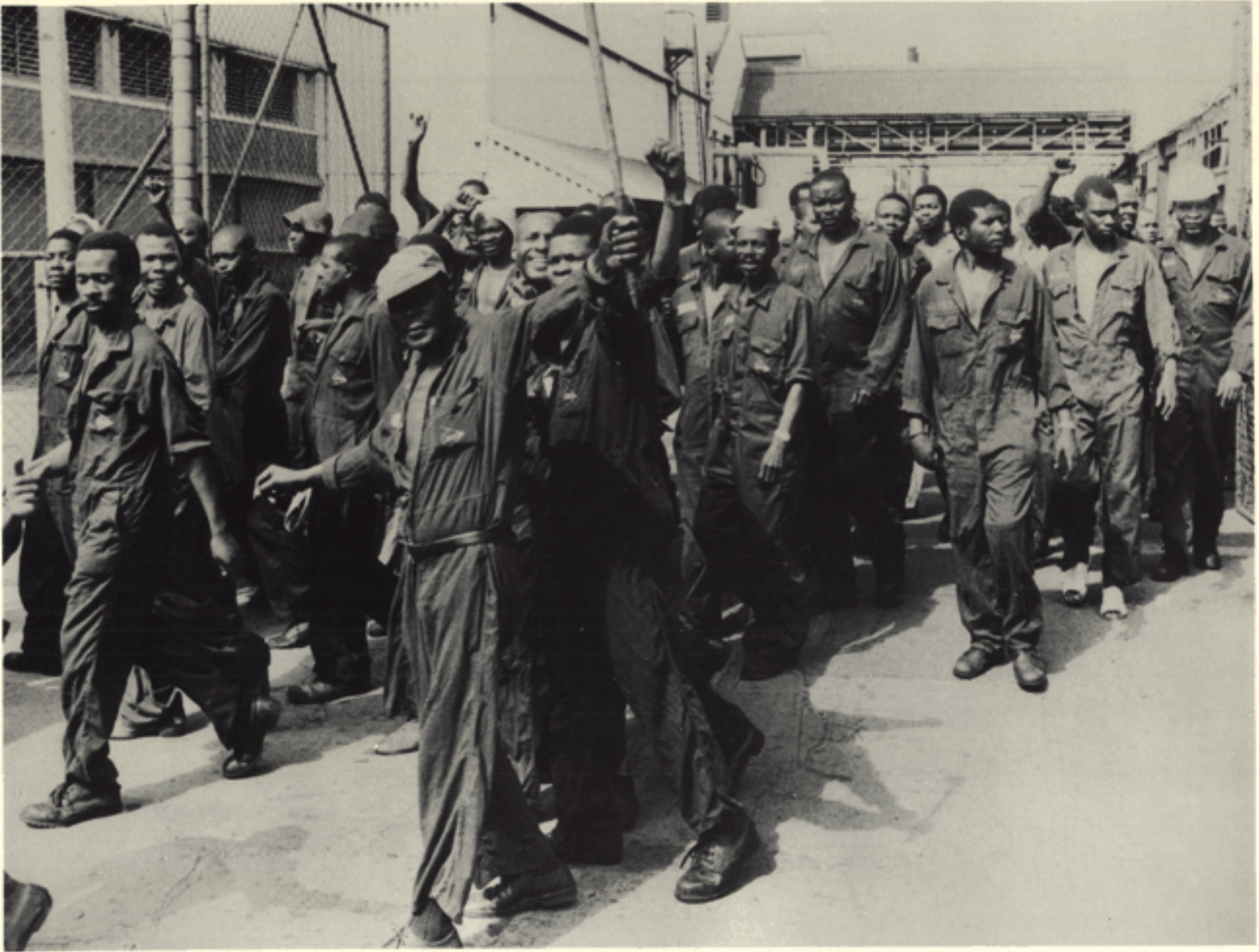
Workers at the Dunlop factory, 1987