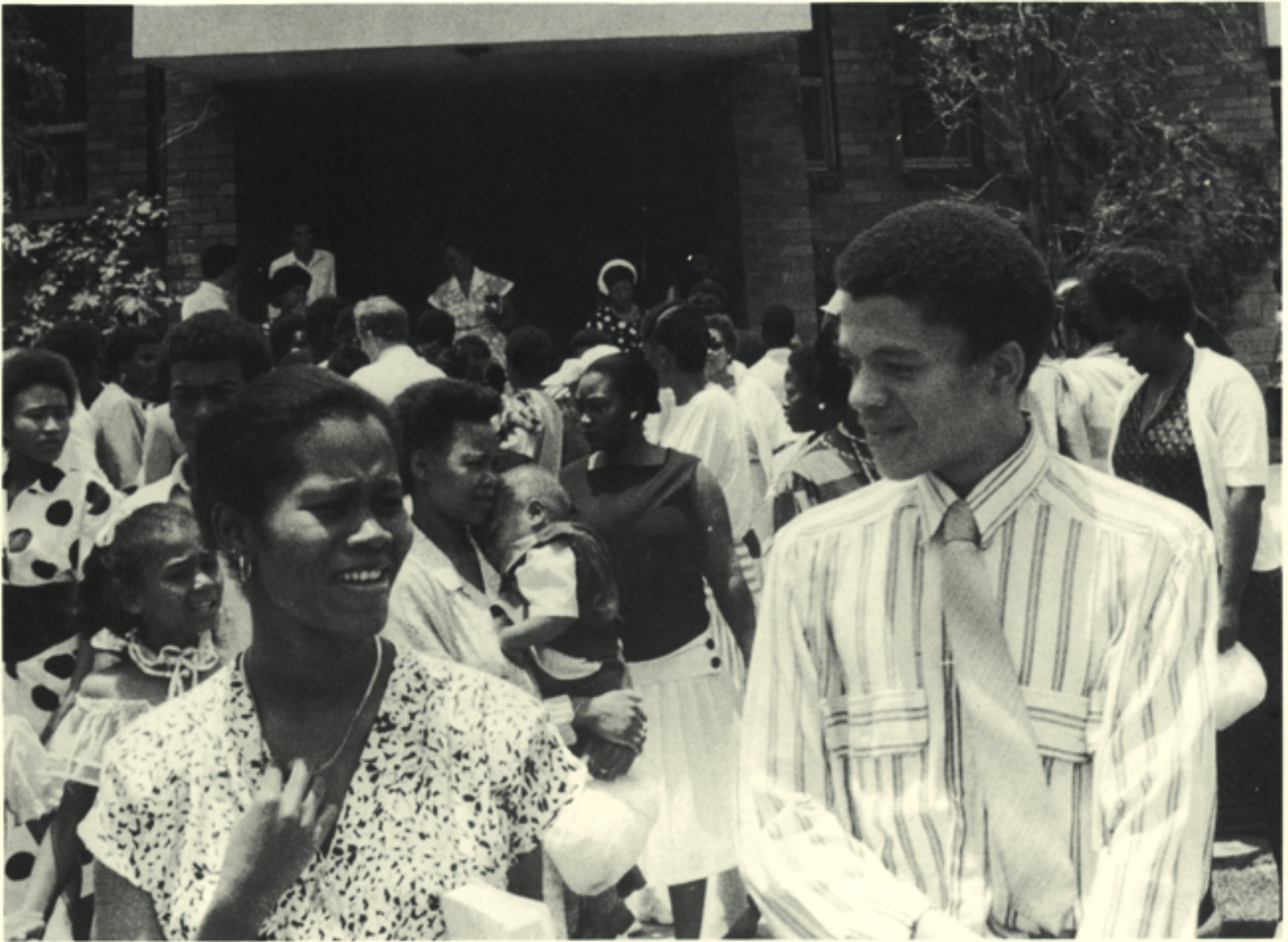
St Paul the Apostle Parish, Eden Park