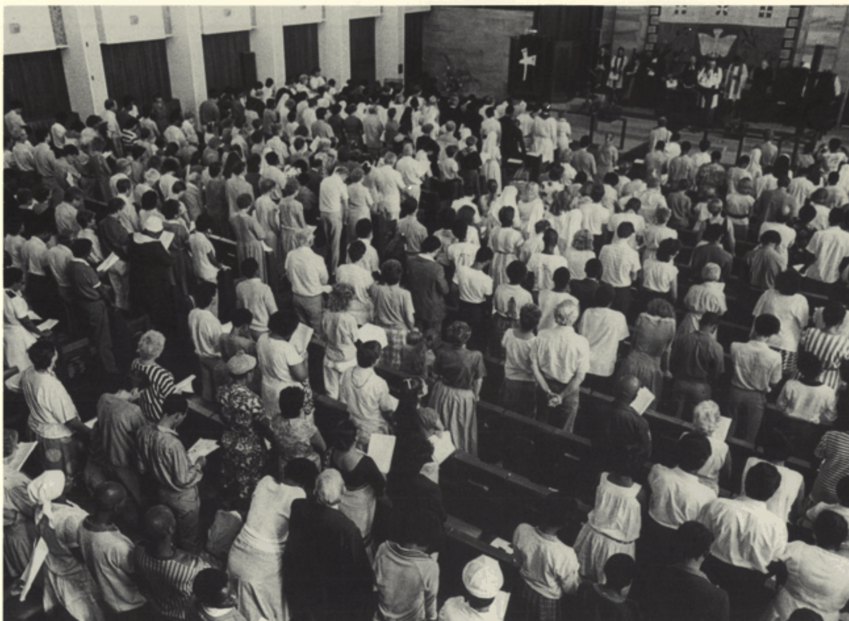
Good Friday service in Durban, 1 April 1988