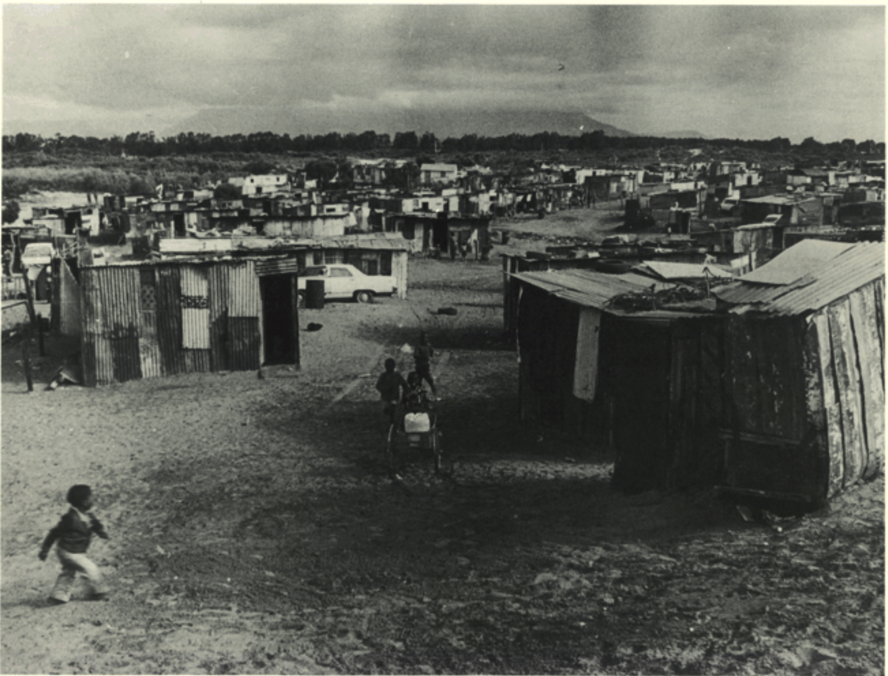
Crossroads squatter camp