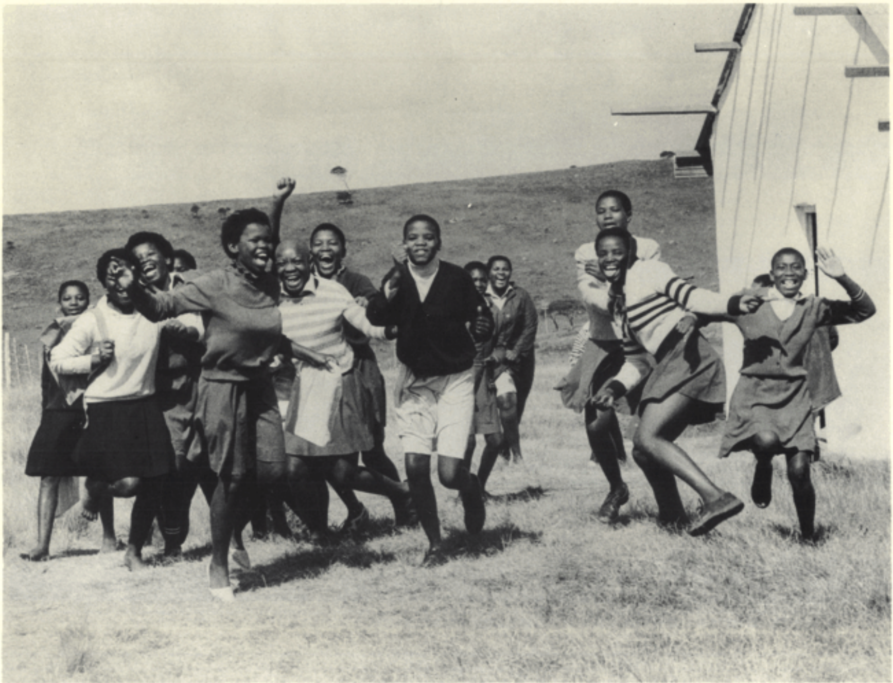
Schoolgirls outside a village school in Kwelerha, February 1986