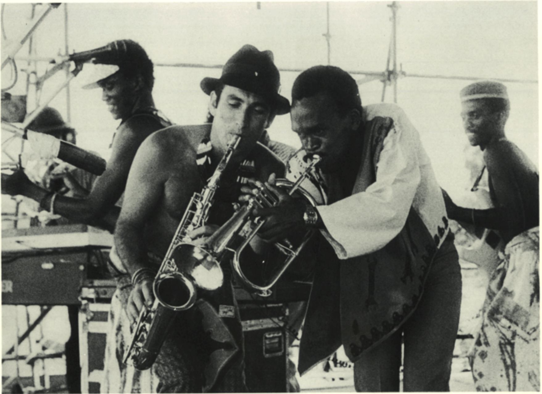
Musicians at the Free People's Concert, February 1987