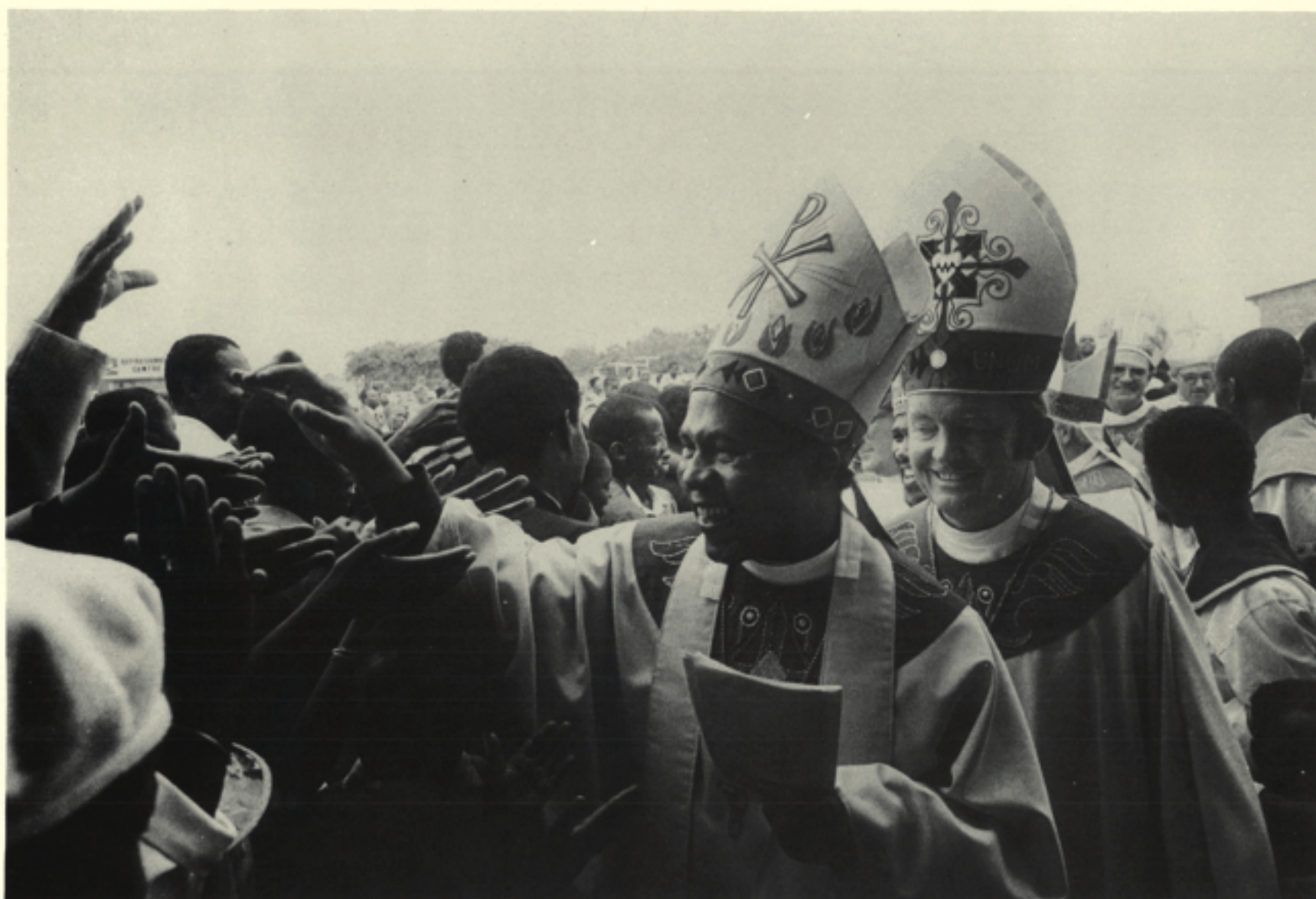
The Bishops visit Sebokeng, 1985