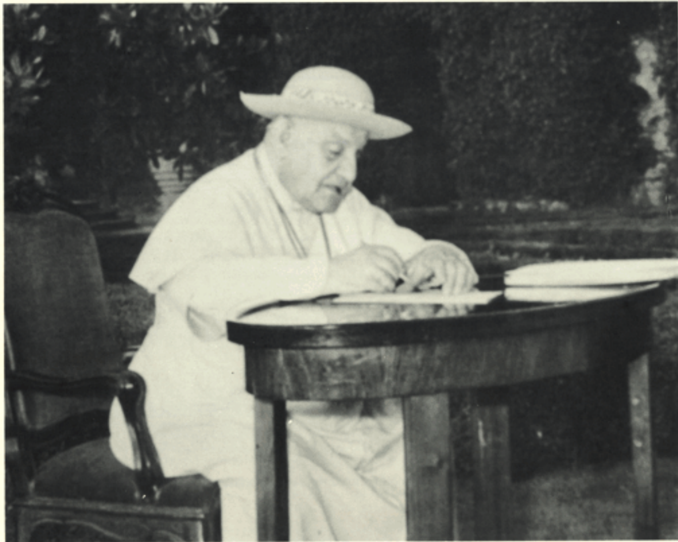
Pope John XXIII