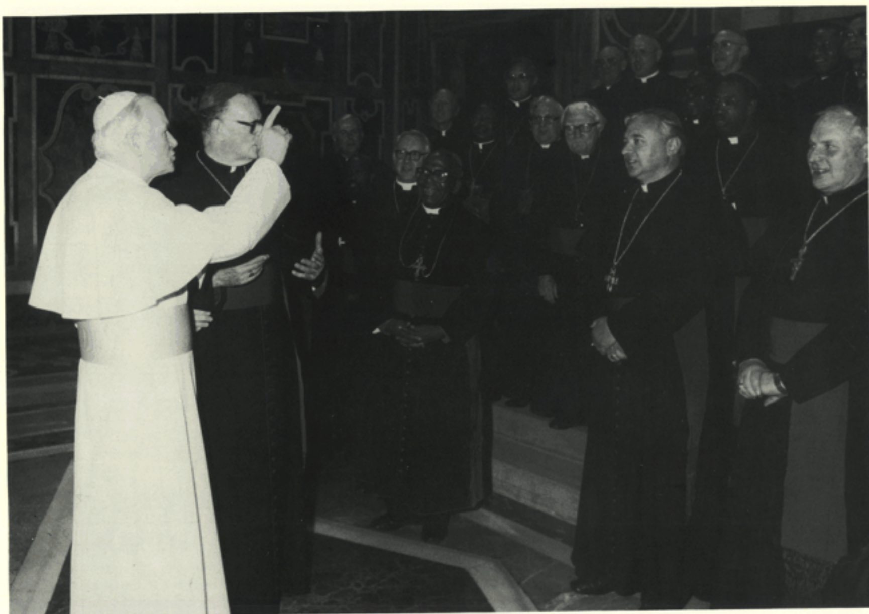
The Bishops' ad limina visit, 27 November 1987