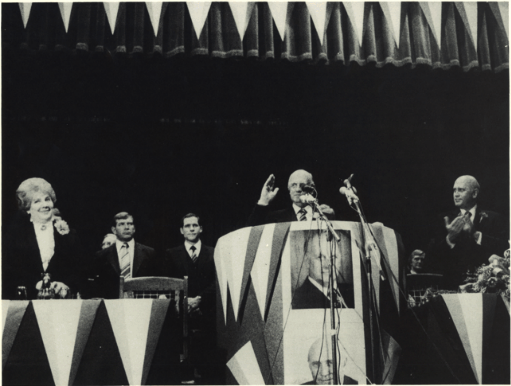
P W Botha at the N P Transvaal Congress, 1982