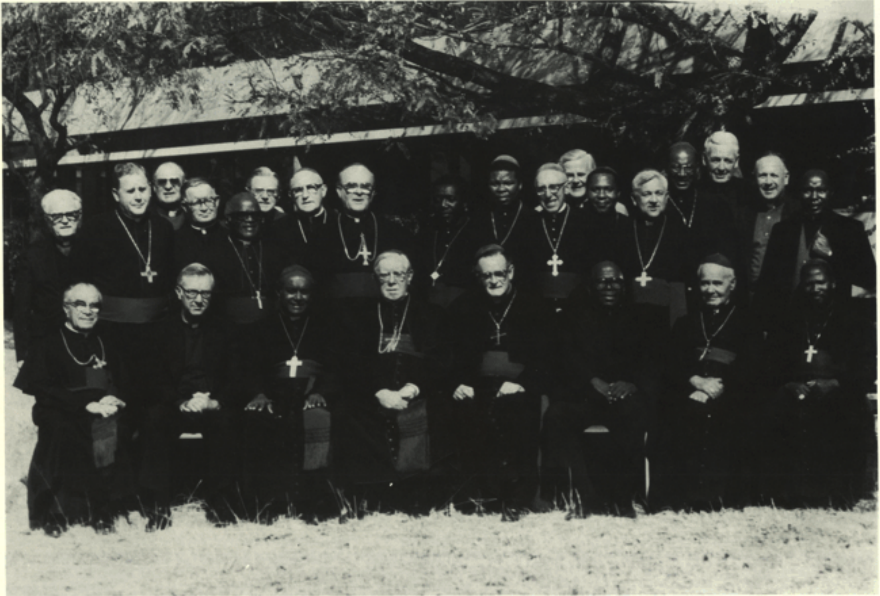
The Southern African Catholic Bishops' Conference 1982