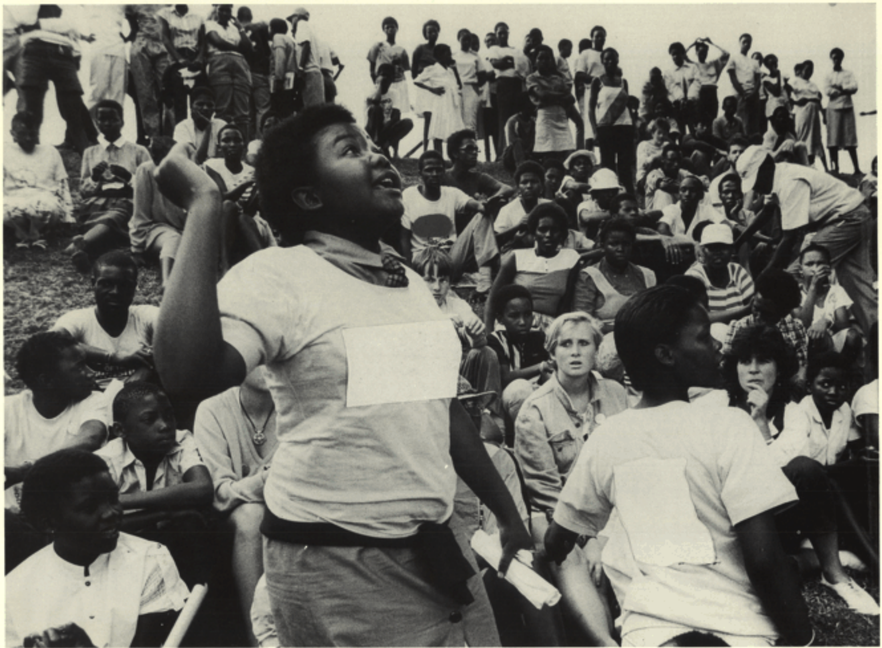
Catholic youth at a picnic, Zoo Lake in Johannesburg