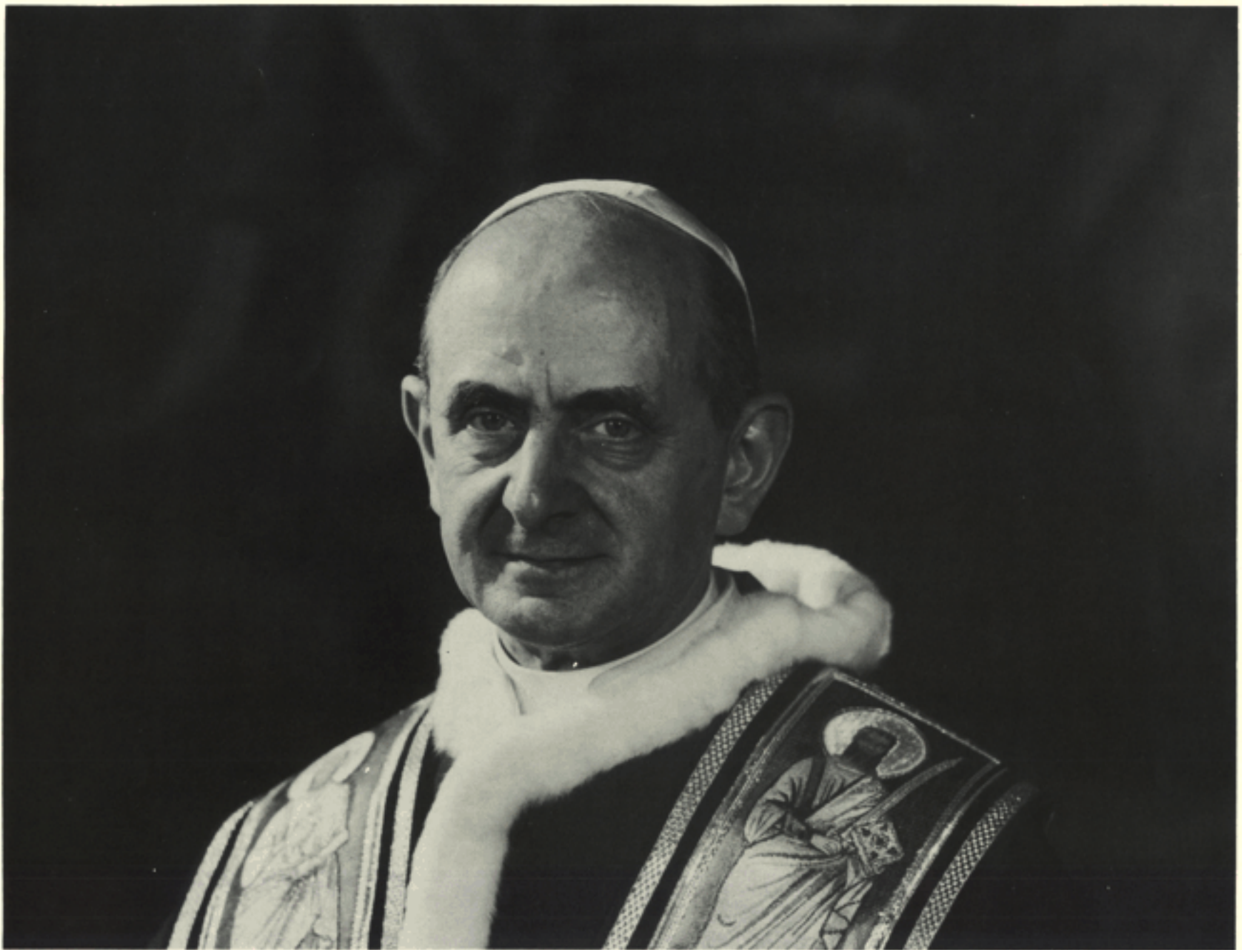
Pope Paul VI