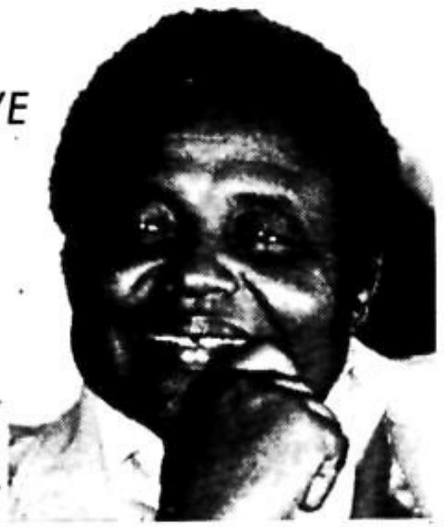
Joe Modise Commander of Umkhonto we Sizwe and member of the NEC of the ANC

politicise sections of the white conscripts and weaken the effective capacity of the SADF. The military strategy of the People's Army must aim to: