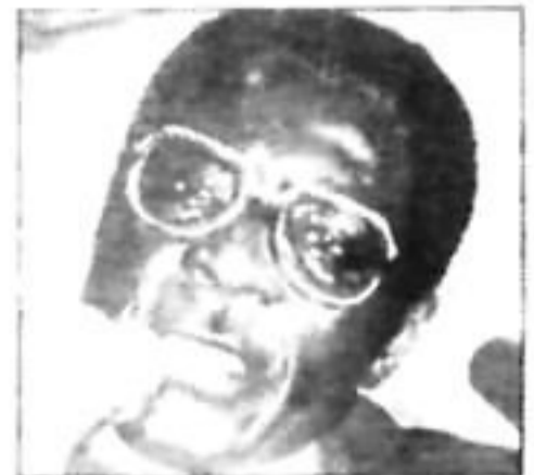
Prime Minister Mugabe welcomed the setting up of the Action for Resisting Invasion, Colonialism and Apartheid Fund, which aims to provide support for the liberation struggle in South Africa and Namibia and help the Front Line States resist Pretoria's aggression.

Robert Mugabe responded that it was the United States which was supporting reactionaries trying to overthrow the people's government in Nicaragua; it was the United States which had invaded Grenada; the United States was supporting and arming Unita bandits in Angola, and it was the United States which was protecting the racists in Pretoria from concerted international action to end apartheid and our oppression. It was not the Soviet Union or the socialist world doing these things, Prime Minister Mugabe added.