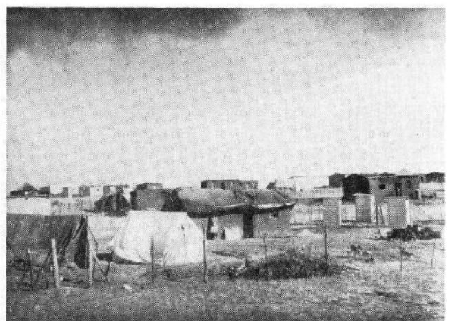
Kwavulamehlo – on the farm Compensation – new 'home' for people from "The SWAMP"