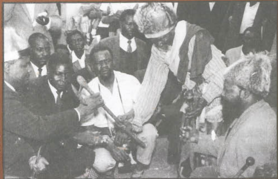
Left: Cde Joshua Nkomo being presented with a ceremonial axe by a veteran of the 1896/7 chimurenga at Salisbury airport on his return to Zimbabwe from abroad in 1962. Cde Robert Mugabe is on his left.