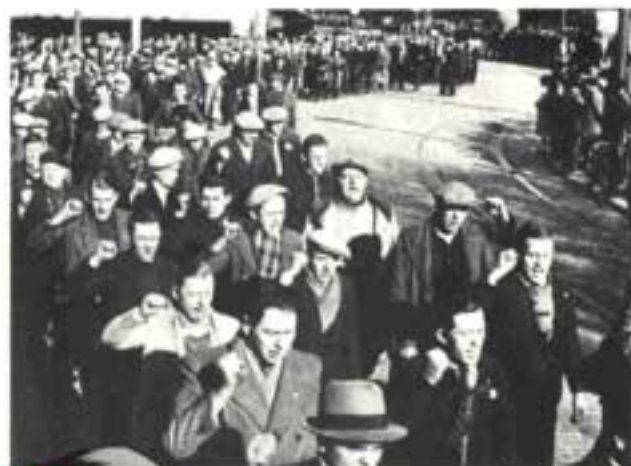
Volunteers arriving in Spain to fight with the International Brigades