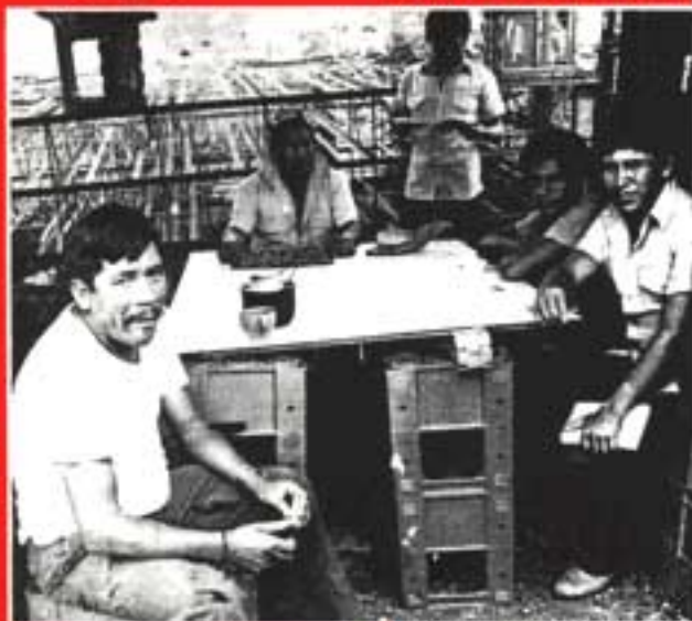
Guatemalan Coca-Cola workers on picket duty during their strike

BUILD SOLIDARITY THROUGH GIVING LIFE TO INTERNATIONAL TRADE UNIONS