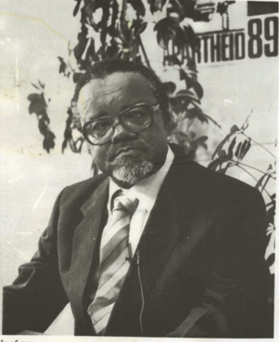
All proposals which do not accept the principle of one South Africa or those who seek a solution based on federal structures are sowing seeds of conflict...[(The) Alliance which was entered into by the ANC and the SACP is going to continue until apartheid, which is the source that seeks to destroy democracy in South Africa and spread its poisonous slime throughout the world is eliminated Govan Mbeki