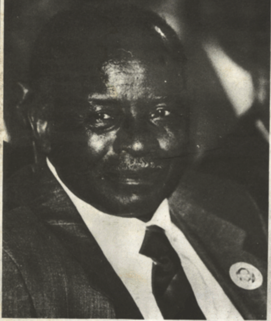
I don't regret staying all those years in prison. In fact I feel very proud of myself. I'm dedicated to the cause of my people. Raymond Mhlaba.