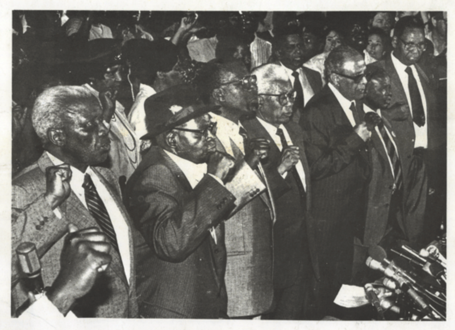
The formation of the ANC on January 8th, signified the birthday not only of the ANC but of the Nation. The ANC was the people's U nion of South Africa.