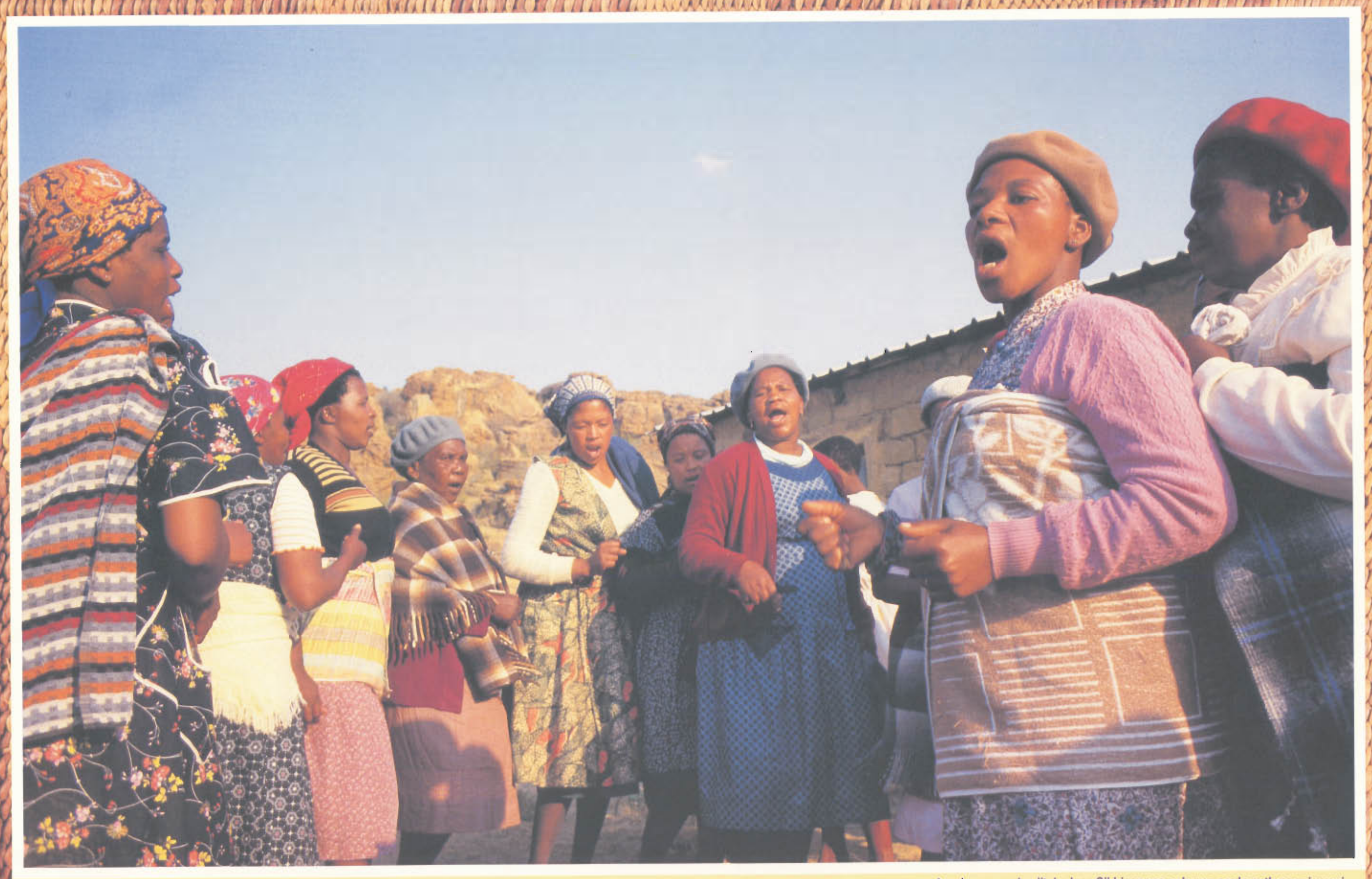
Maloko a mokgatlo o moswa wa Sikhisazana ba tšwa kopanong ba opela