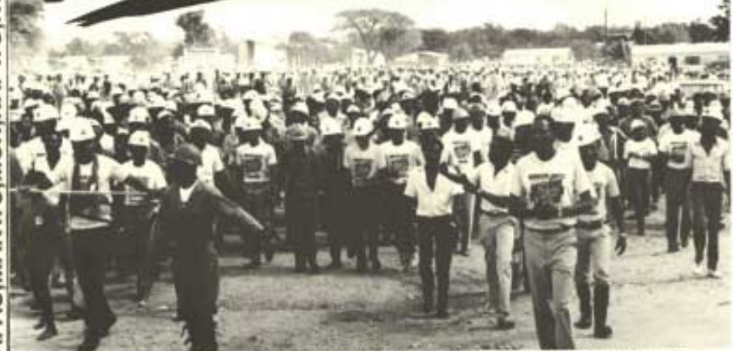
40 000 Workers voice demands at NUNW, MUN, NAFU May Day Rallies. 1987.