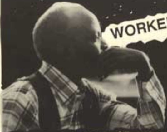
Workers meet to discuss and think.

WORKER CONTROL GROWS OUT OF MANY, MANY MEETINGS !!