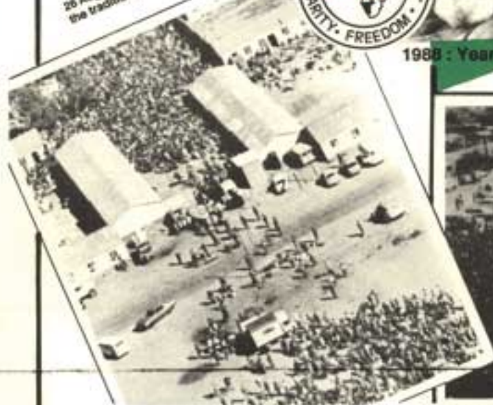
General Strike 1971/72.