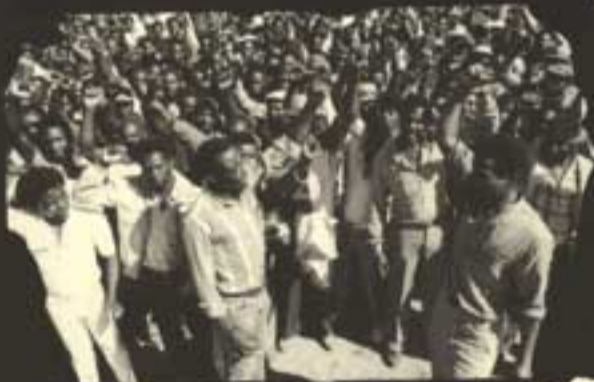
Workers meet to take Action !