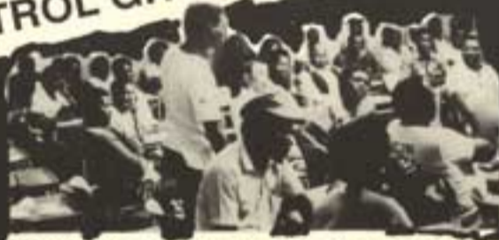
Werkers ontmoed om besluite te neem !