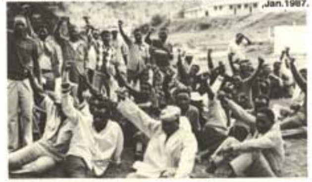
MUN defends dismissed workers | Otjihase Miners ready for action Jan. 1987.