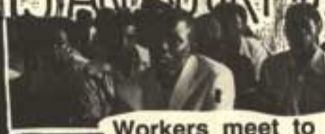
Workers meet to plan action !