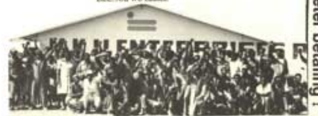
MANWU Workers on Strike ! MKU Okahandja 1987.