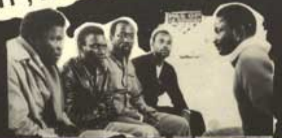
Workers meet to hear report-backs.