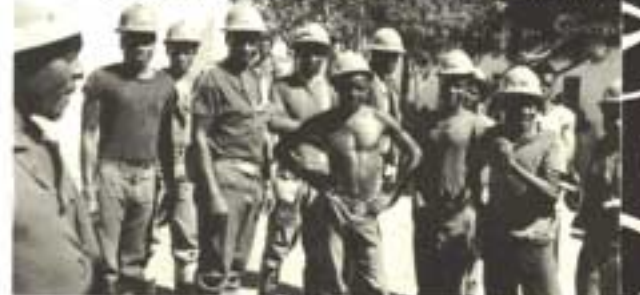
MUN Fights Retrenchment, Demands Pension and Workman's Compensation