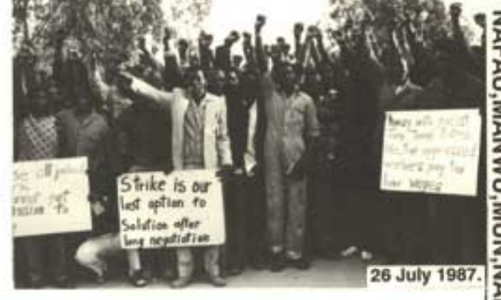
26 July 1987.