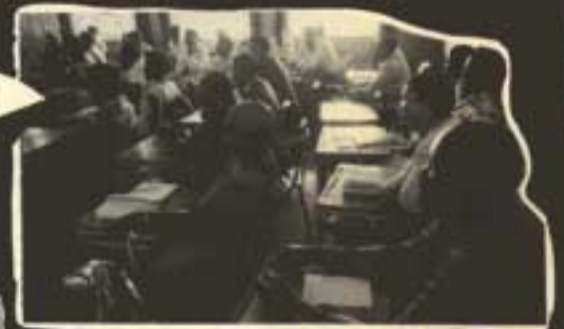
Workers meet to learn from each other.

NAMIBIAN WORKERS FOR FREEDOM, DEMOCRACY & SOCIALISM