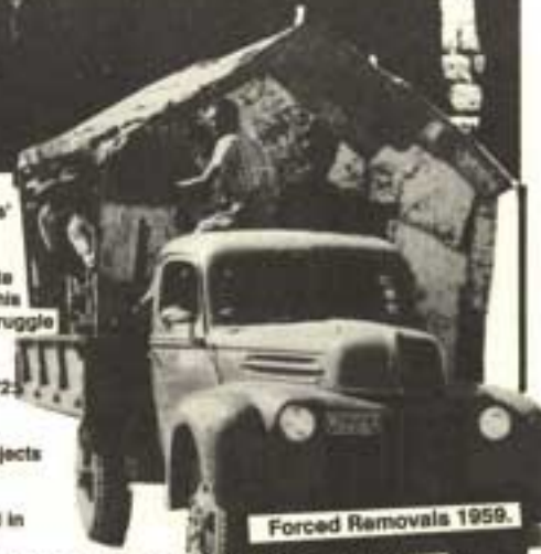
Forced Removals 1959.

1976: United Nations Institute for Namibia opened in Lusaka to provide education for a free Namibia.