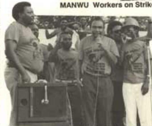
Workers of Southern Africa Unite! COSATU Guests at MUN 2nd National Congress, Tsumeb, January 1988.