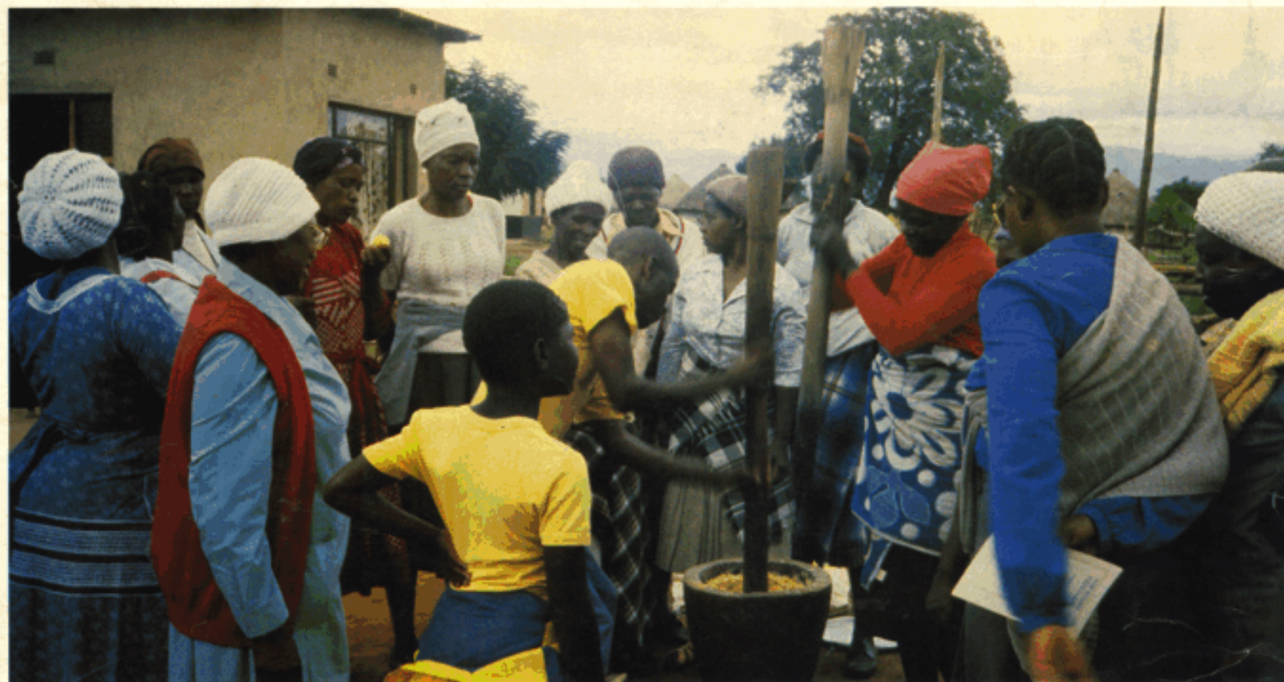
Stamping grain at the Zangoma nutrition workshop