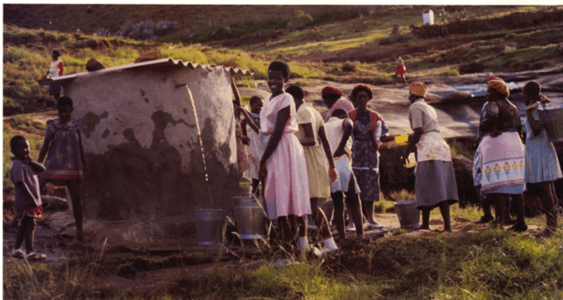
Collecting water at a protected spring in Sunduza