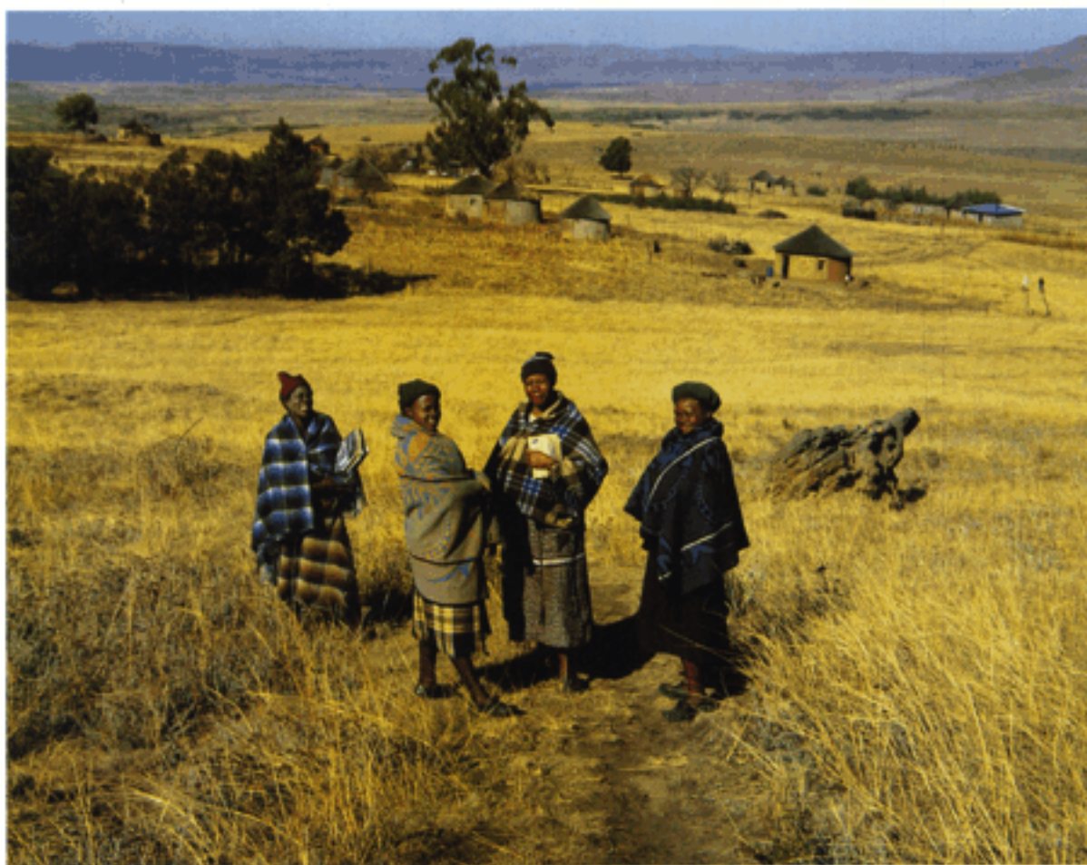
Women hold meetings and grind clay for mud stoves at Mehloloaneng