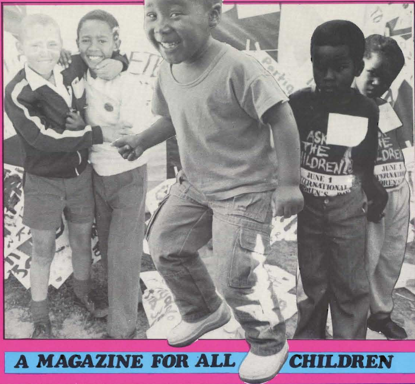
A MAGAZINE FOR ALL CHILDREN