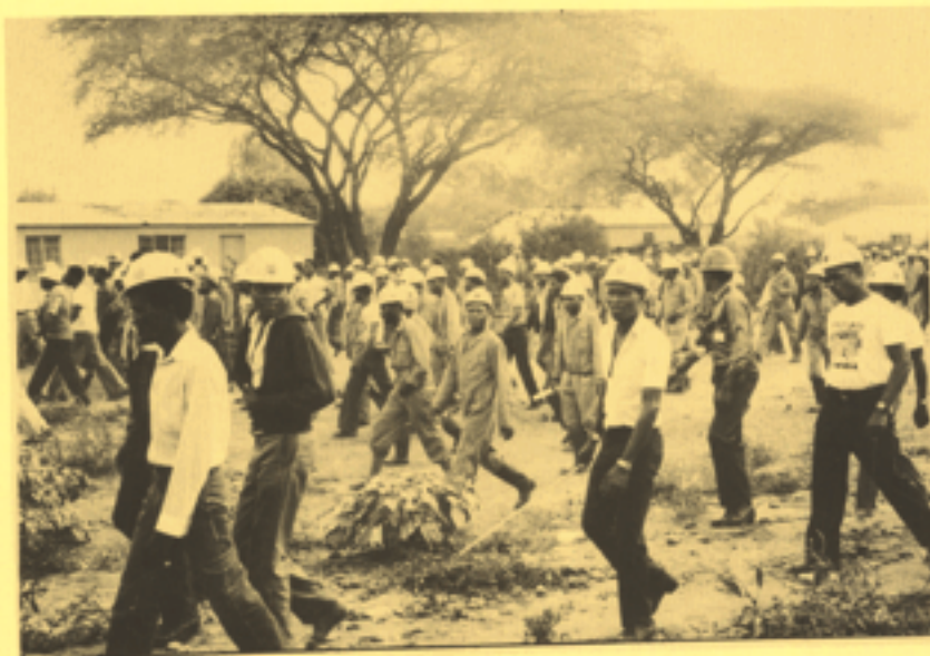
April 19: SWAPO is formed 19th April 1960.

'n Living Wage beteken dat geen werker sommer uit die werk gesit mag word nie en dit beteken beskerming teen gesondheidsgevale by die werk.