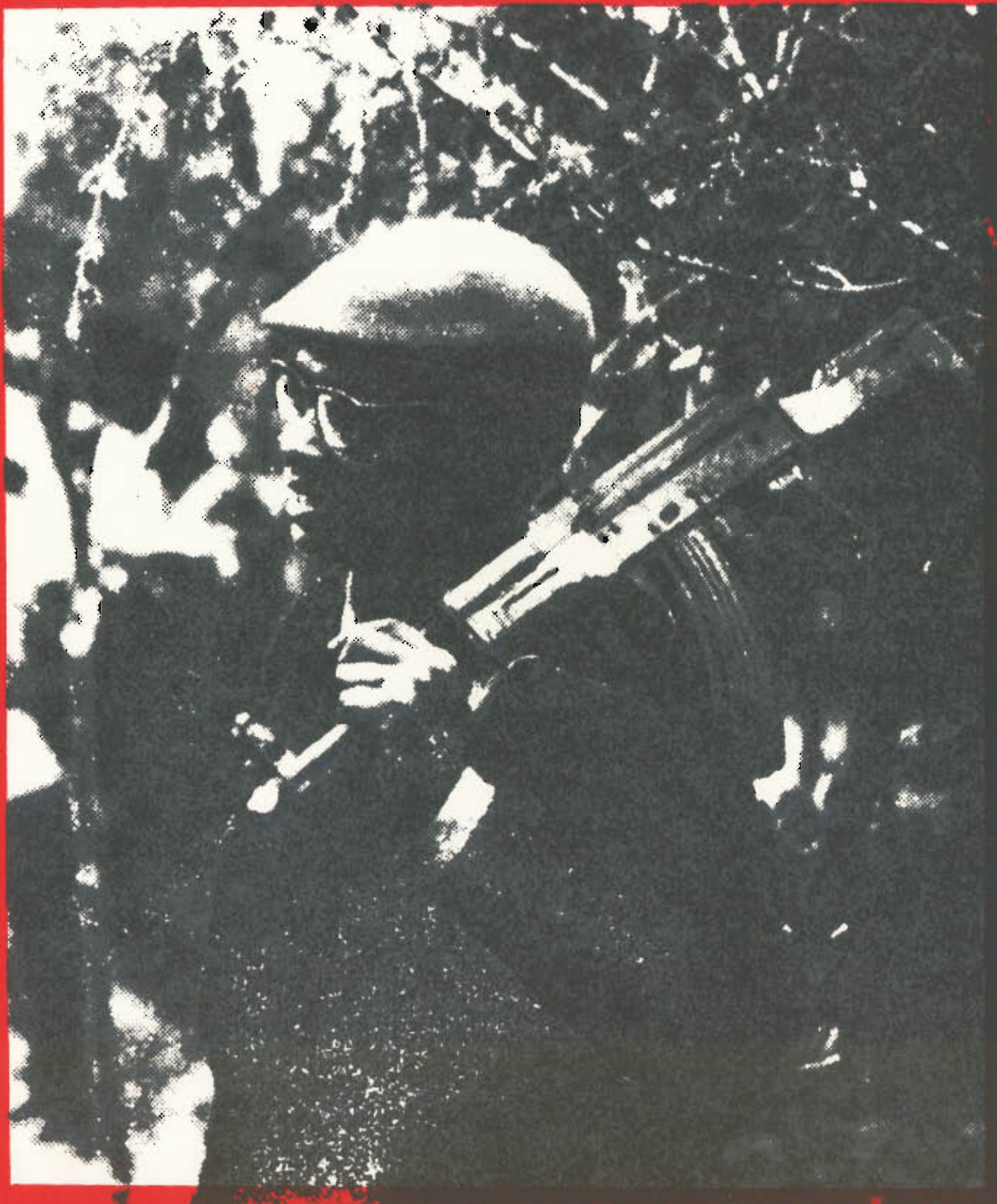
AGOSTINHO NETO 1922- 79