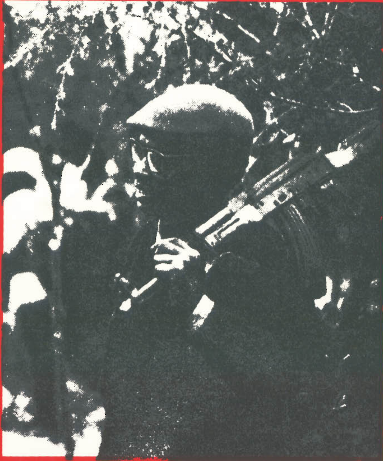
AGOSTINHO NETO 1922- 79