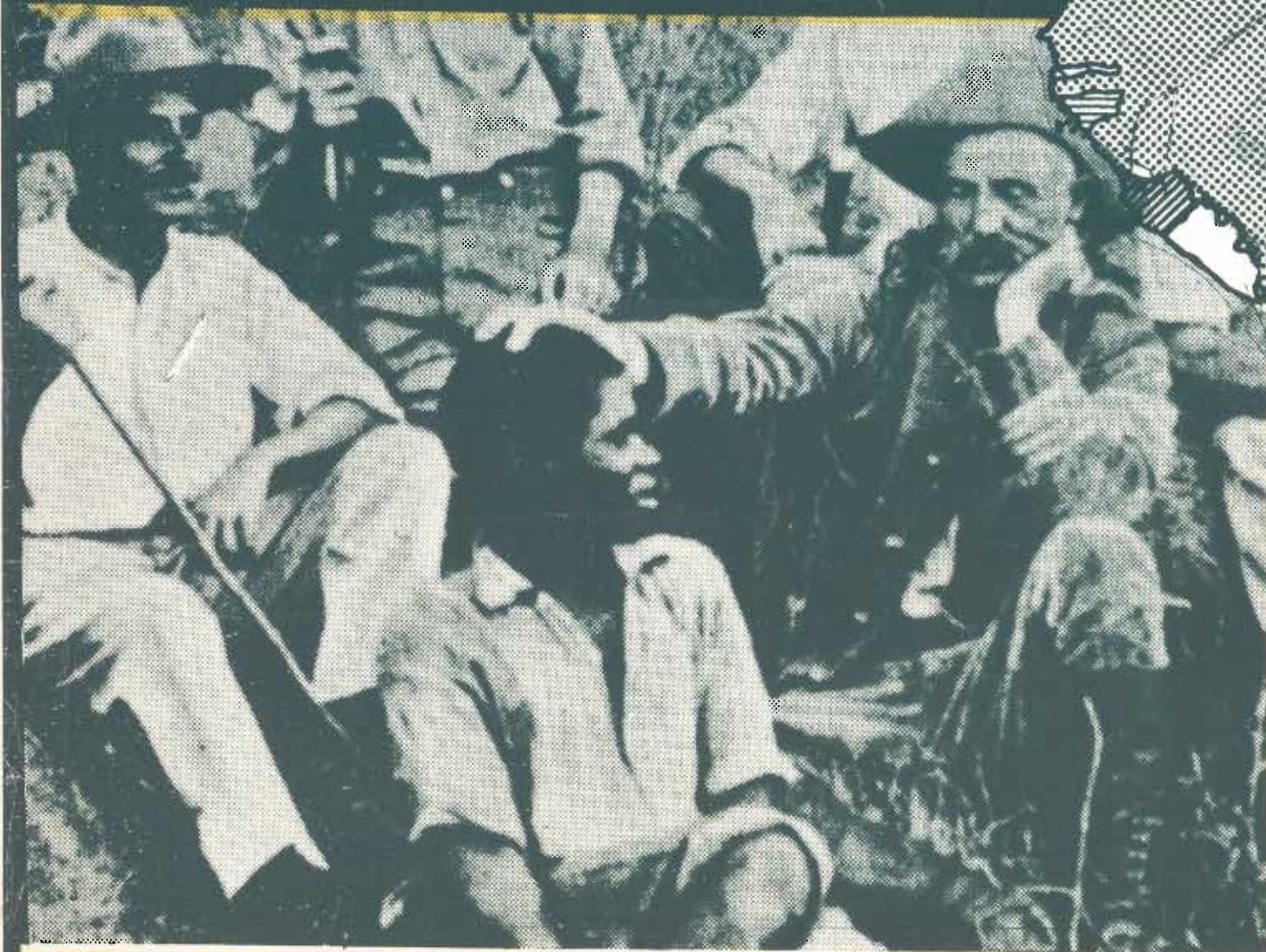
Settler Occupation of Zimbabwe