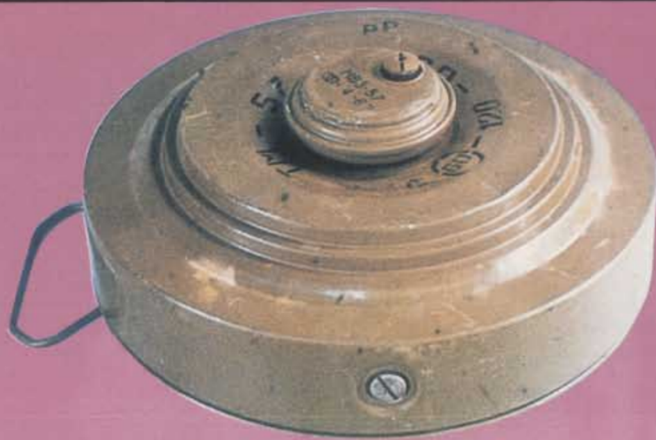
*TM 57 (Russian - Bulgarian)