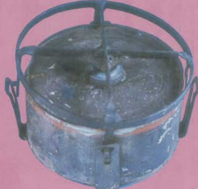
BRIT MK5 (British - Indian)