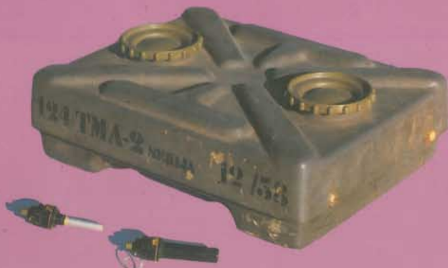
TMA 2 (Yugoslavian)