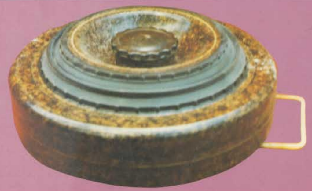
*PT-Mi-Ba III (Czechoslovakian)

These anti tank mines (sometimes referred to as anti vehicle mines) represent a random selection of the most common mines that have been found in Southern Africa. Those mines marked * have been found inside RSA, the others were found in both the Rhodesian (Zimbabwe) and S.W.A. (Namibia) conflict and could appear in the future. These mines are included to assist untrained personnel to identify it as a mine should they be encountered. Anti tank mines are buried below ground level usually on gravel roads and are detonated by the vehicle wheels passing directly over them. (These mines are not necessarily supplied by the country of manufacture.)