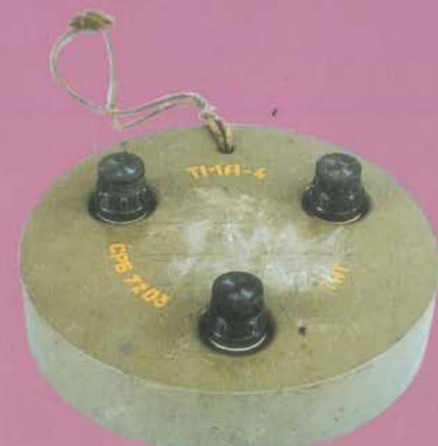
TMA 4 (Yugoslavian)