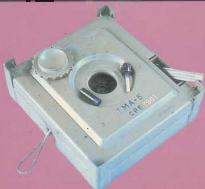
TMA 5 (Yugoslavian)