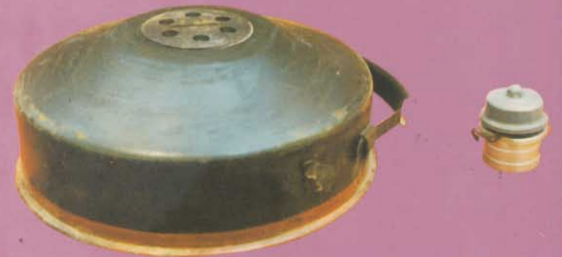
BRIT MK7 (British)