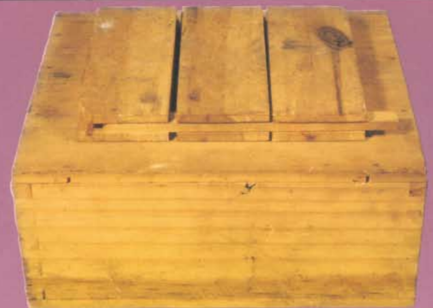
TM D-B (Russian - Chinese)