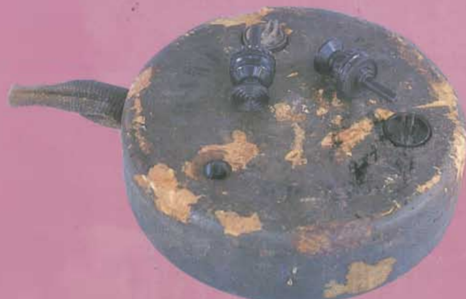
TMA 3 (Yugoslavian)