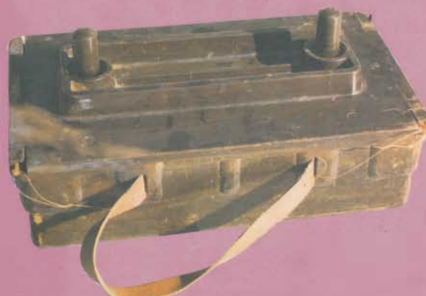
PT-Mi-Ba II (Czechoslovakian)