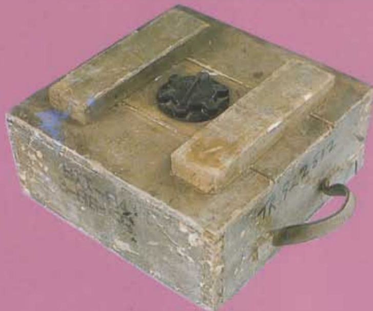
TM D-44 (Cuban)