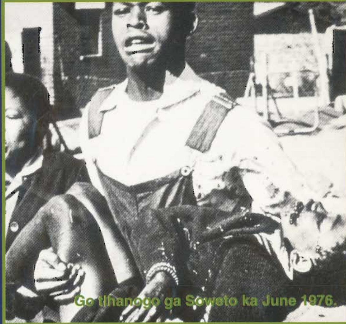
Go tharogo ga Soweto ka June 1976.