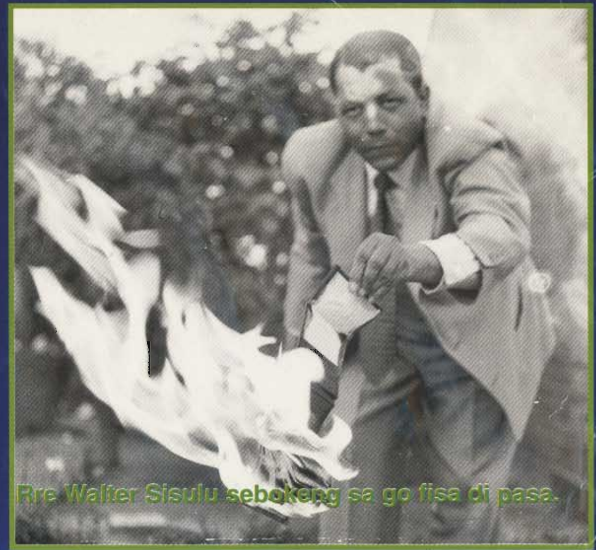
Rre Walter Sisulu seboteng sa go fisa di pasa.