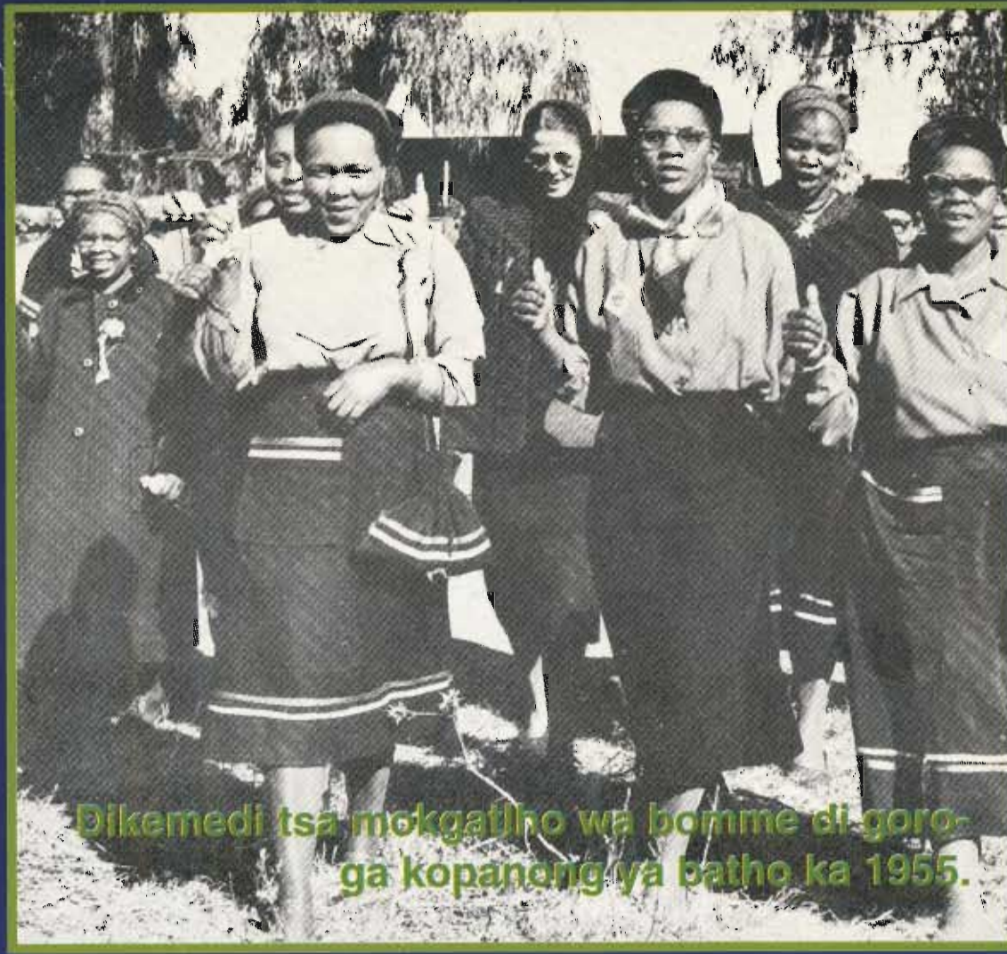
Dikemedi tsa mokgatlo wa bomme si-goro-ga kopaneng ya batho ka 1955.