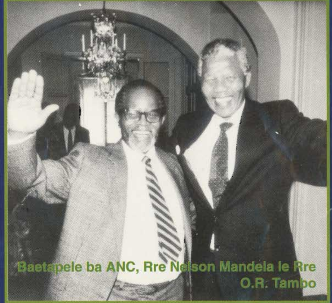
Baetsapele ba ANC, Rre Nelson Mandela le Rre O.R. Tambo