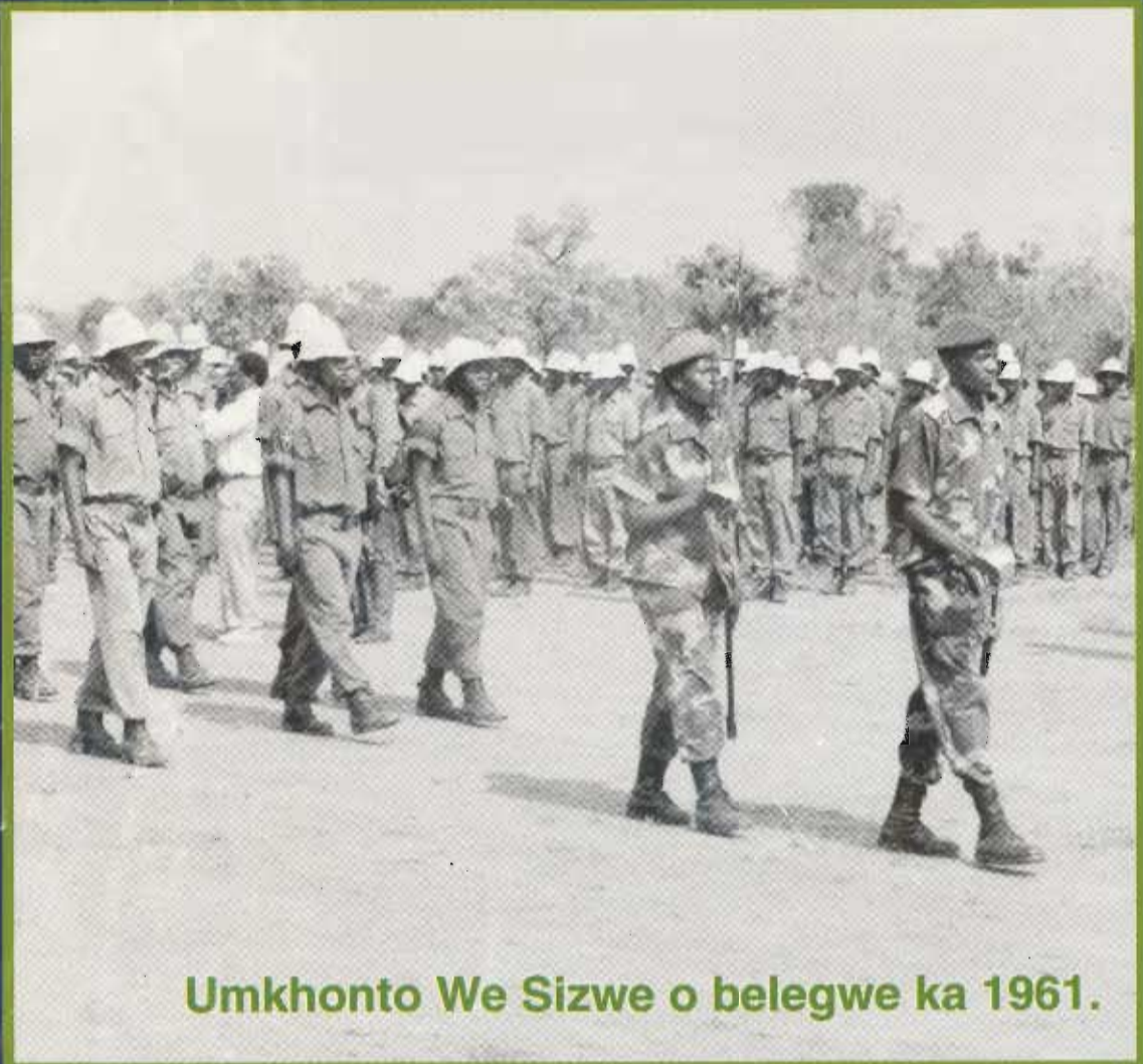
Umkhonto We Sizwe o belegwe ka 1961.