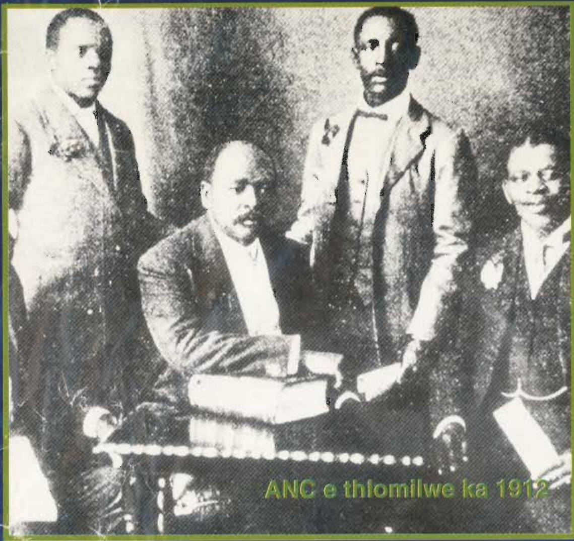
ANC e thlomilwe ka 1912