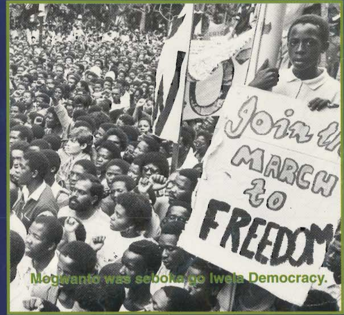
Megwanto was seboka go lwela Democracy.