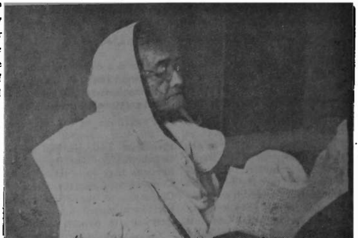
Mrs. KASTURBA GANDHI

But there is one memory that to me is most precious and poignant, which I record as my personal tribute to her, and which serves not only to confirm but complete and crown all the beautiful and lofty virtues that have made her an ideal comrade and helpmate to her husband. On her arrival in England in the early days of the war, one felt that Mrs. Gandhi was like a bird with eager outstretched wings longing to annihilate the time and distance that lay before her and her far-off India, and impatient of the brief and necessary interruption in her homeward flight. The woman's heart within her was full of yearning for the accustomed sounds and scenes of her own land and the mother's heart within her full of passionate hunger for the beloved faces of her children... And yet when her husband, soon after felt the call, strong and