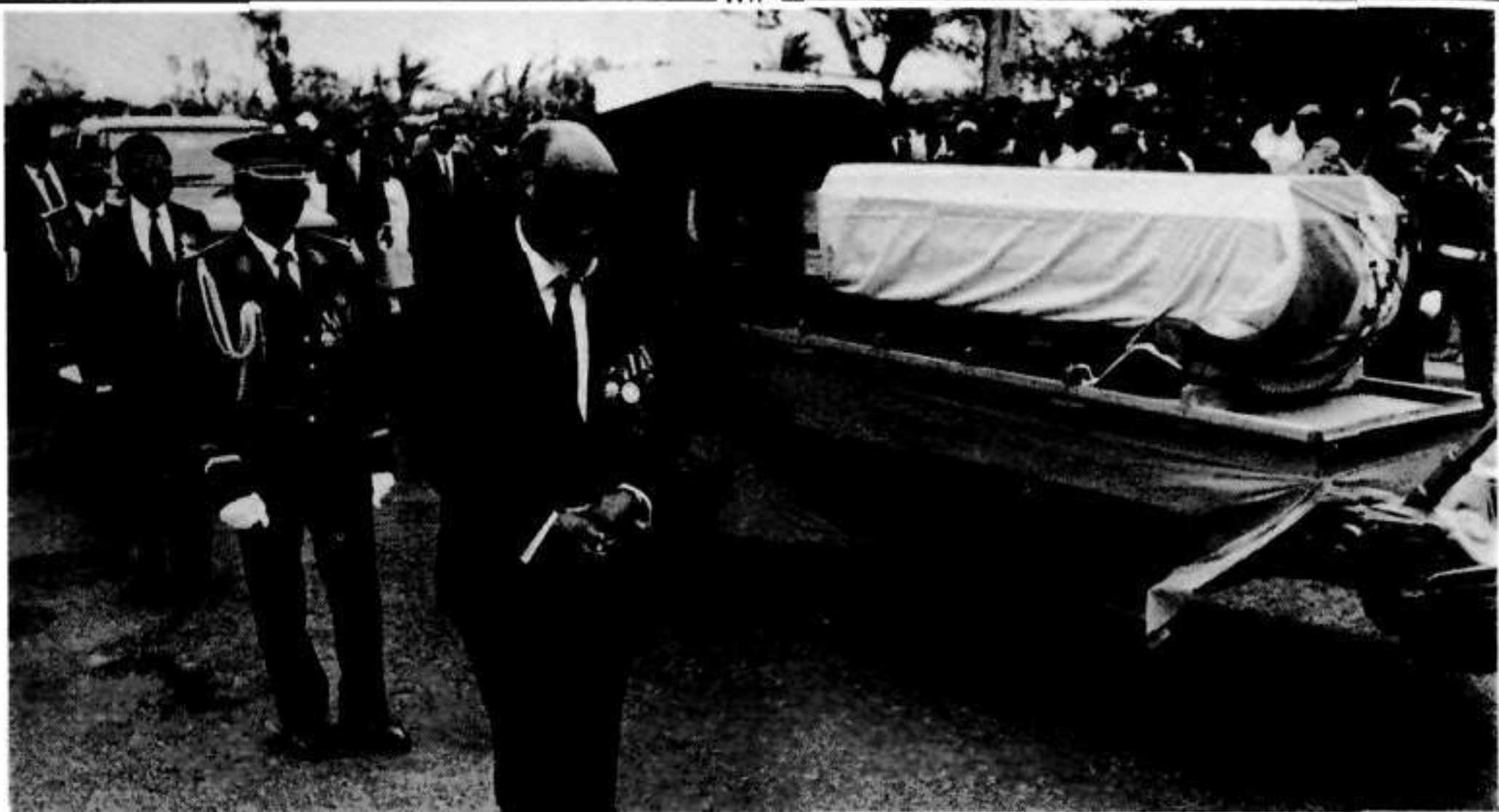
Maputo, 28 October: FRELIMO's Marcelino dos Santos leads the funeral procession

SABC News Commentary strongly attacked both Mozambique and Angola.