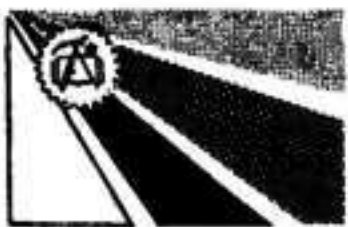
'MINIMALISTS' AND 'MAXIMALISTS'

And the fact that information on plans for stepped-up military pressure around the capital was apparently leaked to the Mozambicans also points to possible divisions within the regime.