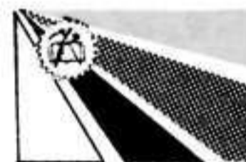
THE LESOTHO MODEL

believe overthrow of the FRELIMO government is essential if any of the major objectives of Pretoria's current regional strategy are to succeed. They would probably also argue that it would enable them to reduce their existing, increasingly costly, commitment to the MNR and re-deploy scarce resources on the domestic front.