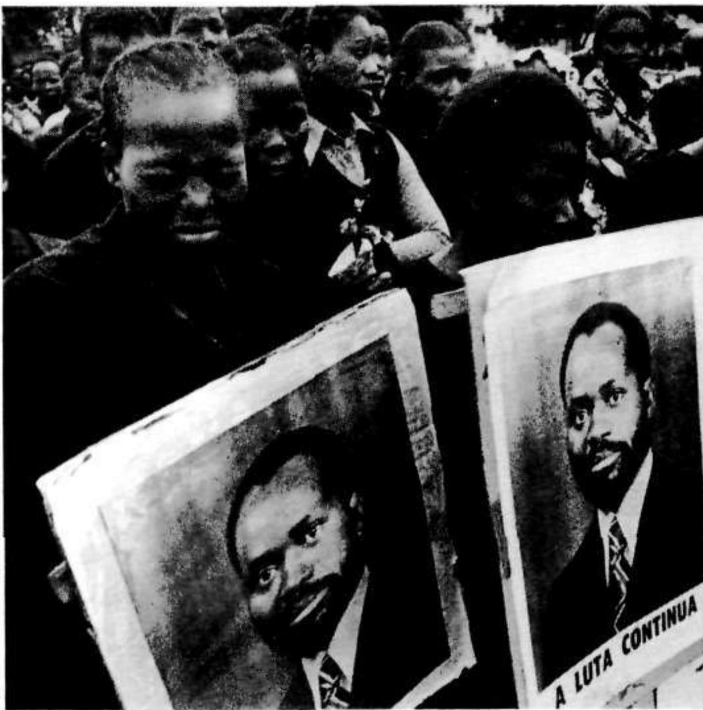
Mozambicans mourn a popular president

Instead it applied economic and other pressures, pushing an already acute internal situation to the point of collapse. The result was that the new government was not seen as, and indeed was not, a mere puppet of Pretoria. Pretoria was not obliged immediately to