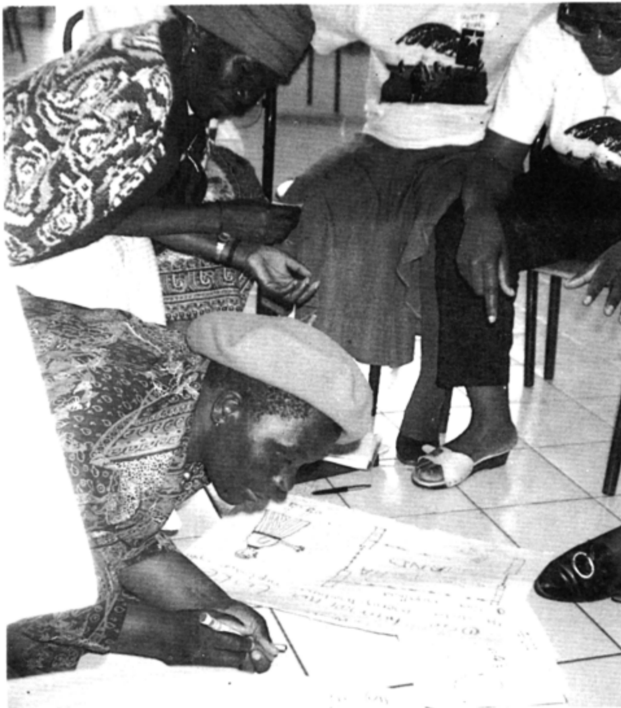
Women come up with their demands at the Transvaal CLC.

TRAC • 4th floor, Khotso House • 62 Marshall Street • Johannesburg PO Box 62535 • Marshalltown 2107 • Tel. (011) 833-1063 • Fax: (011) 834-8385