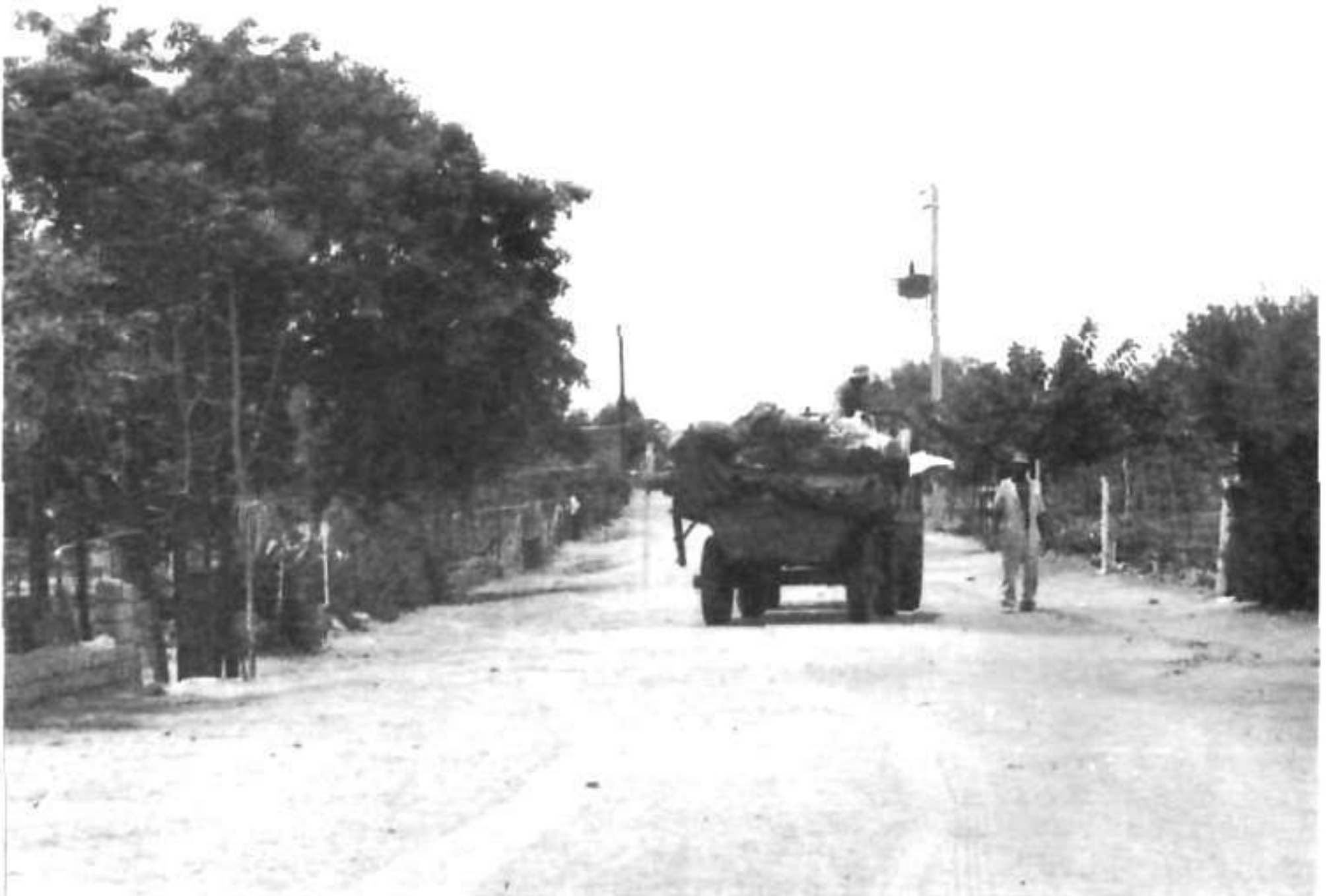
Refuse removal in Hartebeesfontein -- one of the services being by the Hartebeesfontein Civic negotiated with the TPA.

The community raised questions about who decides on the projects and the budget for the township. The HCA argued that projects should be the outcome of community needs and not what the authorities feel or think are community needs.