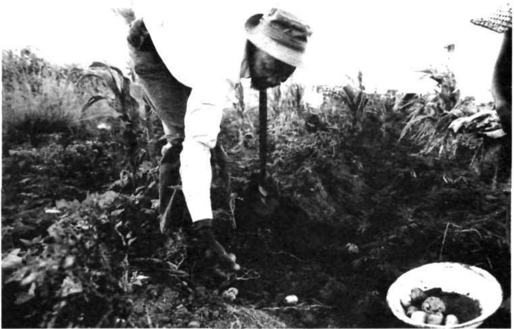
Digging potatoes in Daggakraal.