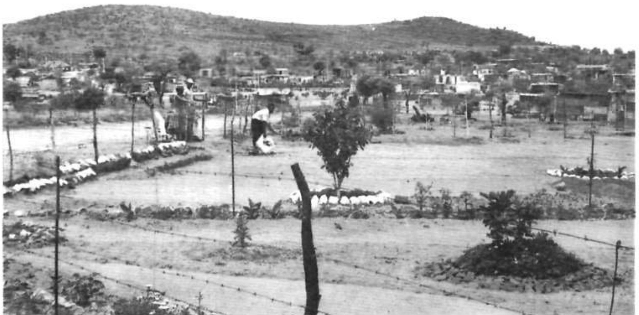
A yard in Hartebeesfontein, against the backdrop of the dry Western Transvaal hills.

Once bitten twice shy, the community ceased to take rumour for granted and refused to take the potential humiliation lying down. They invited TRAC to intervene. The brief was to challenge incorporation and not to reclaim their land. The people are happy to pay an annual levy of R1,00 as opposed to R40,00 charged by the previous landlords. Moreover, there was ample fuel wood and they have relative security of tenure on the plots they occupy.