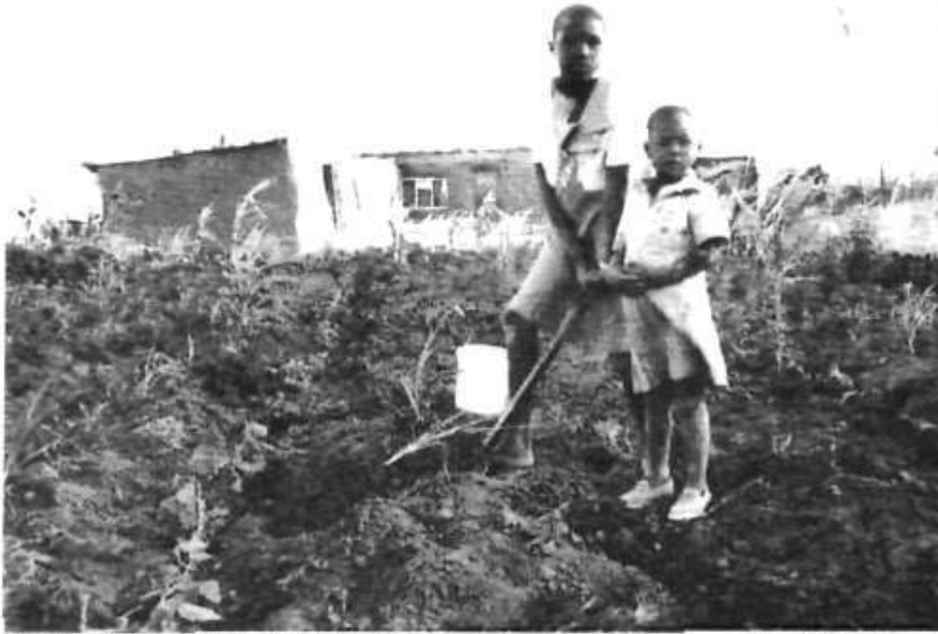
Children in their garden in Daggakraal, June 1985

come of the local government negotiation forum. Decisions cannot be finalised regarding the demarcation of boundaries, the structure of local government in the democratic South Africa and the powers of each tier of government.