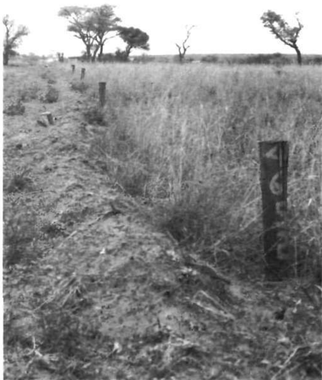
Pegging sites for land allocation, Hartebeesfontein.

"We are the residents of Hartebeesfontein, we are the people directly affected by the decisions you are