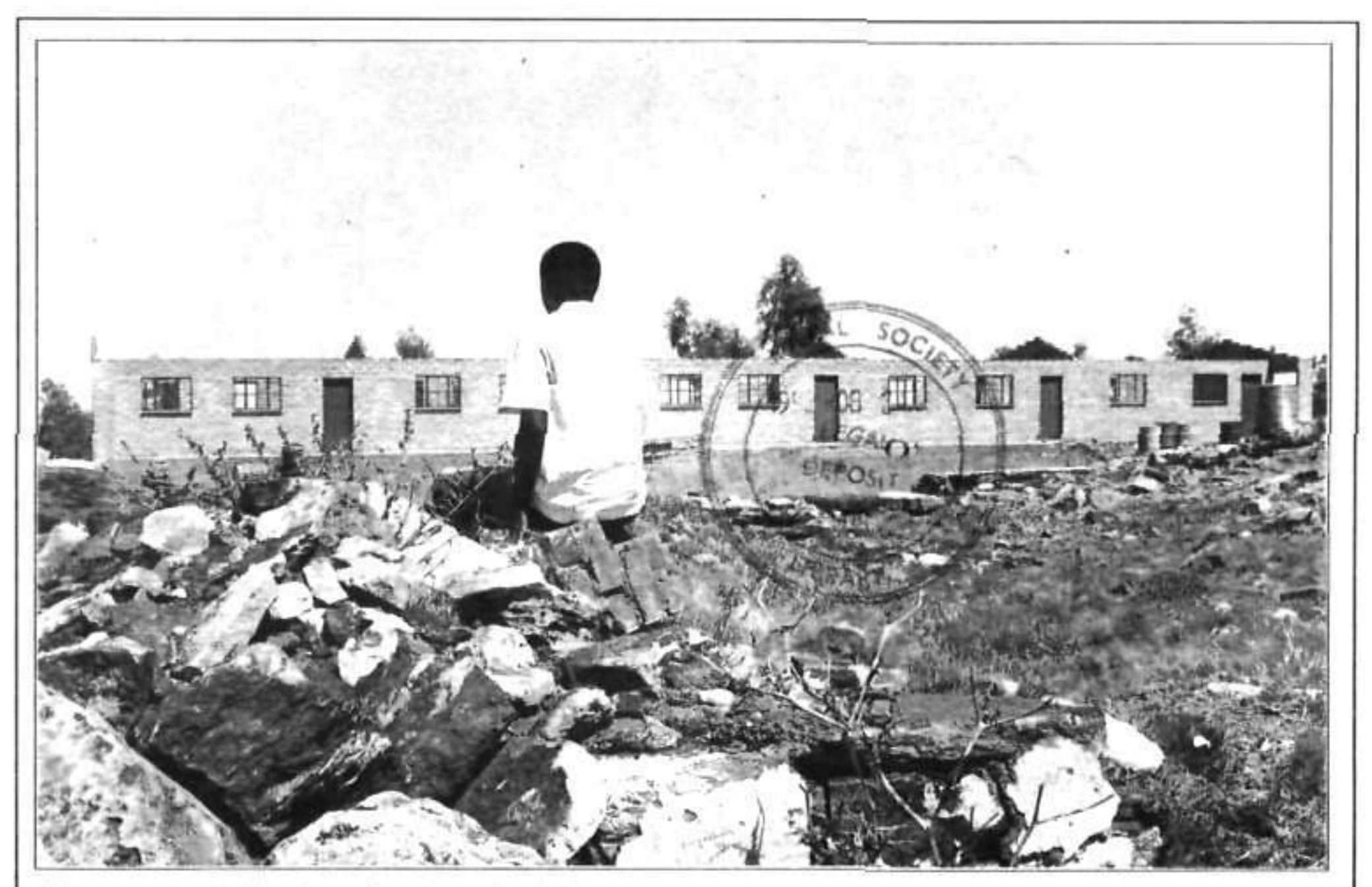
Mogopa school rising from the ruins after their return