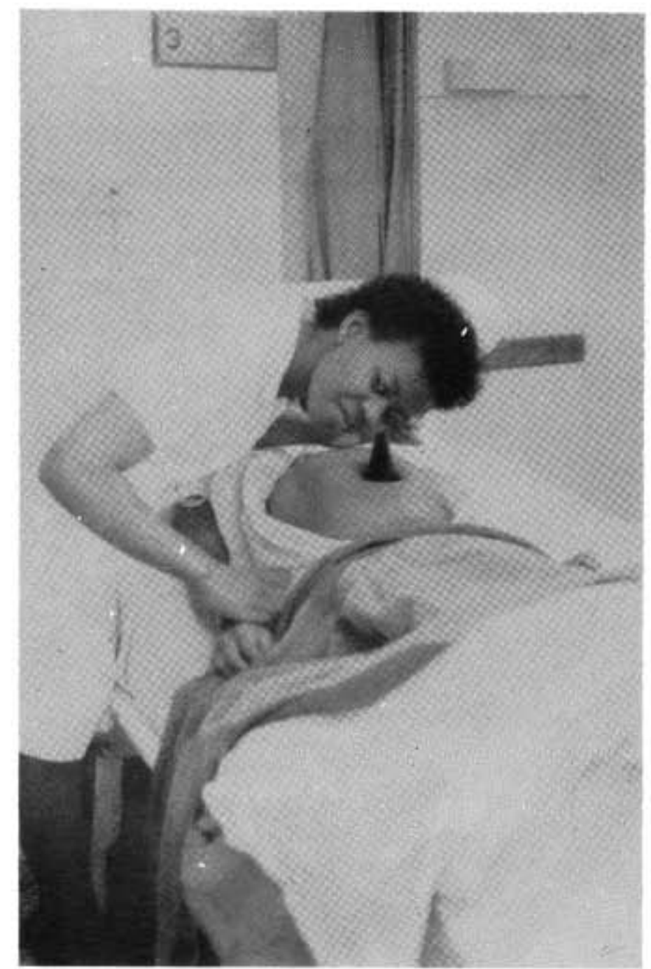
The nurse listens to the baby's heart beat

can give you and your baby a bad infection. So if water starts to come from your vagina, in a rush, or slowly, and you are not in the clinic or hospital, don't wait. Go straight to the clinic or doctor for a check up.