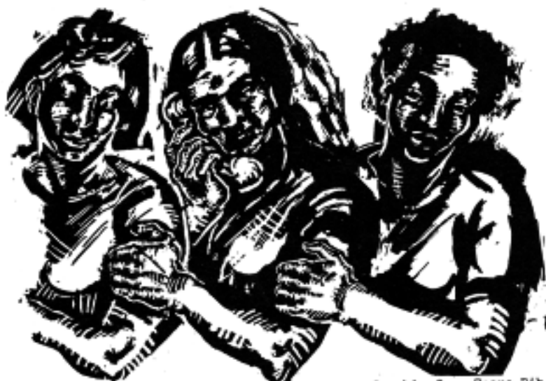
Graphic from Spare Rib