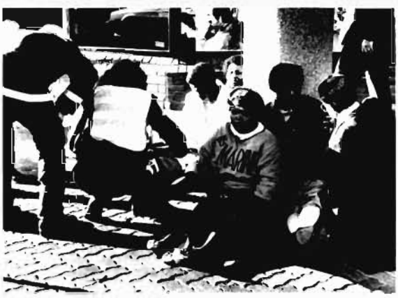
Victims of the Johannesburg taxi rank blast in July.

Courage and decisive leadership of a special kind is needed. The appeal must go out to these two leaders to act firmly, innovatively, publicly and urgently so that a halt is brought to the killing and