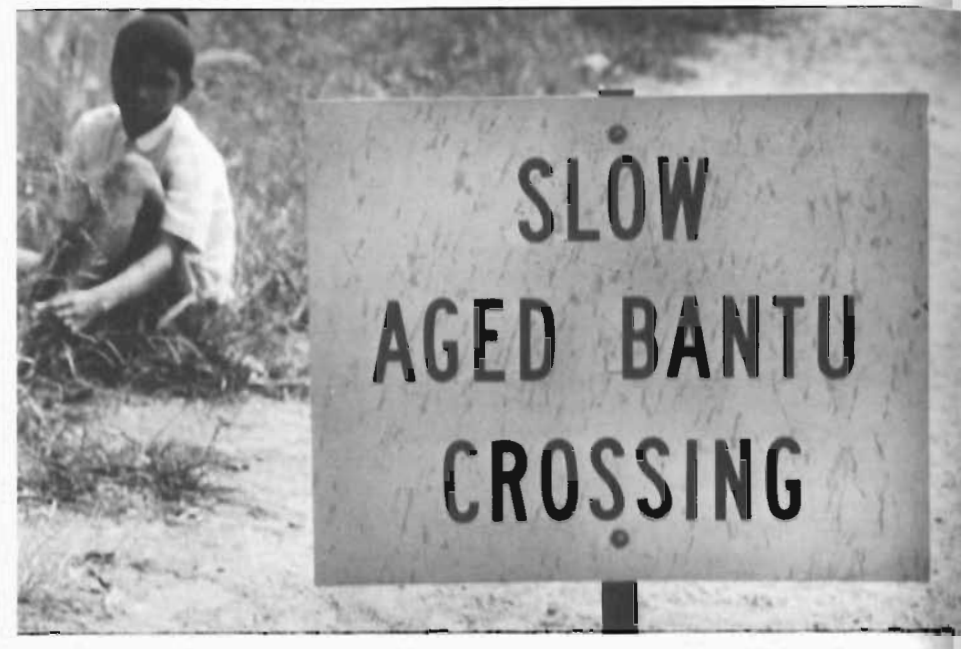
A signpost that appears outside a trading store near Port Alfred whenever pensions are paid out.

You might be there at the wrong time. As Brown writes: "Some advice offices report delays due to applicants having gone to central offices to apply, only to be told to come back in one or two months' time, as that is