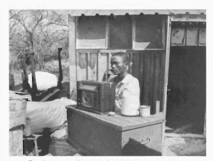
Radio . . . easily portable into remote areas.

Rhodes University academic and journalist Don Pinnock suggested in a recent article that if popular organisations were at all interested in a piece of the future, they should consider various courses of action to gain access to the airwaves.