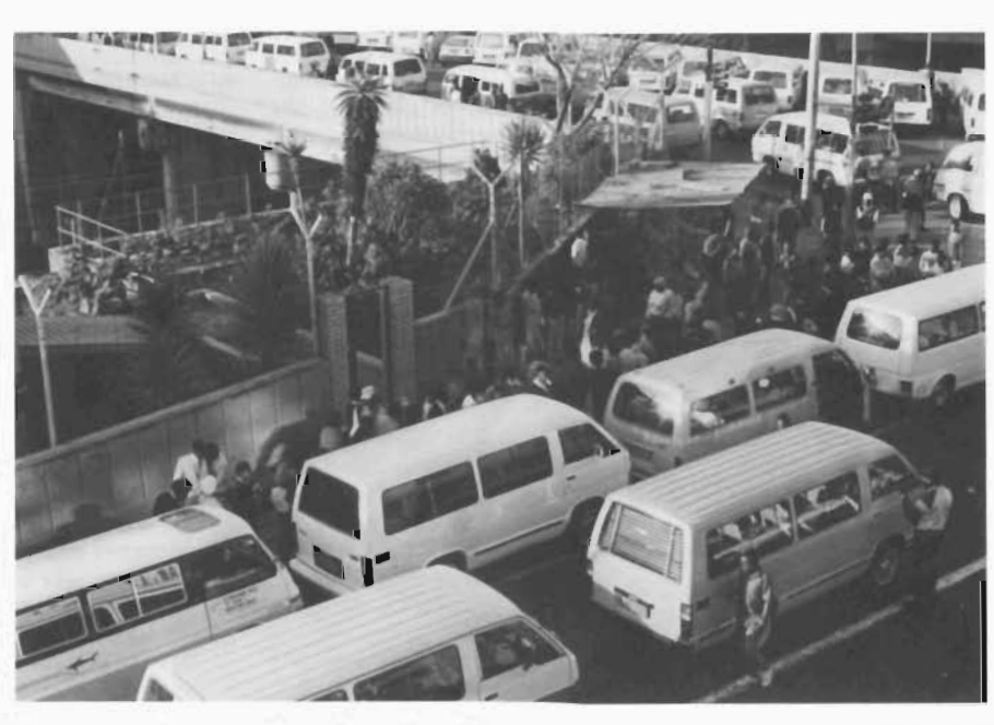
Concerns about the free flow of traffic often outstrip all other urban management considerations.

cost and massively aggravate the major developmental issues of poverty, unemployment and inequality.