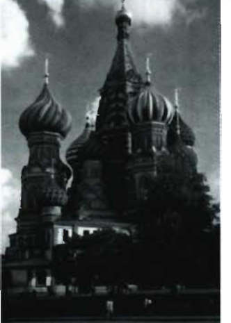
Red Square in Moscow