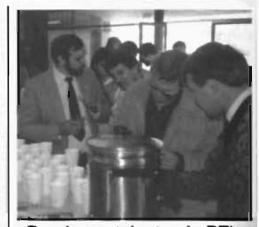
Dominees take tea in PE's townships.

Among the aims of social history tours of the townships is to