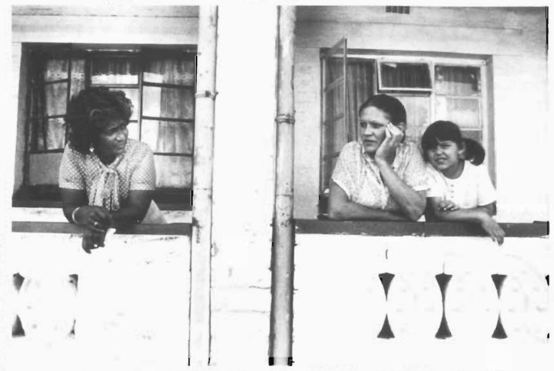
Neighbours in Mayfair, where Group Areas battles have raged for decades.

Those involved include the Action Committee against Evictions (Actstop), the South