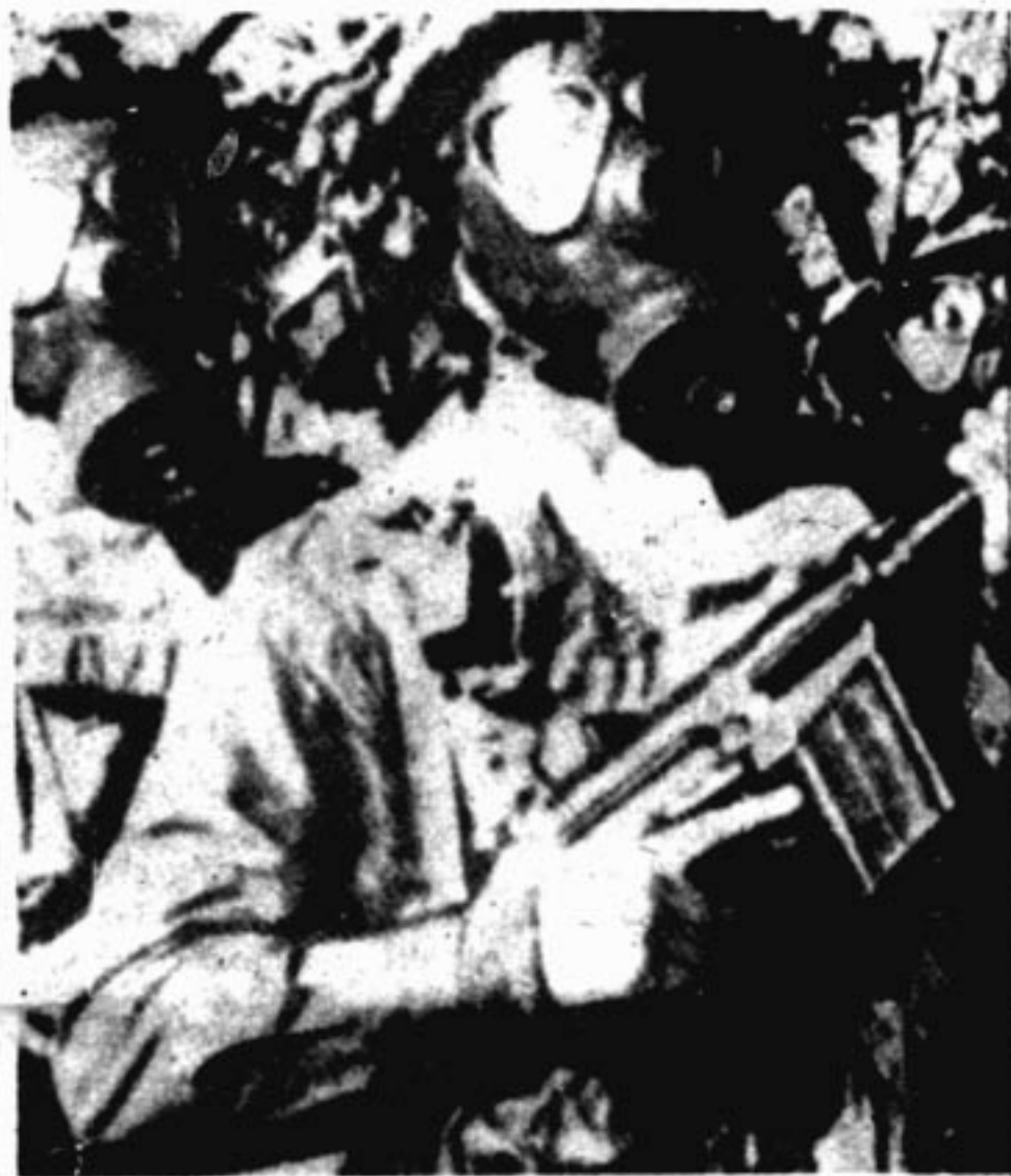
A unit of the South African Cape Corps, deployed in Namibia.

These brainwashing attempts have to be exposed and defeated at all levels. Our schools have to be organised and united around the common rejection of these evil intentions of the SADF. We have to refuse to accept the material given out by the SADF and refuse to attend the meetings organised by the collaborating principals for the SADF to spread its lies. Denied opportunities as we are, we