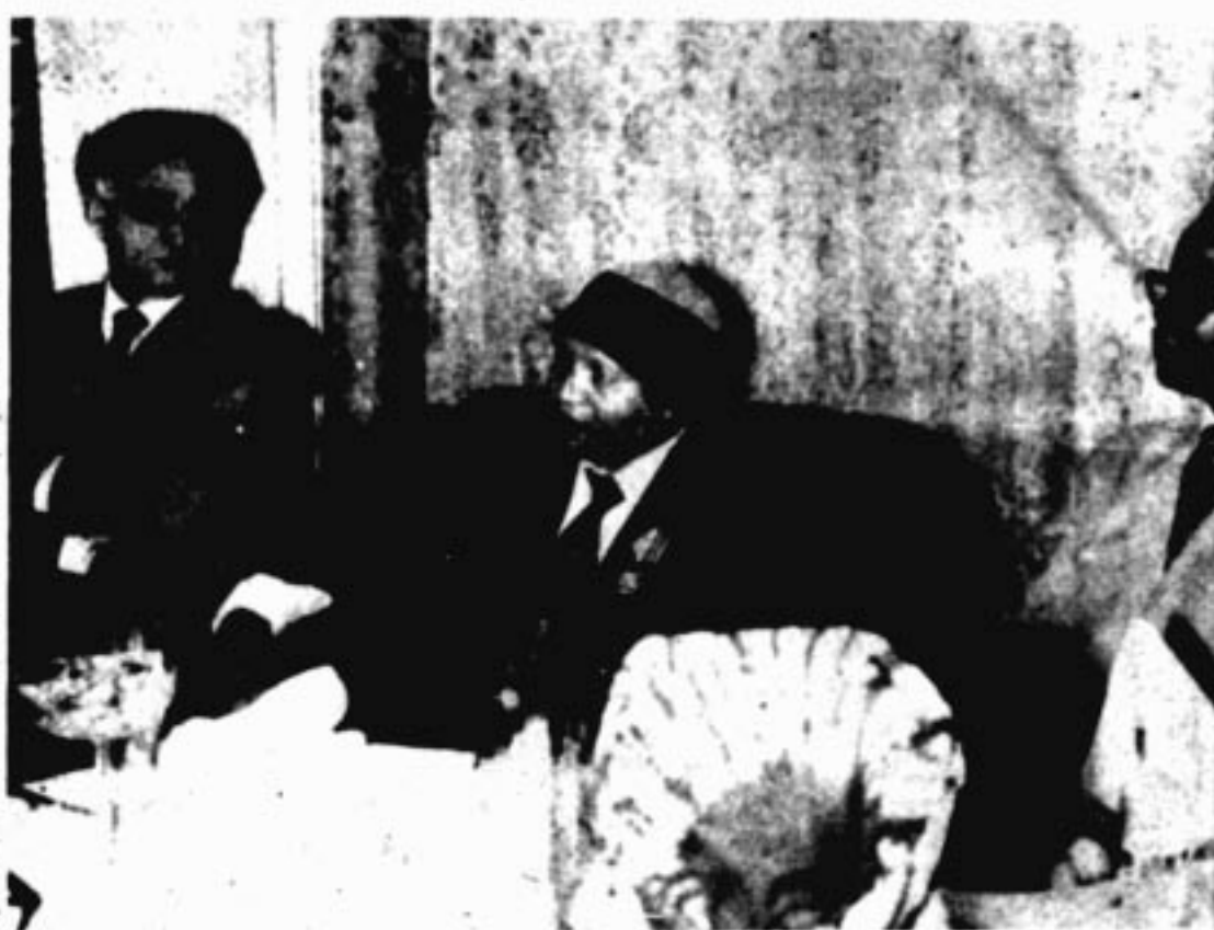
STALWARTS OF THE LIBERATION MOVEMENT: Dr Yusuf Dadoo, the man of the SACP (left) and ANC President, Comrade O R Tambo at the day celebration of the late General-Secretary of the SACP, Comrade Mose