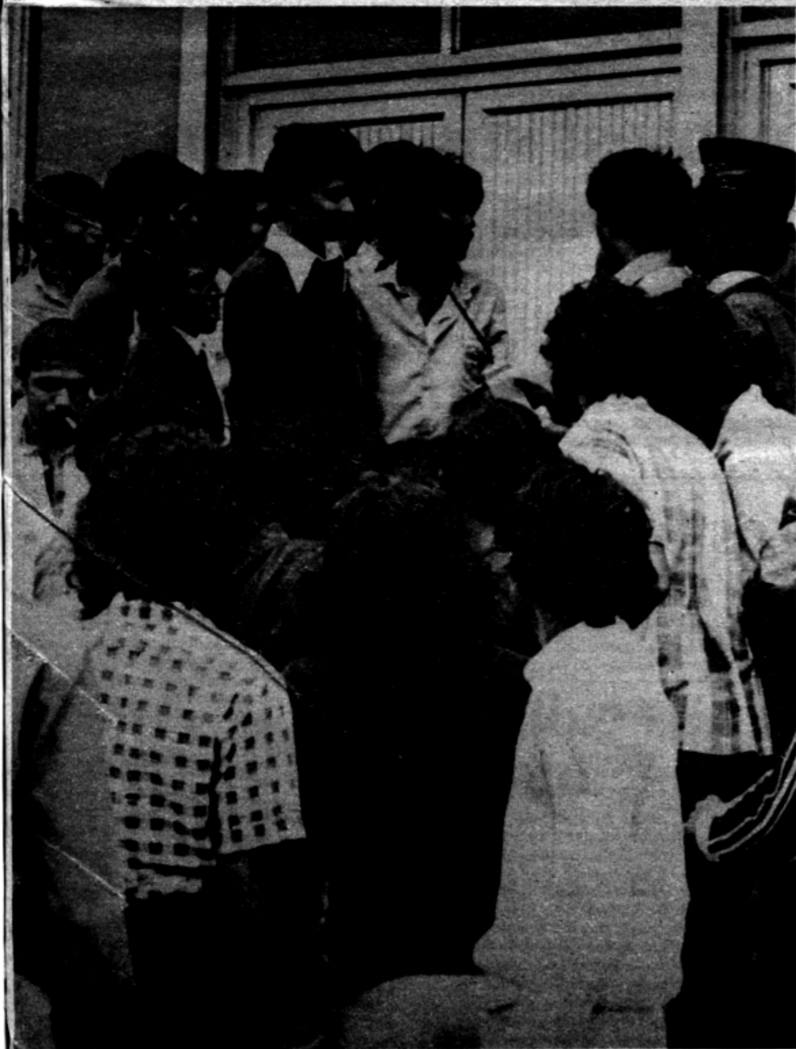
Students were locked out of the cafe and library and ordered off campus

THE STUDENT boycott at the University of Durban Westville is now into its sixth week with students working hard to enlist community support for their stand.