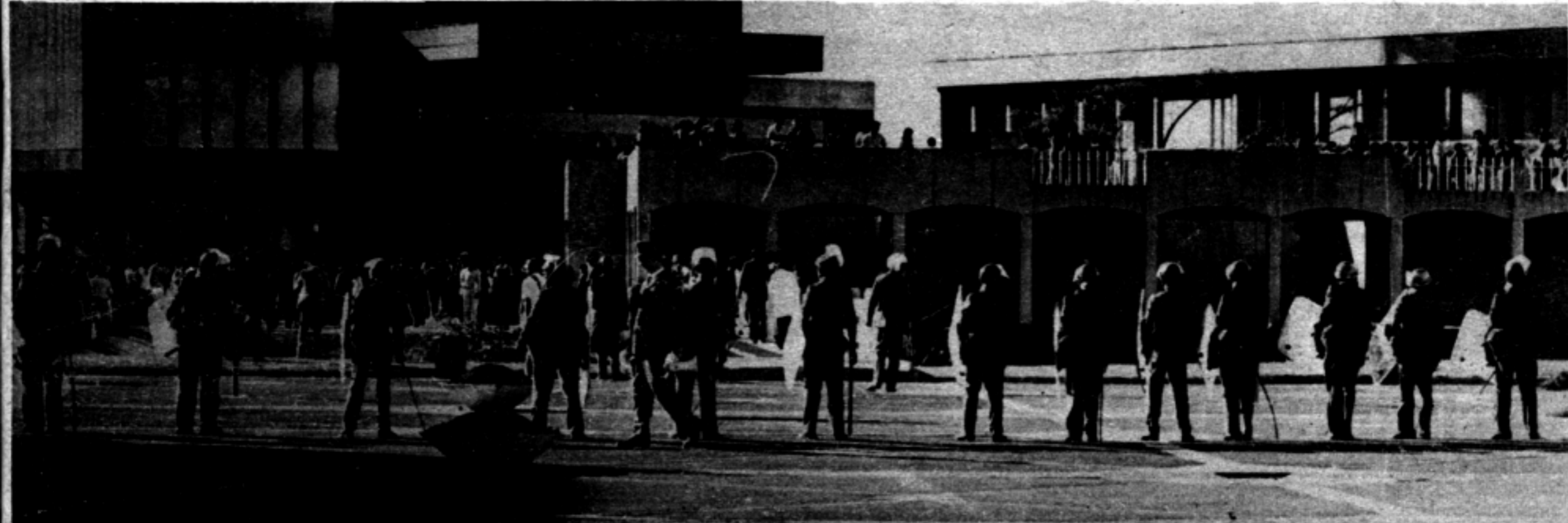
Approximately 250 armed policemen invaded the campus daily.