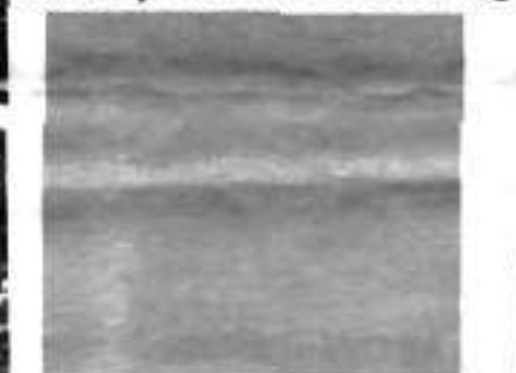
LEFT: NELSON MANDELA was admitted to hospital with TB RIGHT: A striking hotel worker was shot outside a protest BELOW: Workers stayed at home on June 6, 7 and 8