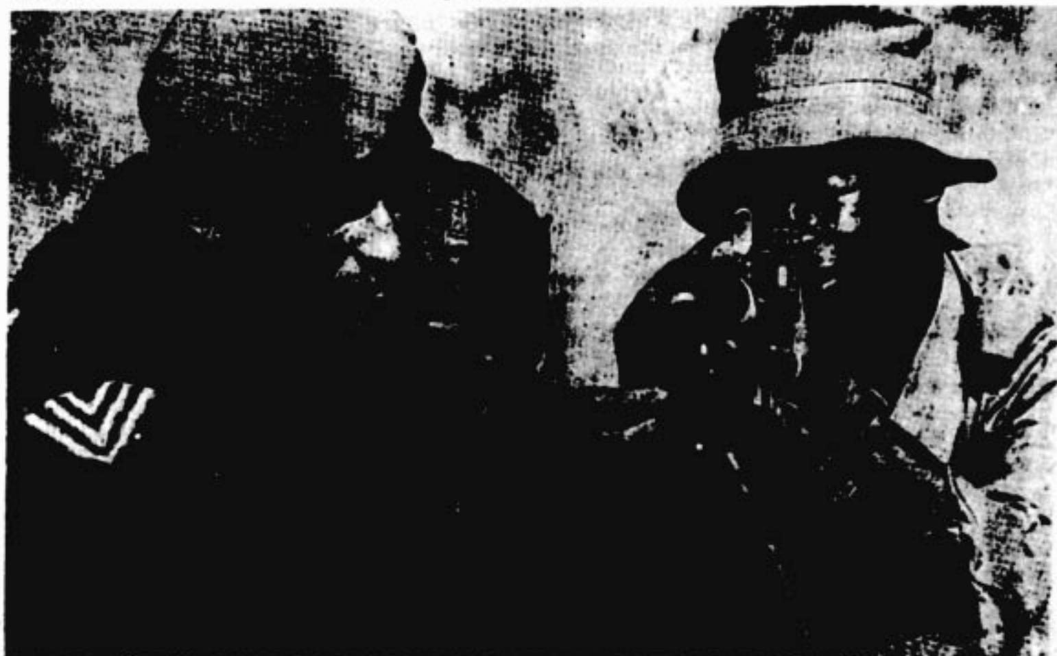
Black mercenary being taught how to kill our people

AMANDLA NGAWETHU!! MAATLA KE A RONA!! MAYIBUYE I-AFRICA!! IHLOMILE!!