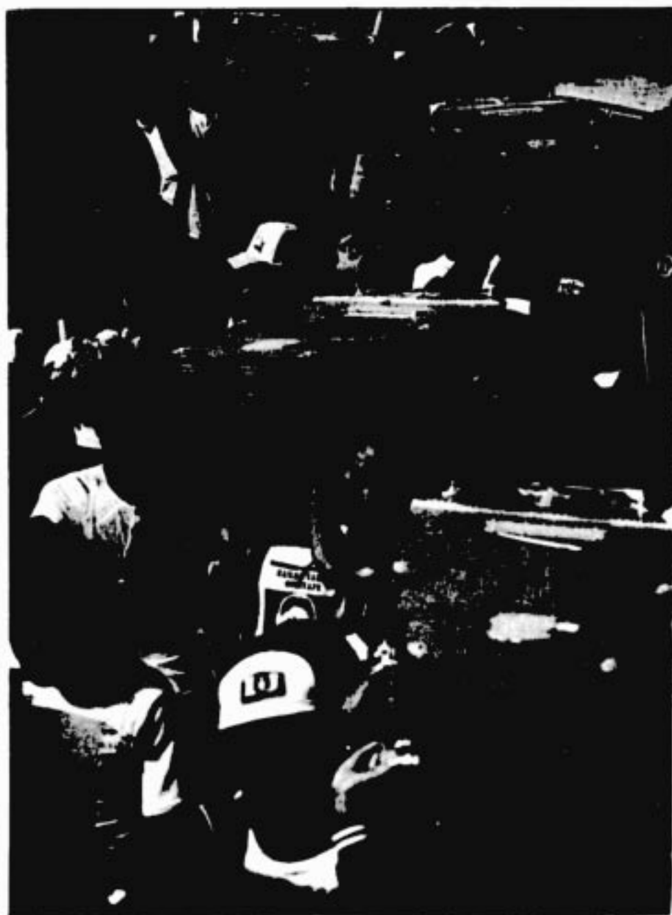
MASS FUNERALS OF PATRIOTS ARE NOW BANNED!