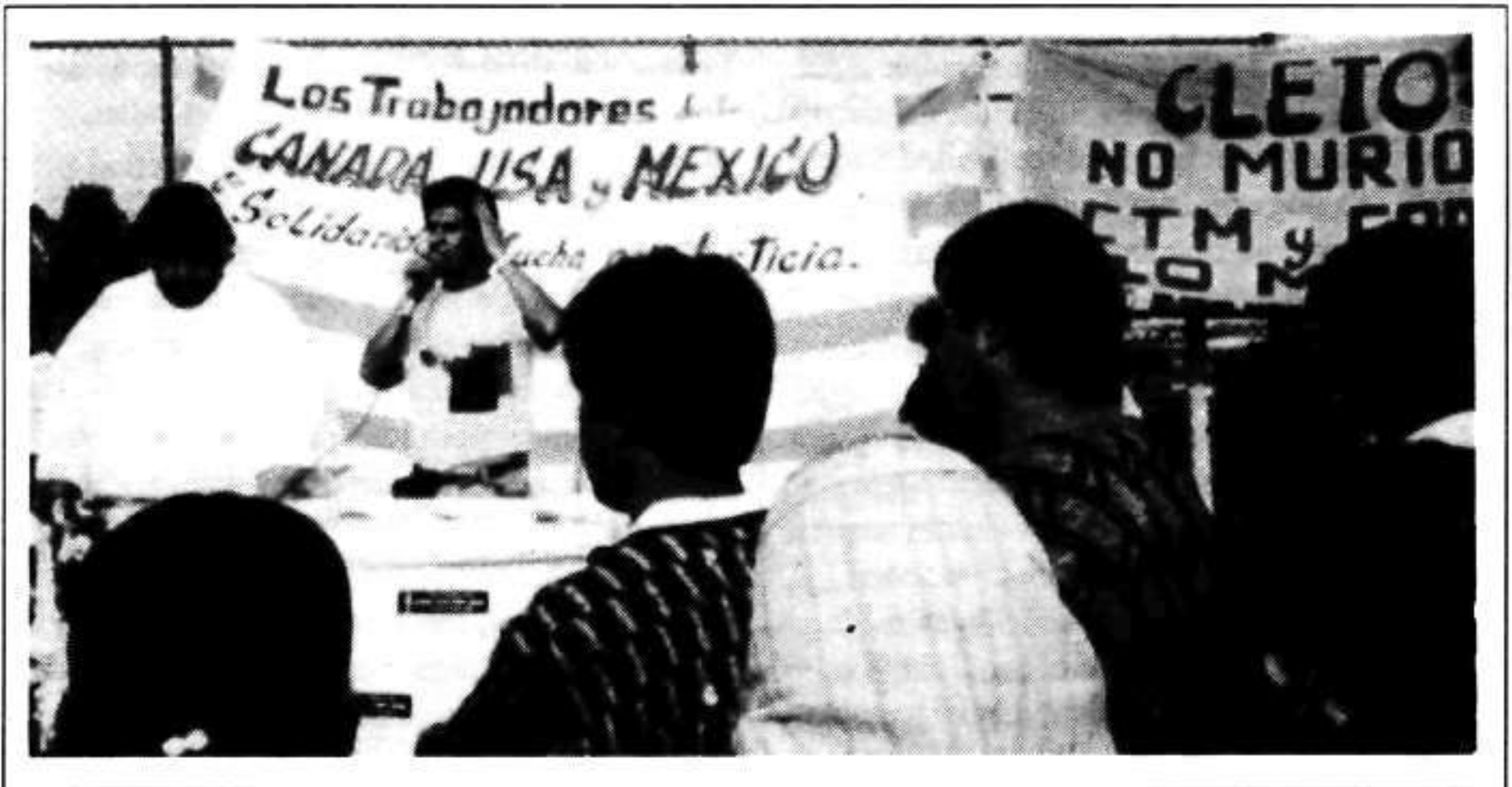
US and Mexican workers at a solidarity meeting

was fifty years ago. The United Auto Workers (UAW) has lost nearly 40% of its members in the past decade, the Teamsters have lost nearly one-third, and other industrial unions have had similar losses.