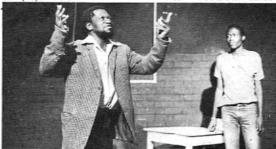
A scene from 'Night of the long day'.