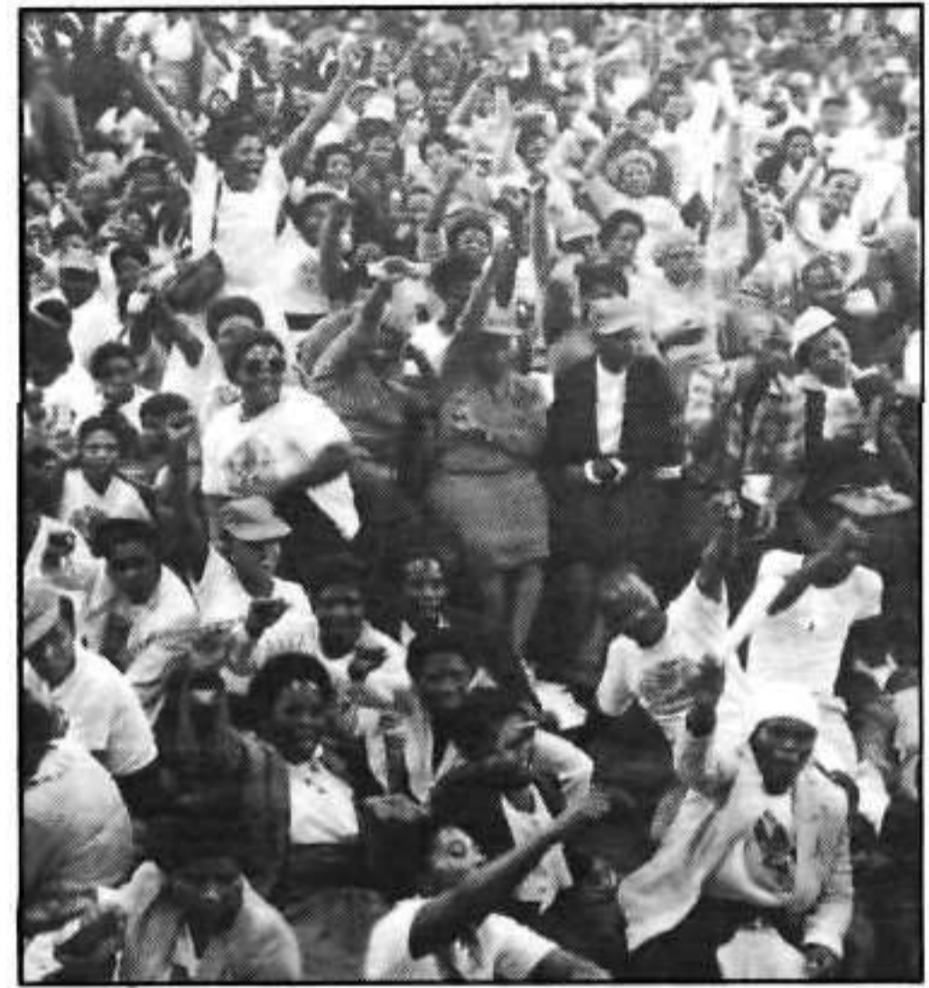
Jubilant textile workers at their union's AGM

'Up to now we have been plagued by the lack of a united trade union movement....If we