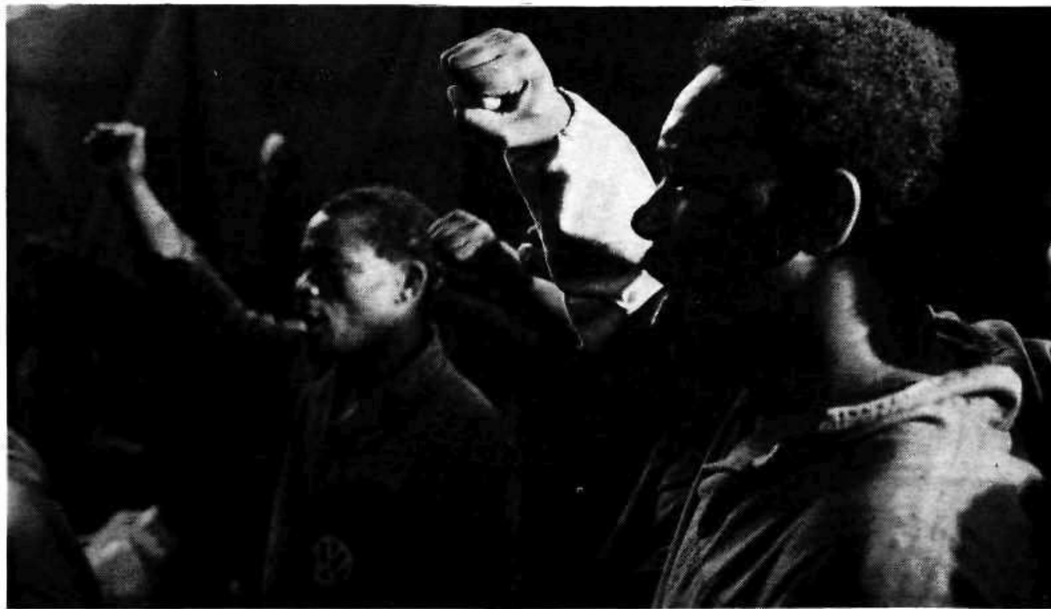
Workers at Volkswagen sing Nkosi Sikelela during the memorial stoppage

OVER 8 000 workers in FOSATU's Uitenhage factories stopped work for 15 minutes on March 28 in memory of those killed at Langa a week earlier.