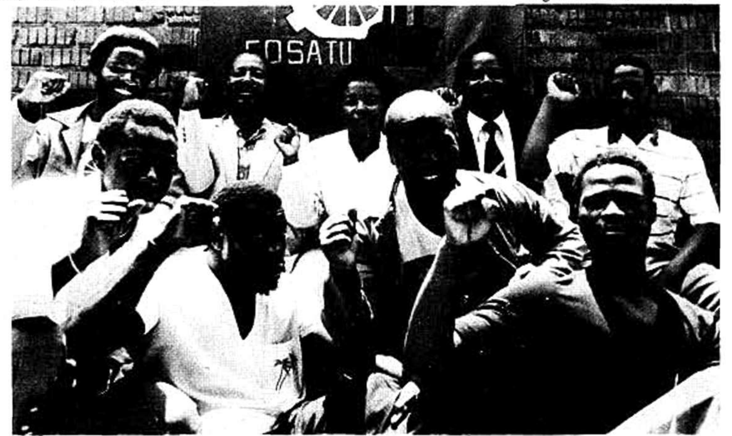
Stobar shop stewards celebrate their victory with organisers at FOSATU's Kempton Park office.

Management will have to think twice before arbitrarily firing workers without giving them a chance to argue their case, he added.