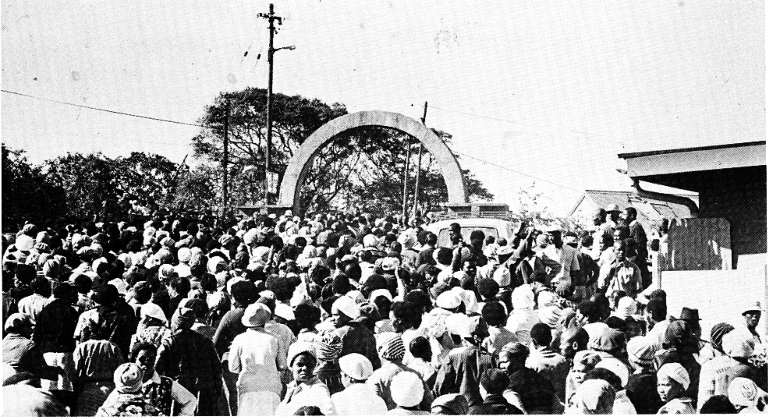
Flashback: The 1980 Frame strikes