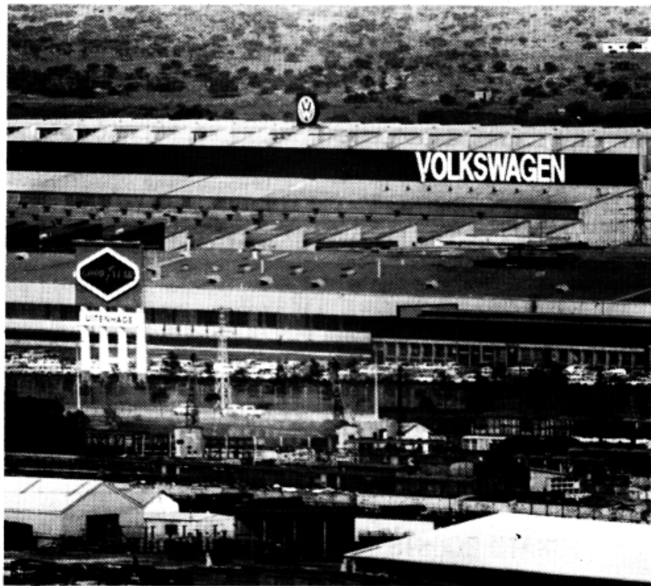
VW Factory at Uitenhage

FOSATU has welcomed this as a great victory for all workers and a guide to future negotiations. FOSATU said that a reasonable wage: