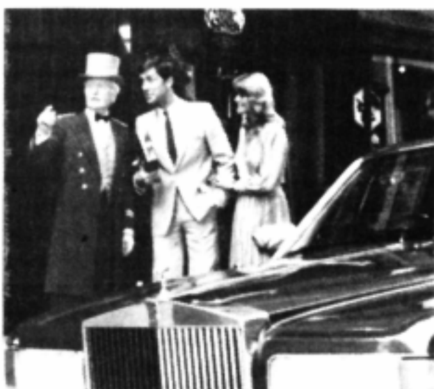
His car and clothes have to be unique. He's got to be different.

This class life is a way of life that we have learned. In the old times all doors looked alike. Today, everybody's aim is to make, paint or deco-