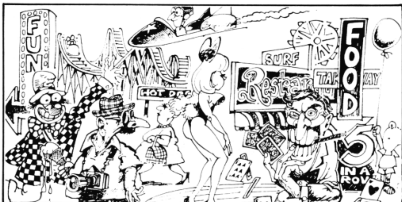
The Rich at Play

We will give them refrigerators and cars which are the symbols of aristocracy. How? Do we give them the possibility to buy? No. If we give