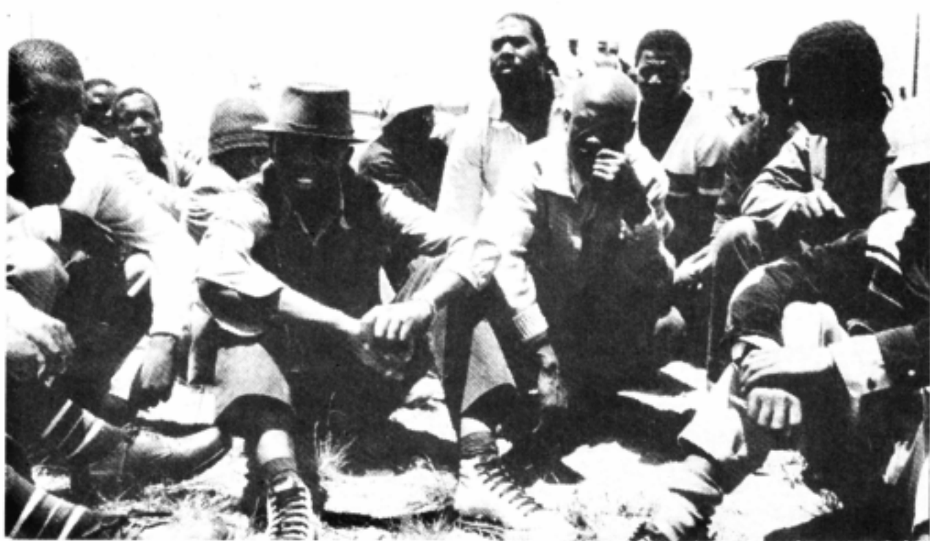
Concentration of workers leads to debates heightening the consciousness of workers.

duction will lead to the concentration of the proletariat. This, in turn, would cause the number of workers to increase, thus accentuating the growth of workers solidarity.