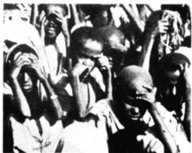
People aware of hunger but not of their unnatural deprivation.

There are many factors through which one can either fool oneself or be fooled by others. What is that fact through which a deprived person may realize that he is deprived? To