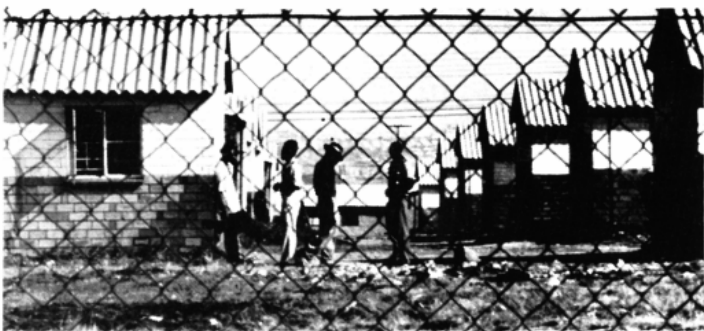
Exploited people live in houses which are identical.

As the employee sees that his boss is even more deprived than himself, he