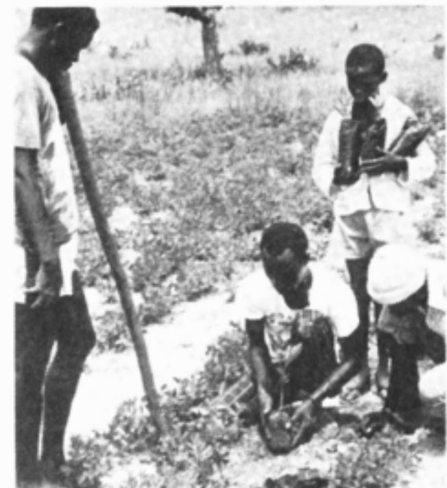
The lack of concentration of workers on farms results in a lack of self-awareness and therefore on awareness of their exploitation.

This will enable the labor force to become even more concentrated. Quality-wise, as capitalism grows, groups of 10, 20 or 30 who used to work together under 100 businessman will now have to work under five capitalists. Thus, concentration of the labor force, capital and pro-