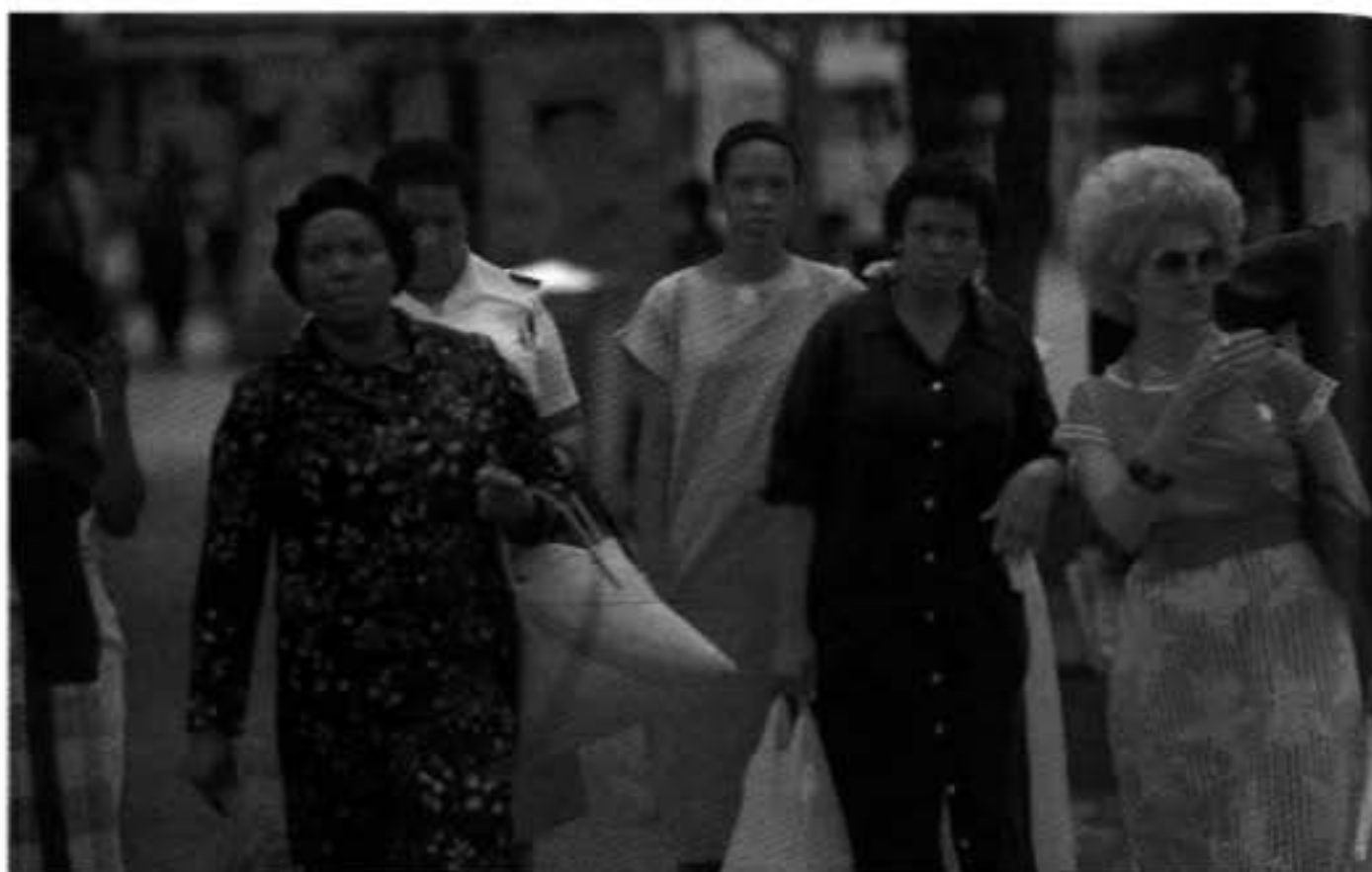
THE VOTERS: divergent hopes, fears.