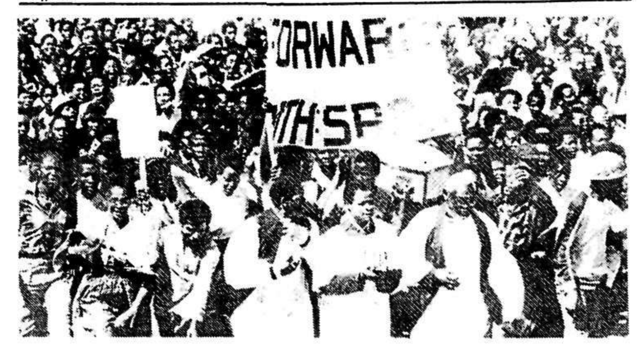
Heroic youth - the young lions

commit against our people, some of its most heinous have been specifically against our youth and children.