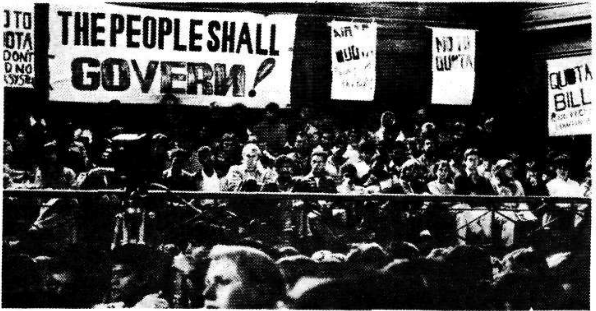
Within the South African borders the struggle against the racists for people's power rages