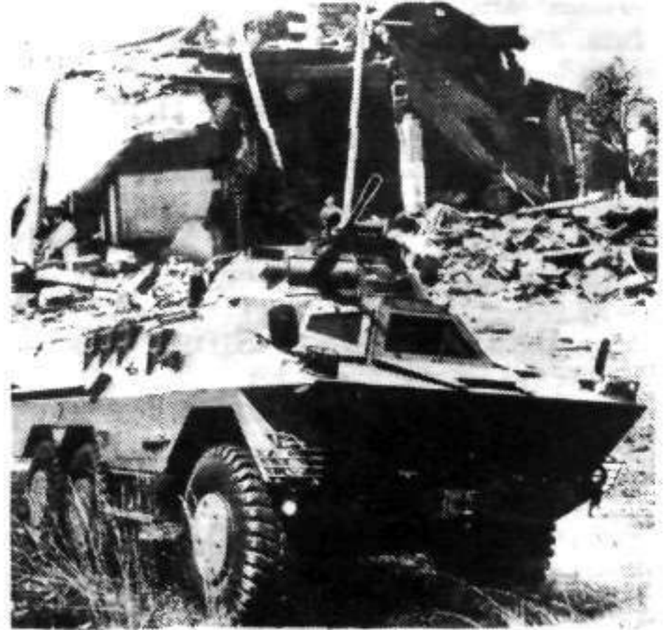
Racists in Angola

Such accords, concluded as they are with a regime which has no moral or legal right to govern our country, cannot but help to perpetuate the illegitimate rule of the South African white settler minority.