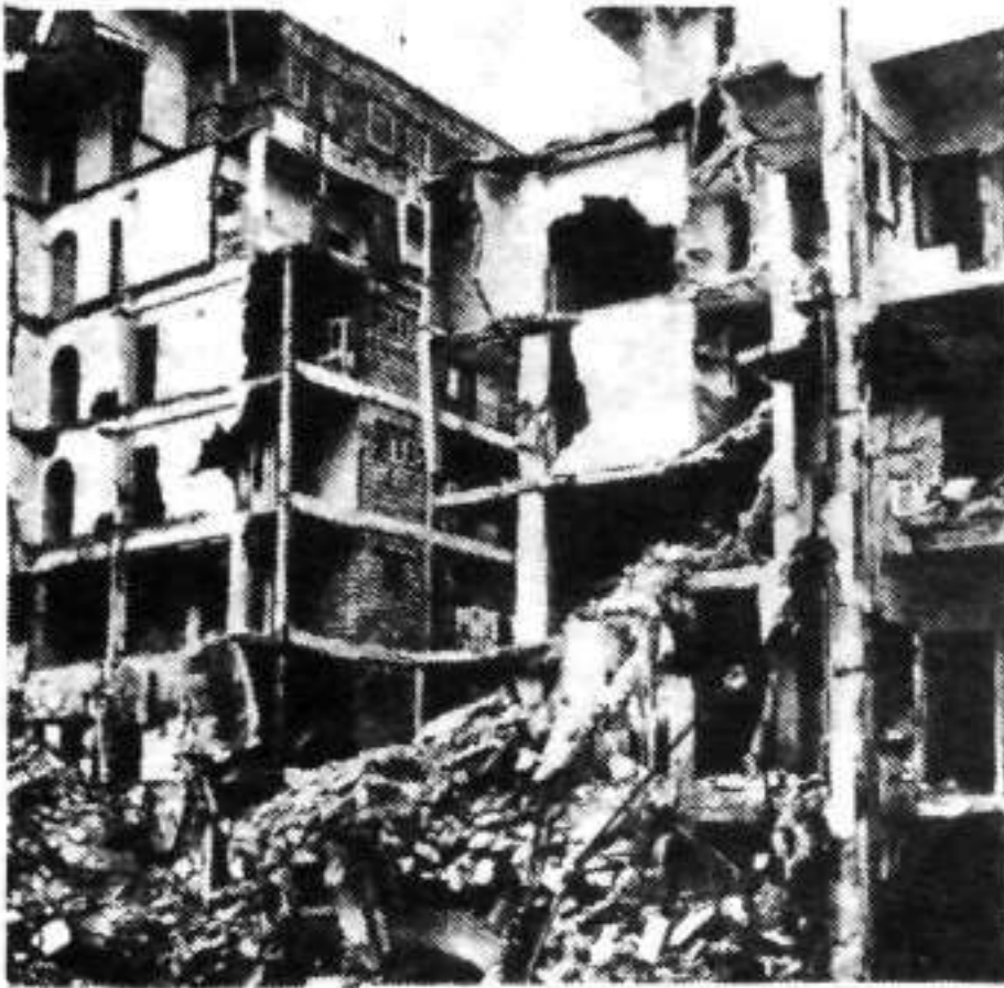
Zionists in Lebanon