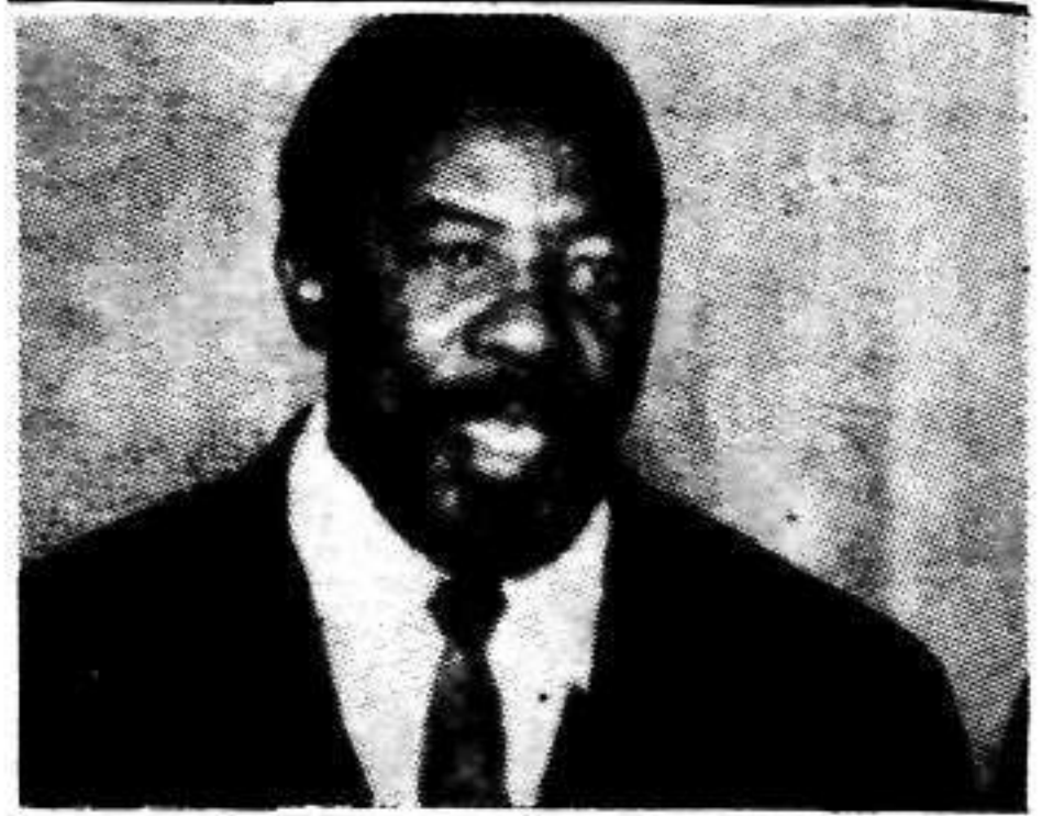
Alfred Nzo-Secretary General of the ANC

THE NATIONAL EXECUTIVE COMMITTEE OF THE AFRICAN NATIONAL CONGRESS HAS MET TO CONSIDER THE CURRENT SITUATION IN SOUTHERN AFRICA