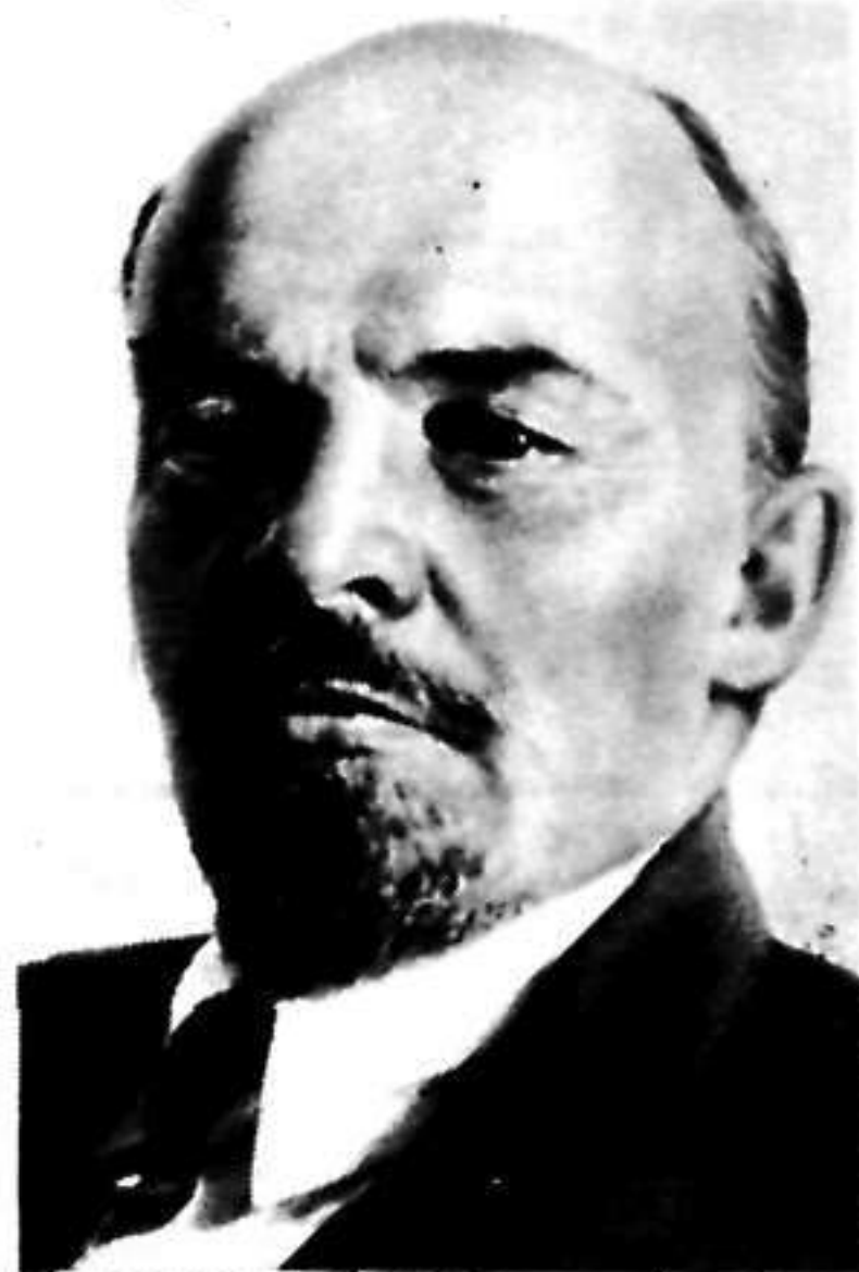
VLADIMIR ILYICH LENIN

An important reason for their confidence is the inability of capitalism