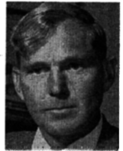
National Chairman of the Liberal Party of S.A.

At the Transvaal Nationalist Congress Dr. Verwoerd's irresponsibility took a different turn. There he suggested that his Government should be given the opportunity of putting to the Protectorates the advantages to them of becoming part of the South African Bantustan complex. Dr. Verwoerd must know that the Protectorate people, many of whom have