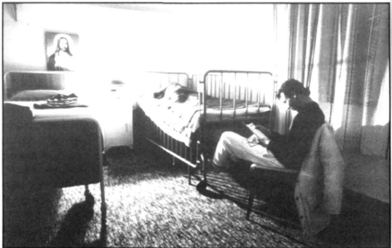
Pietro spends night with Shadrack